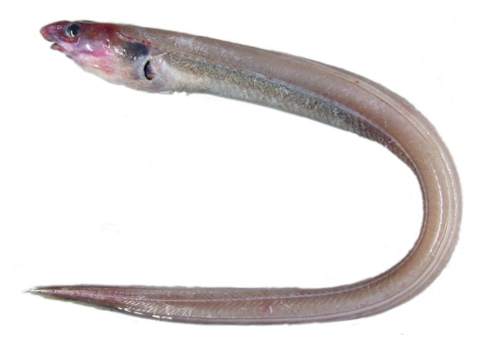
Figure 2. - Pseudophichthys splendens 316 mm TL.