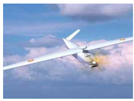
Atlante UAS (example of UAS fitting Indra's Data Link)