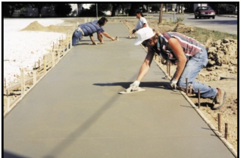
Workmen finishing concrete is a common sight around campus.