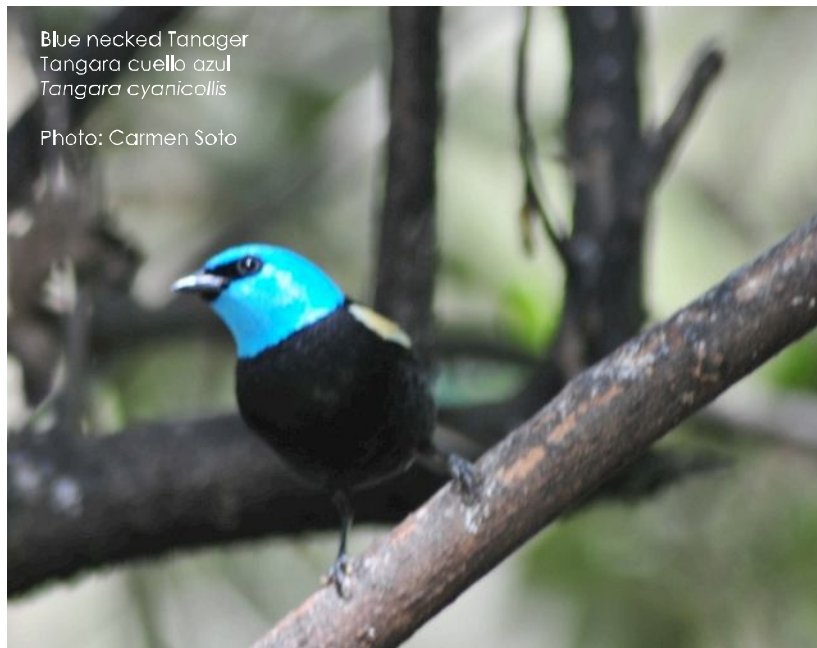
Blue-necked Tanager Tangara cuello azul Tangara cyanicollis