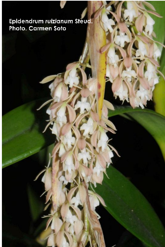
Epidendrum ruizianum Steud.