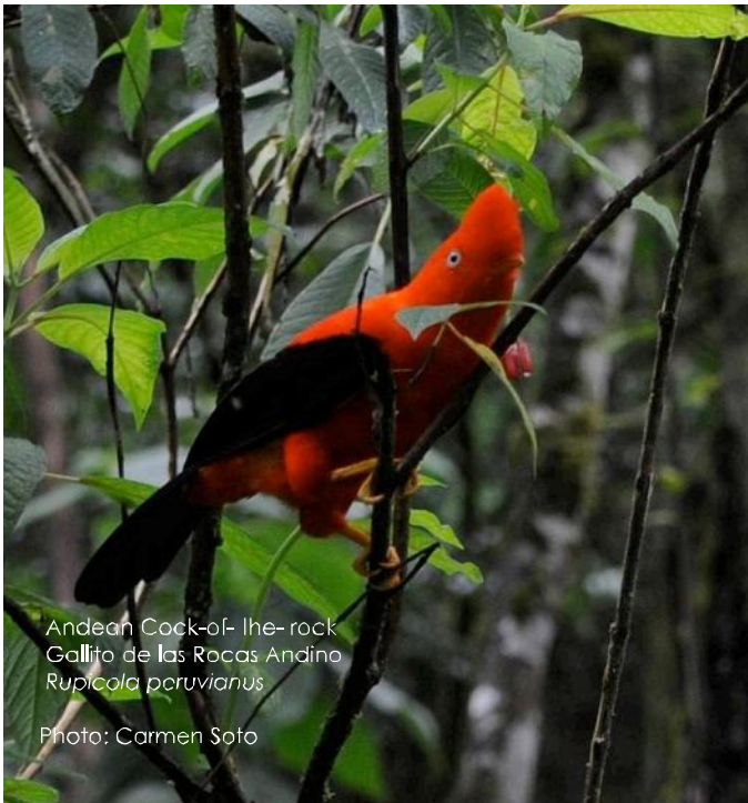
Andean Cock-of-the-rock Gallito de las Rocas Andino Rupicola peruvianus