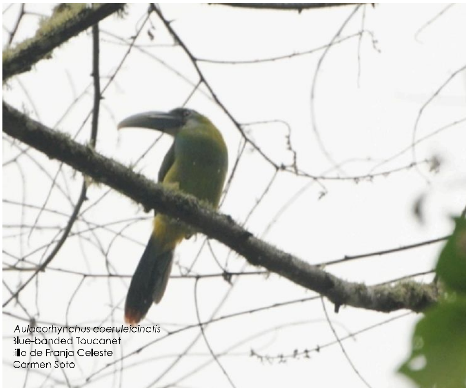
Aulacorhynchus coeruleicinctis Blue-banded Toucanet Illo de Franja Celeste Carmen Soto

Carduelis olivacea Eufonia de Pico Grueso Chlorophonia cyanea