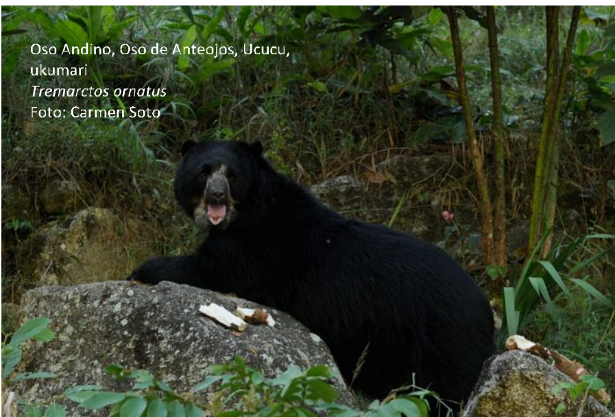
Oso Andino, Oso de Antejos, Ucucu, ukumari Tremarctos ornatus

Andean Bear Rescue Center | ( Tremarctos ornatus ) Inkaterra Asociacion -ITA has created a rescue centre for this unique bear species. The goal of this project is the conservation and research of this bear, but also the rehabilitation and reinsertion of rescued specimens into the wild. The spectacle bear is the only native bear species of South America, and has a distribution that covers the high Andean region of Venezuela down south to Bolivia.