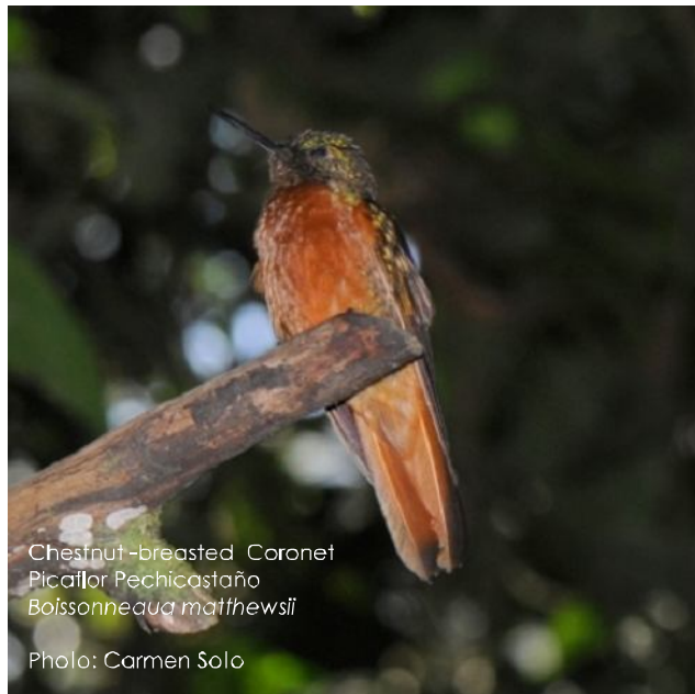
Chestnut-breasted Coronet Picaflor Pechicastaño Boissonneaua matthewsii

Momotus aequatorialis Andean Motmot Relojero Andino