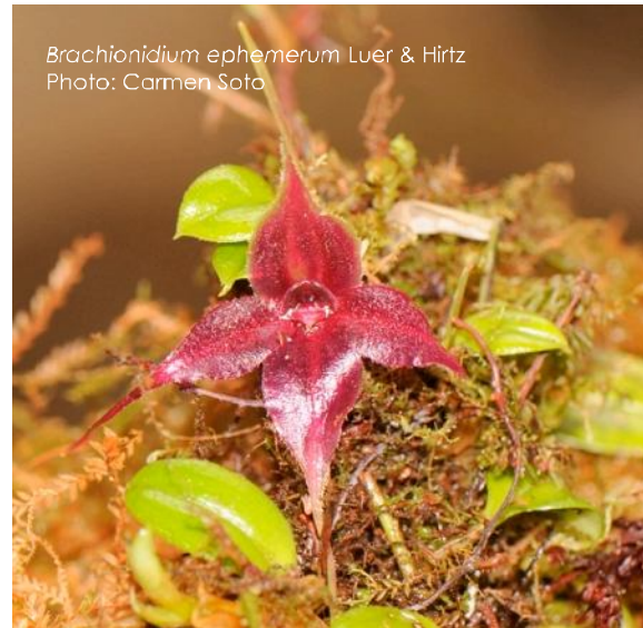
Brachionidium ephemerum Luer & Hirtz

Zootrophion aff. dayanum (Reichenbach f.) Luer