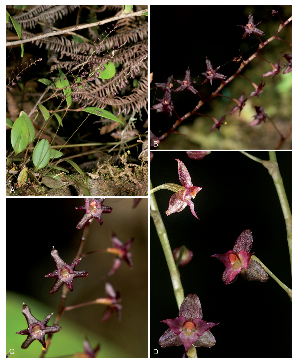
Fig. 2. Stelis machupicchuensis – A: habit of plant; B, C: segments of an inflorescence; D: flowers in close-up. – Photographs: A–C by J. Farfán based on Martel & Farfán 73 (USM!); D by B. Collantes based on the holotype.

2700 m, 20 Mar 2016, C. Martel & J. Farfán 73 (USM! [Fig. 2A–C]).