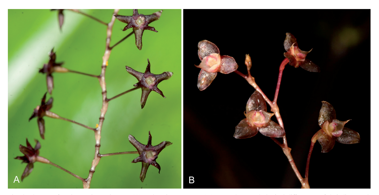
Fig. 4. Flowers of Stelis machupicchuensis (A) and Stelis antennata (B). Note the morphological differences of their lips. Both specimens from the same locality: Wayqecha Biological Station.