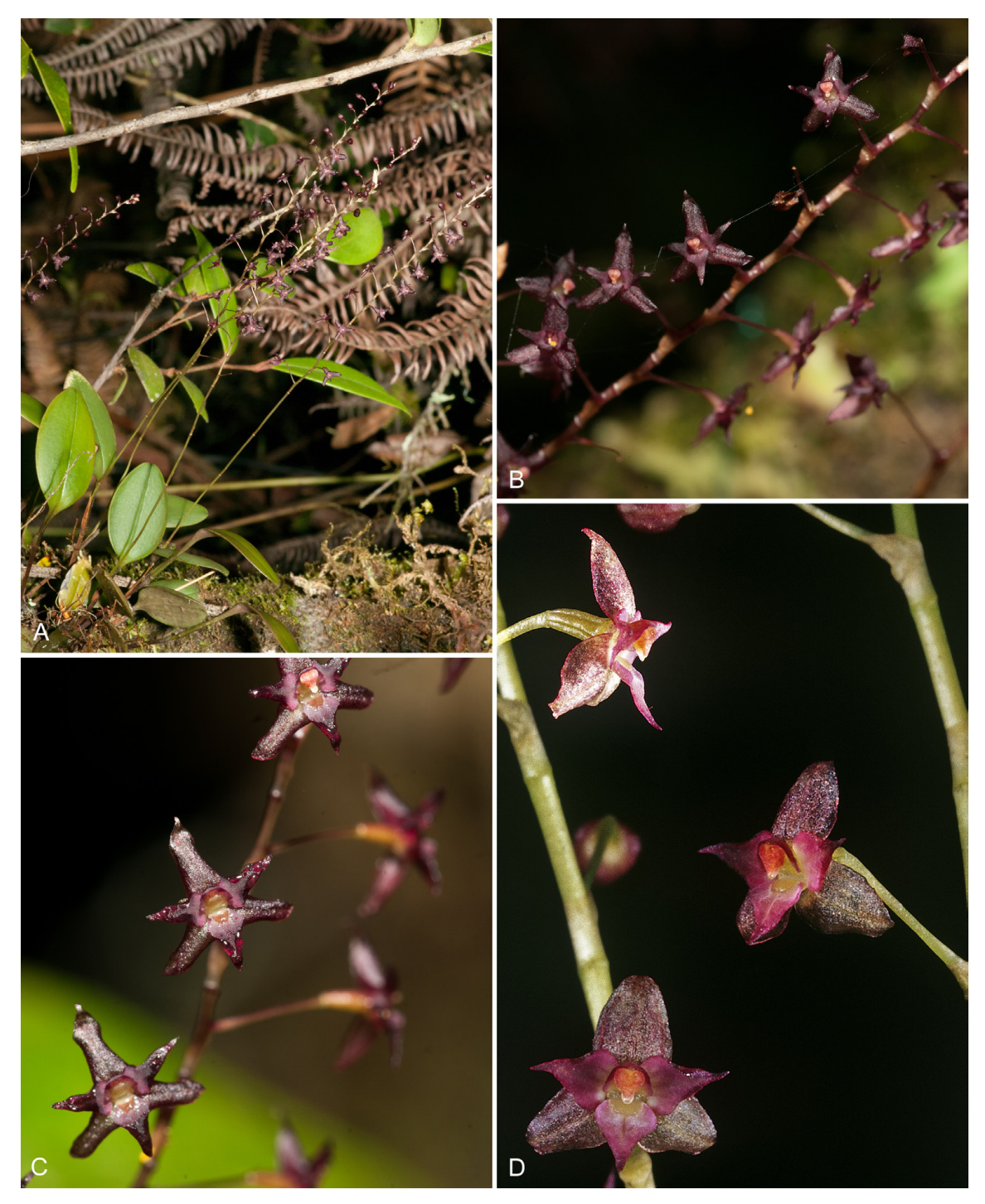
Fig. 2. Stelis machupicchuensis – A: habit of plant; B, C: segments of an inflorescence; D: flowers in close-up. – Photographs: A–C by J. Farfán based on Martel & Farfán 73 (USM!); D by B. Collantes based on the holotype.

2700~\mathrm{m},\,20~\mathrm{Mar} 2016, C. Martel & J. Farfán73 (USM! [Fig. 2A–C]).