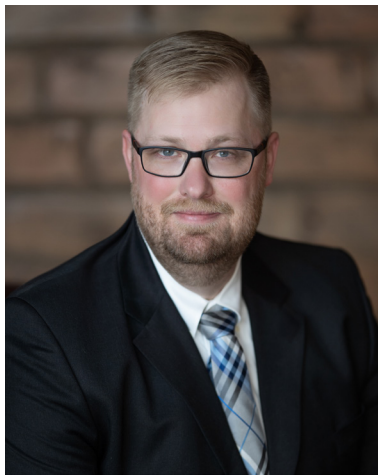
Insurance Commissioner Jon Godfread