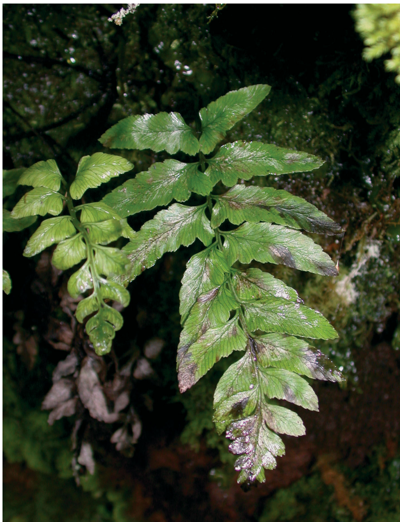
Fig. 1. Diplazium molokaiense in Honomanu Stream, East Maui, Hawai'i