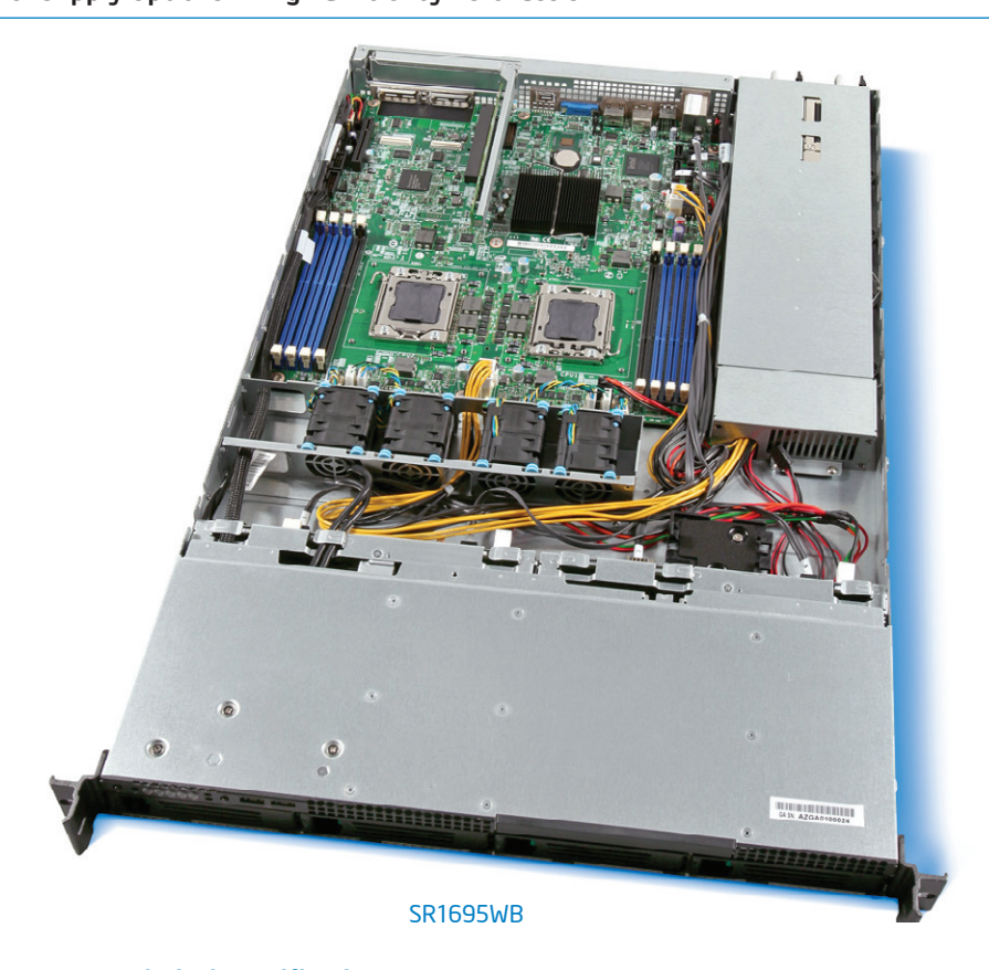
Intel® Server System SR1695WB Technical Specifications