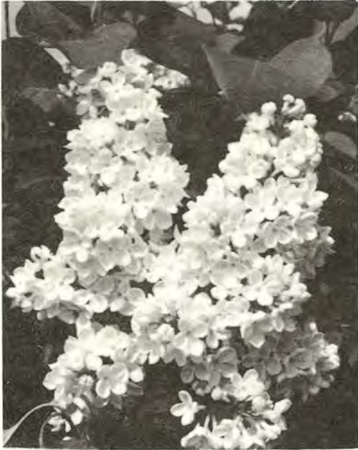
Rochester seedling raised by Fr. Fiala at Falconskeape, which he named in honor of LILACS editor's late mother, Gertrude Clark.

ONE SOMEWHAT unpretentious project, dating from 1948 when I was plant propagator, was the sowing of specially collected lilac seeds. As time passed, however, this project took on more significance, resulting in the selection of a lilac which appeared with superior flowering characteristics: slow-growing habit, erect clusters of pure white flowers. In 1963 this seedling was named 'Rochester.'