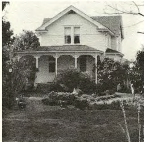
BELOW: Tenant House driveway. Alba, lilarosa