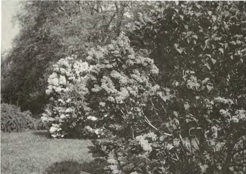
Flower City, an outstanding Rochester seedling at Highland Botanical Park.