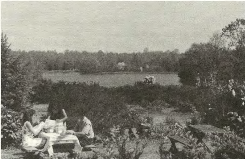
Lilacs and dogwoods at Falconskeape.