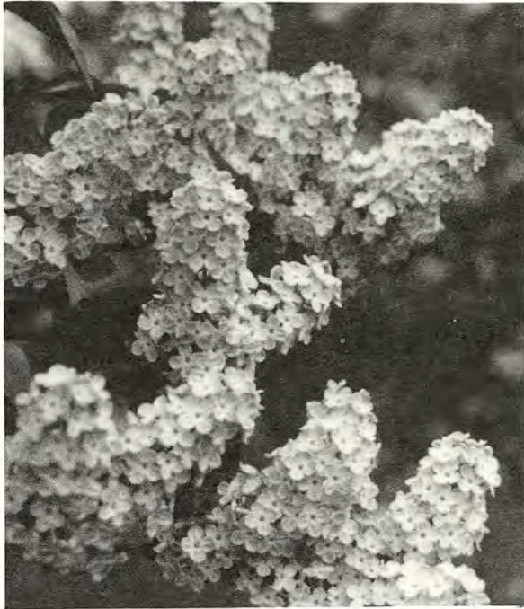
General Sherman lilac.

The most popular of Dunbar's seedlings is 'President Lincoln' which he held to be "perhaps the bluest of the single-flowered lilacs in cultivation." Mrs. McKelvey considered its color "unusual among lilacs." Dunbar called it Wedgwood blue, even though the hue is more violet than blue. Nevertheless it remains the standard blue lilac even today. It is a cultivar of the old-fashioned 'Alba Virginalis' and is among the very earliest of the French hybrids to bloom. Also it is a vigorous plant — so much so that the long thyrses are often hidden among the rapidly lengthening shoots before the flowers fade.