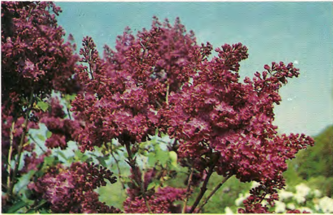
TOP LEFT: Flower City