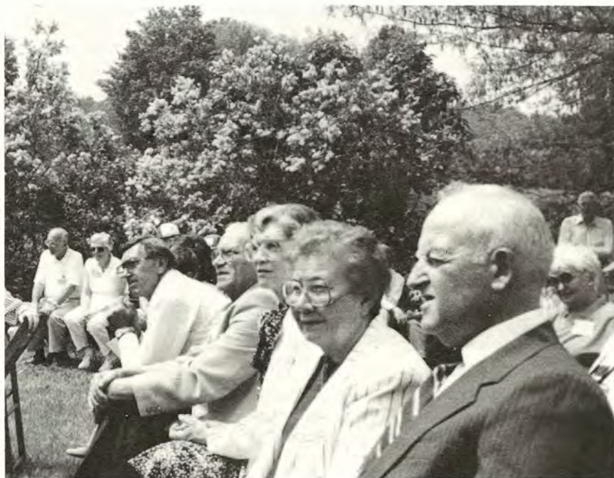
Some of the guests attending Grape Hill Garden dedication ceremonies.

Following the ceremonies and introductions, a buffet luncheon was served on the lawn under 100-year-old trees.