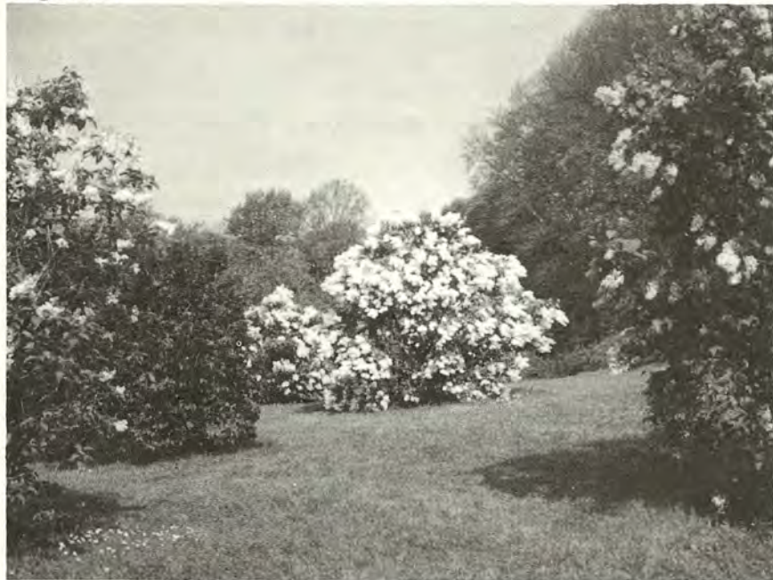
Sovietzkaya Arktika at Highland Botanical Park.