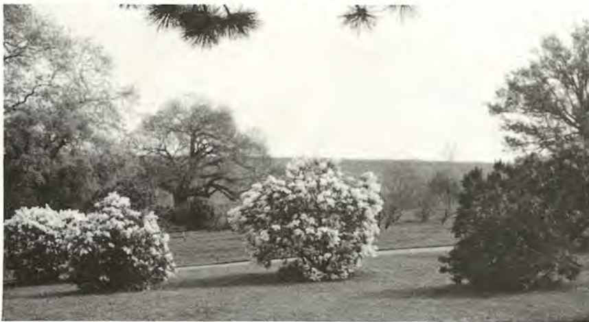
Two F.L. Olmsted lilacs (left), Sovietskaya Arktika (center), Znamia Lenina (right).