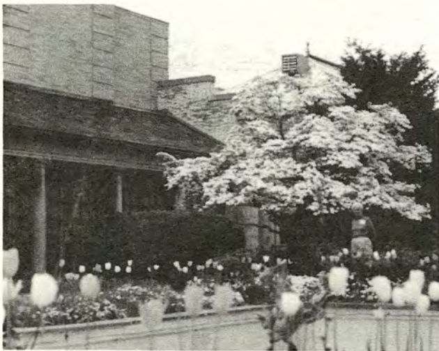
UPPER LEFT: Grape Hill Gardens Dedication