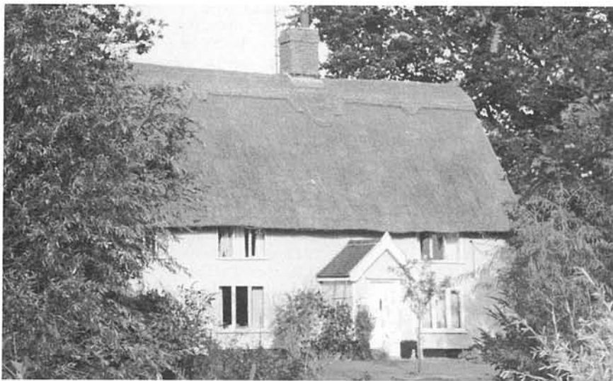
Chapman Home, Norman Farm (built in 1518). Pan Meadow Lilac Collection, Wyvetstone, Stowmarket, England.