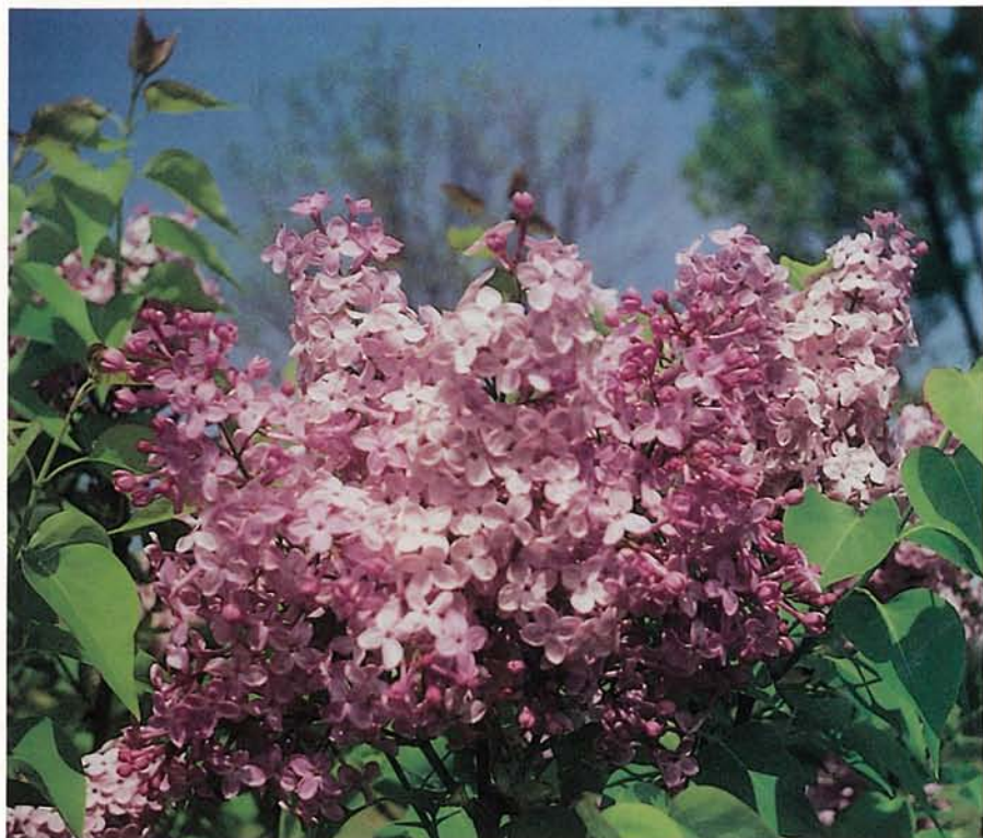
Syringa x hyacinthiflora 'Assessippi'