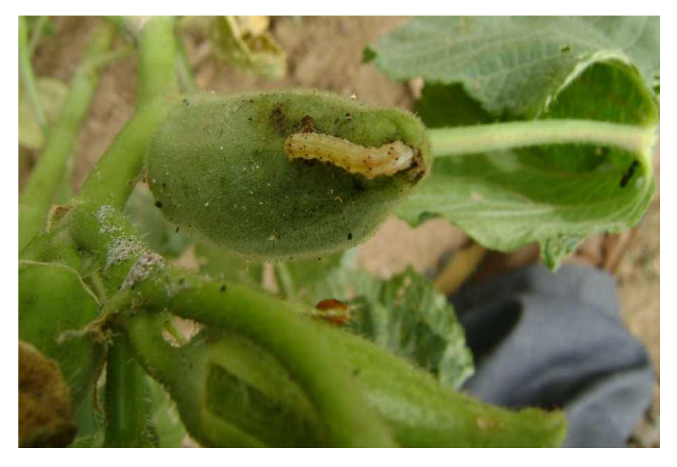
Figure 4. Earias sp (larva) on okra.

nof fruits while the Control recorded the least in the minor rainy season of 2010. Ecogold-treated plants produced the heaviest okra fruits for both dry (336 g) and minor rainy (341 g) seasons. On the other hand, garlic extract-treated plants produced the heaviest fruits of eggplant for both dry (267 g) and minor rainy (287 g) seasons. For