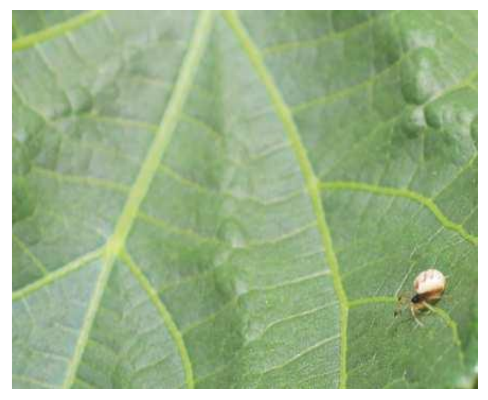
Figure 9. Predatory spider on okra plant.