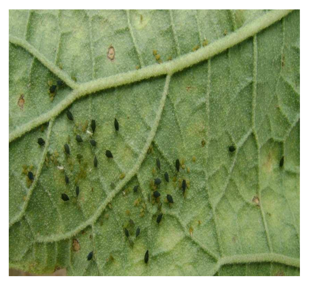
Figure 5. Aphids attack on egg plant.