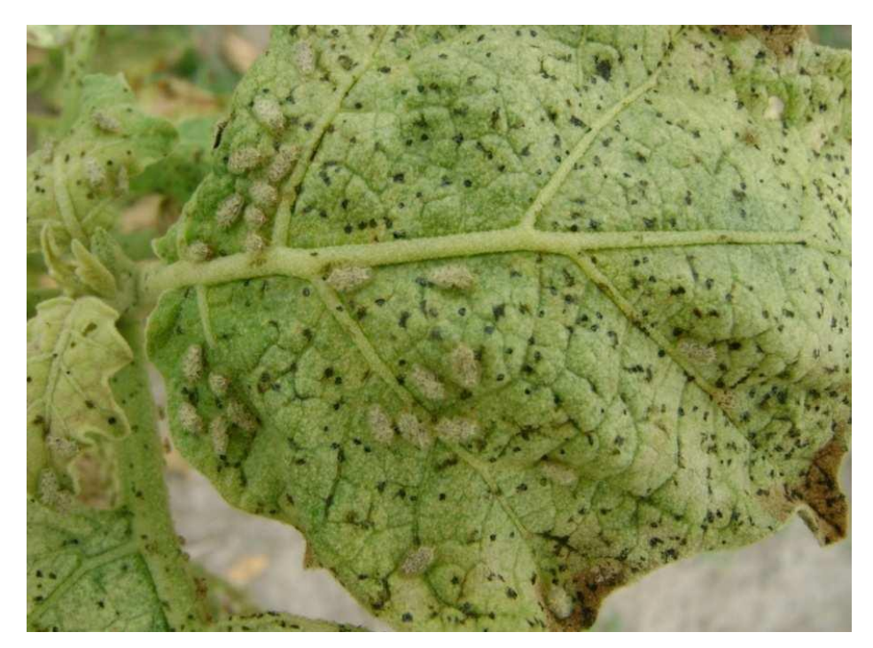
Figure 6. U. hysterricellus attack on eggplant.