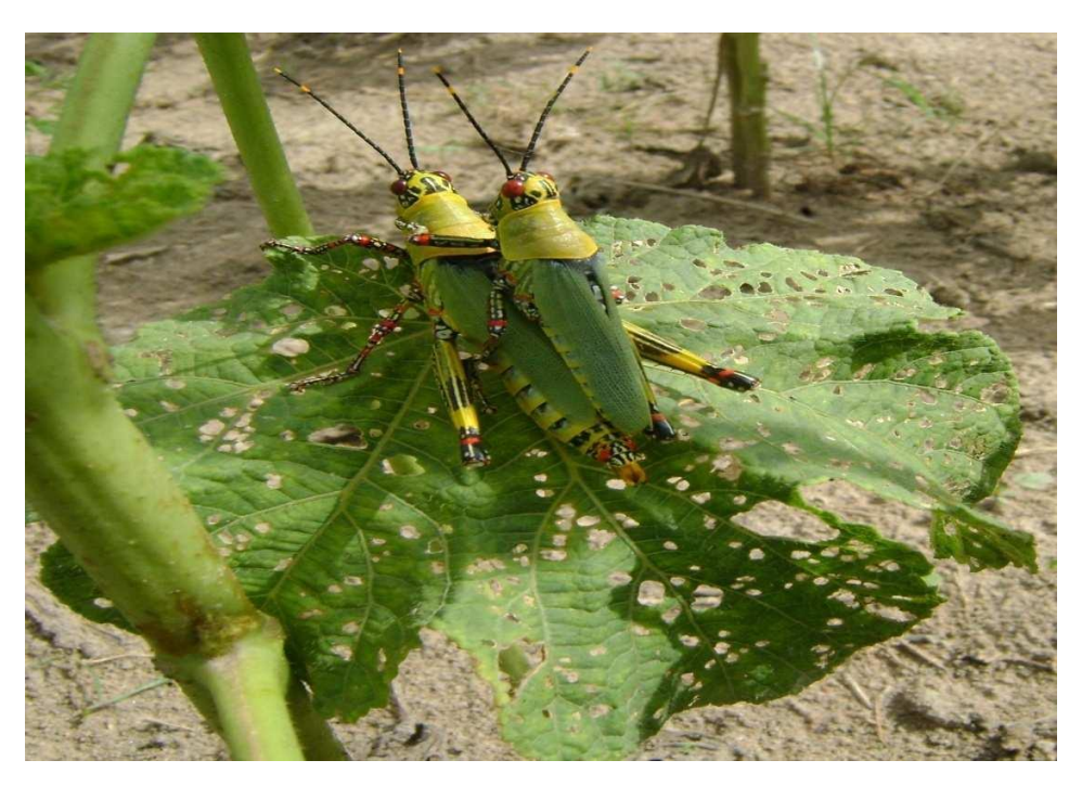
Figure 3. Z. variegatus mating on okra.