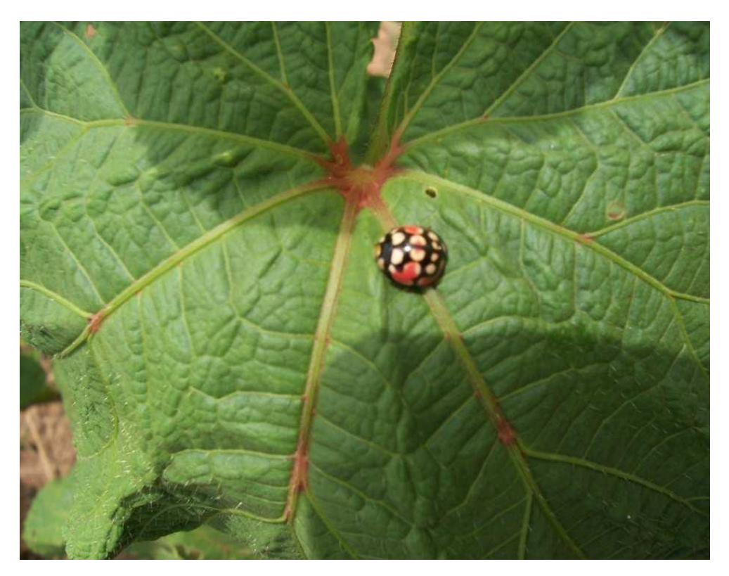
Figure 8. Cheilomenes sp on okra plant.