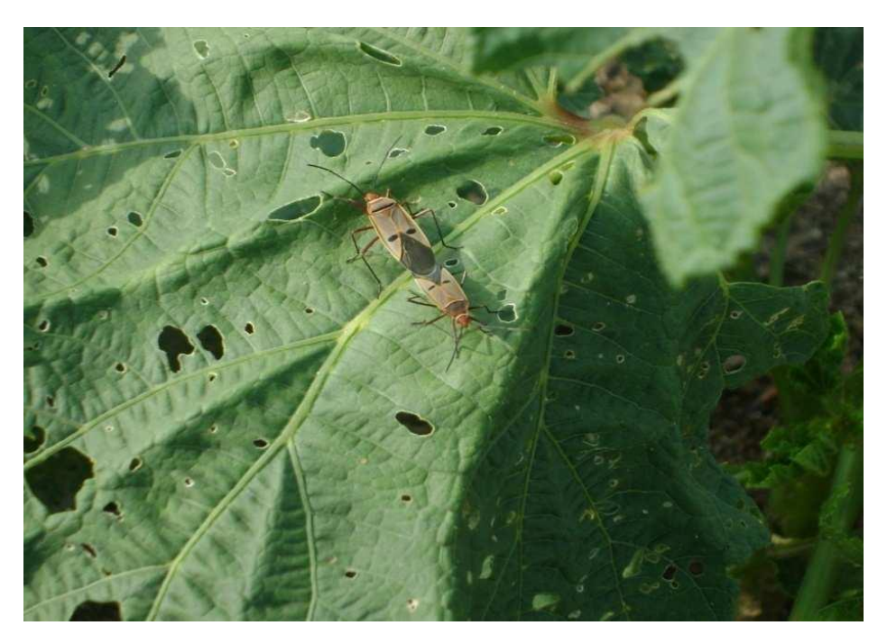
Figure 2. Dysdercus sp. mating on Okra.

(P<0.05). On Okra, Ecogold, Alata soap, neem oil and garlic were observed to have performed better in terms of plant height compared with the wood ash and the Control. In terms of number of fruits, all the botanicals performed better than the control. Ecogold performed best in terms of fruit weight compared to the Control