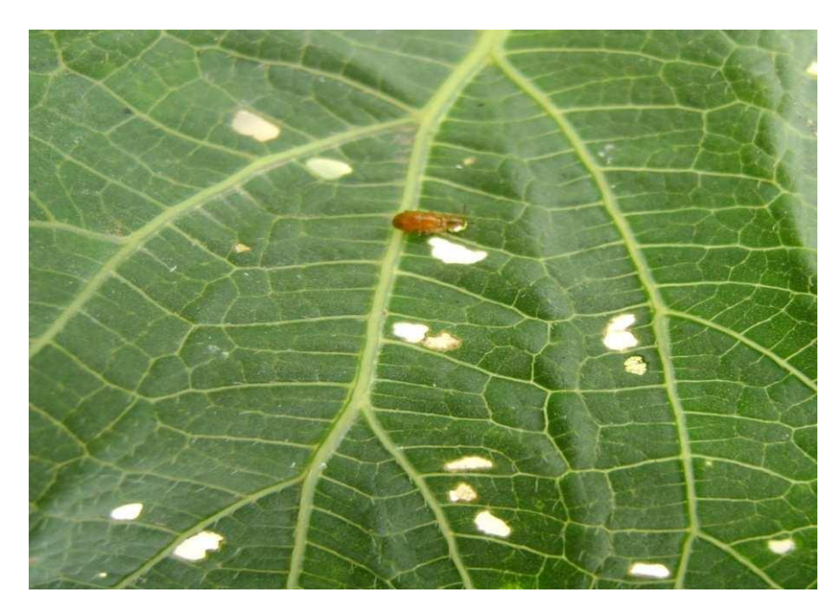
Figure 1. Podagrica sp on okra.