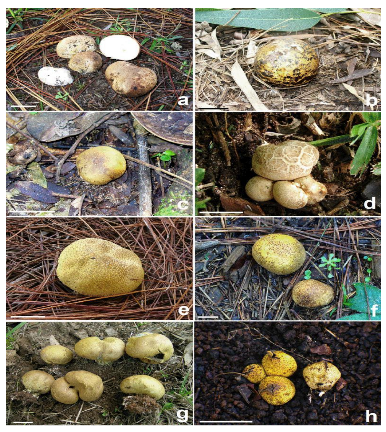
Figure 1. Basidiomata of gasteroid Boletales . (a) Rhizopogon roseolus . (b) Pisolithus arhizus . (c) Scleroderma albidum . (d) S. bovista . (e) S. citrinum . (f) S. fuscum . (g) S. laeve . (h) S. verrucosum . Scale bar = 20 mm.

distinct rhizomorphic base, commonly forming pseudostipe in larger and older specimens. Peridium thin (<0.5