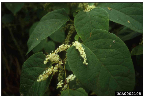
Figure 1. Fallopia japonica .

Japanese knotweed ( Fallopia japonica var. japonica [Houtt.] Ronse Decraene) (Fig.1) was introduced to North America in the late 19 th century (Pridham and Bing, 1975; Patterson, 1976; Conolly, 1977). It rapidly spread to become a problem weed, mirroring its history in the United Kingdom and Europe where it has been present since the 1840s (Beerling et al. , 1994). Fallopia japonica is now officially regarded as the most pernicious weed in the United Kingdom (Mabey, 1998), and it is one of only two terrestrial weeds restricted under the Wildlife and Countryside Act 1981, making it illegal to plant it anywhere in the wild. Fallopia japonica is becoming widely recognized as a problem in the United States and some legislation to control it has been introduced in Washington state, where it is designated for mandatory control where not yet widespread. In Oregon, its planting is prohibited in at least one county (Washington State Department of Agriculture, 1999; Multnomah County, Oregon Land Use Planning Division, 1998). In other states, including Tennessee and Georgia, the recently established Exotic Pest Plant Councils list F. japonica as a species of concern and a “severe threat” (Tennessee Exotic Pest Plant Council, 1996; Murphy,