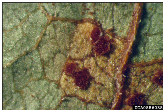
Figure 4. Puccinia sp. on Fallopia japonica in Japan showing urediniospores.

In Japan, F. japonica also is attacked by a suite of fungal pathogens in the field, including Puccinia polygoni-weyrichii Miyabe, whose erupting uredinia are shown in Fig. 4. It is apparent that a combination of insect and fungal agents severely damages the plant in its native range, reducing it to an innocuous member of the flora in competition with the other members of the “giant herb” community common in Japan.