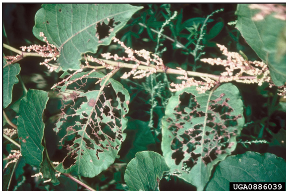
Figure 3. Leaf feeding damage to Fallopia sp. in Japan 1999.

Stem-mining Lepidoptera, found in the internodal sections of stems of the closely related F. sachalinensis , are so numerous that they are regularly used as fishing bait (Sukopp and Starfinger, 1995). Zwölfer (1973) reported complete skeletonization of this plant in the field in 1972, noting that the “apparently specific leaf-feeding chrysomelid beetle Gallerucida nigromaculata Baly (Fig. 3) seems to play a role in the natural control of Polygonum (cuspidatum) and may be a promising candidate for the biological control of P. cuspidatum in Europe.”