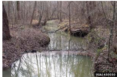
Figure 11 - Forest stream

These areas are protected because of water quality and erosion concerns. They can be refuges for invasive plants which can spread into adjacent lands. Since SMZs are adjacent to drainages, streams, or rivers, invasive plants that favor wet areas, streambanks, or bottomlands are likely to be present.