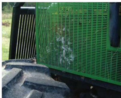
Figure 18 - Cogongrass seeds on radiator screen