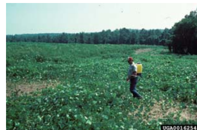
Figure 12 - Newly planted pine stand invaded by kudzu

This category covers practices used when converting lands previously under cultivated agriculture or pasture into trees. A different suite of invasive plants can become problems in areas undergoing land use conversion. Established invasive plant populations or viable seedbanks may exist in agricultural fields or pastures. Fencerows may serve as a harbor for these invasives. A plant that was a minor pest in the previous land use may not be inhibited by the current management practices and suddenly expand its population drastically.