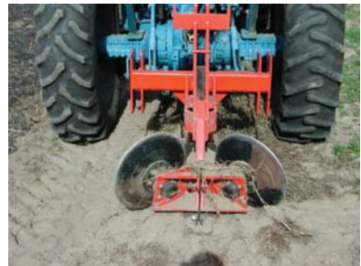
Figure 7 - This scalper could carry plant roots and rhizomes across sites.