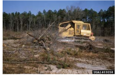
Figure 5 - Site preparation creates bare soil and high light environment conducive to invasive establishment and spread.