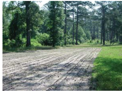
Figure 10 - Wildlife food plot

Wildlife enhancement involves any practice that can improve or enhance the wildlife habitat on a land, such as food plot installation, fertilization, and selective thinning and planting. This is a varied category but can include aspects of other silvicultural practices. Wildlife enhancement practices are a common avenue for invasive plant introductions, either via contaminated equipment or intentional planting. Areas to monitor for any invasive plants are camps, food plots, and other areas used.