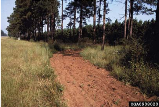
Figure 15 - Fire break