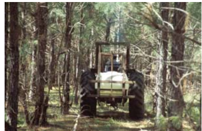
Figure 8 - Release treatments create high light environments conducive to establishment of invasives.