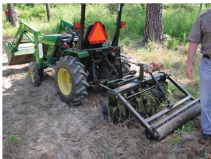
Figure 17 - Food plot equipment with plant material that can be transported to other sites