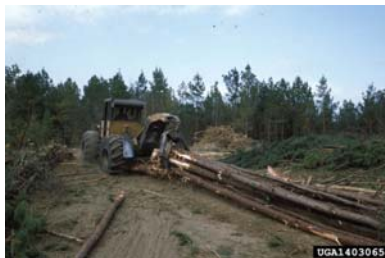
Figure 1 - Skidding can spread invasives across the harvest tract.