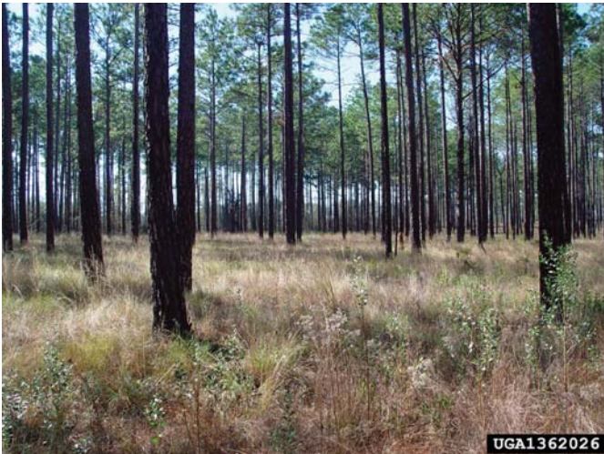
Figure 21 - Native longleaf wiregrass stand