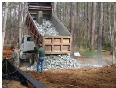
Figure 3 - Road construction introduces off-site materials which may contain invasives.