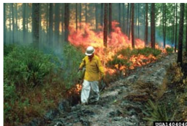
Figure 2 - Prescribed fire can be used to control certain invasive species and spread others.