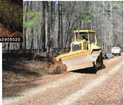
Figure 16 - Road maintenance