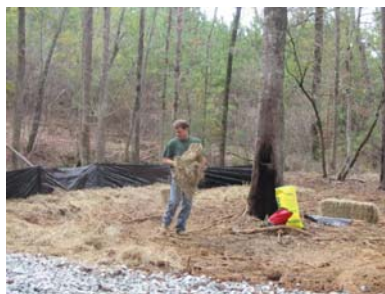
Figure 4 - Straw mulch may harbor seeds of invasive plants