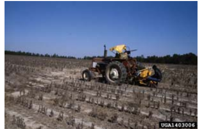
Figure 6 - Tree planting equipment may harbor invasive seeds or plant material.