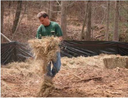
Figure 19 - Applying mulch for soil stabilization