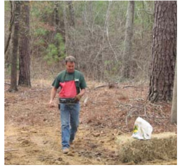
Figure 20 - Seeding