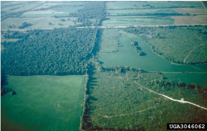
Figure13 - Harvest tract with SMZs and fencerows