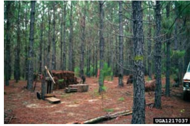
Figure 9 - Pine straw production

Many pine stands are managed for pine straw production. The needles that are naturally shed from pine trees are raked, baled, and sold as pine straw mulch. Pine straw production involves managing stands for optimum straw production, removing understory vegetation with herbicide and/or fire, collecting (raking) the straw, and making bales. Often practices such as prescribed fire, mowing, and herbicide treatments are used in production areas. Stand alterations include soil disturbance, removal of understory and midstory, and increased light to the forest floor. Bales and equipment from infested stands can foster the widespread distribution of invasive plants.