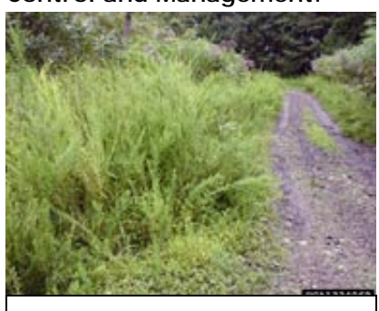
Sericea Lespedeza infestation