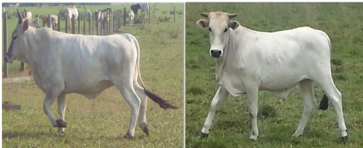
Cream white dress

As for the N'Dalores 2 animals, NNDL, the coats are fawn, cream-white and gray-white.