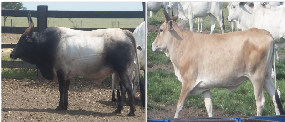
Gray-white coat, with dark spots