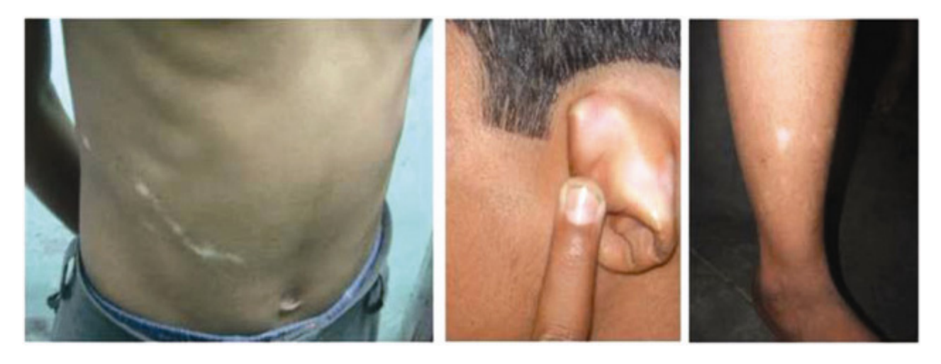
Figure 3. Younger brother exhibiting nevus depigmentosus on his abdomen and vitiligo lesions on postauricular areas and right leg.

advantage of genetic study was not available in our set up.