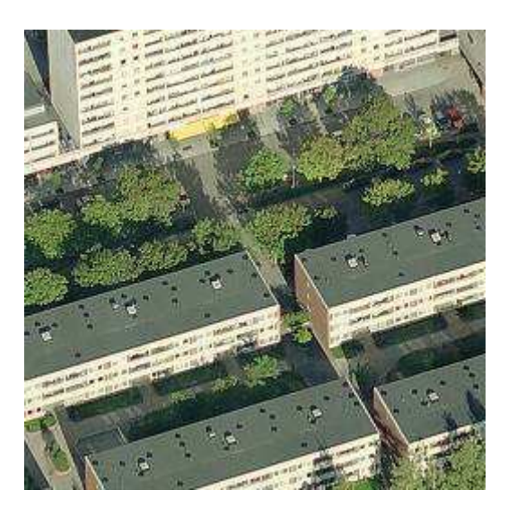
Fig. 2 Part of the existing building area, Traktören