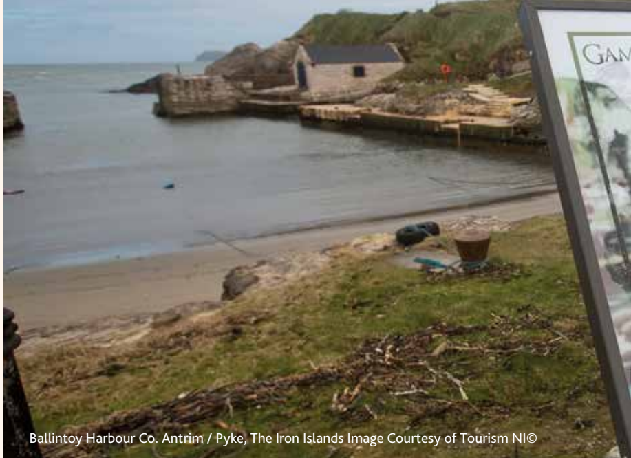
Ballintoy Harbour Co. Antrim / Pyke, The Iron Islands