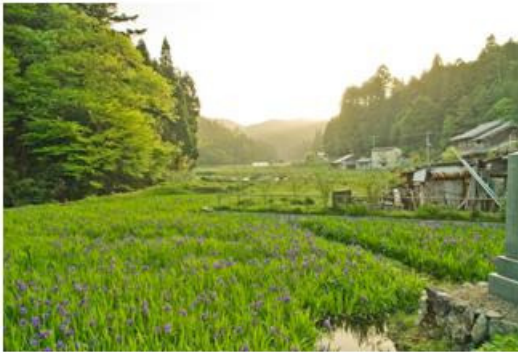
Figure 2: Iris laevigata in the wild in Kyoto Japan.