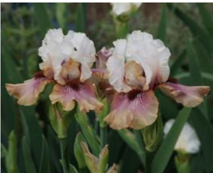
'Have a Goodun'