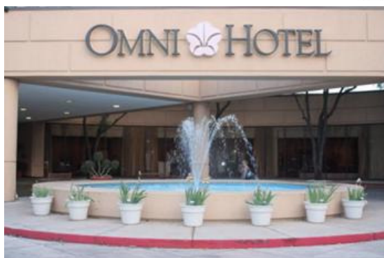
Omni Southpark Hotel