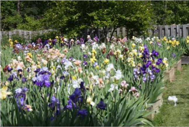
Winterberry Gardens Spring 2008