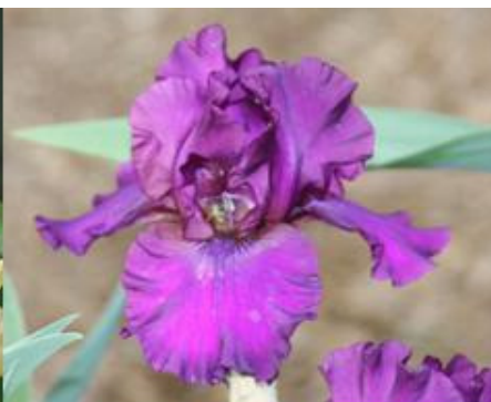
'Love at First Sight' Crump (2007)