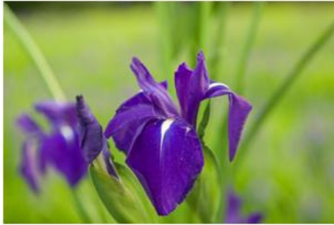
Figure 1: Iris laevigata in the wild in Kyoto Japan.