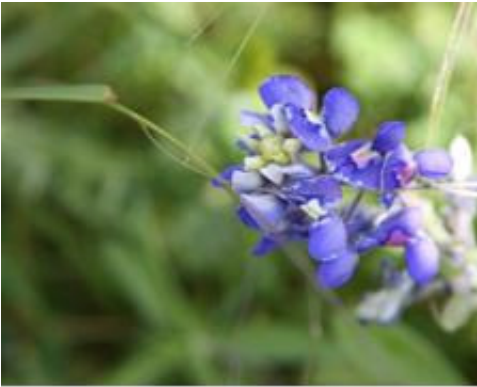
Texas Blue Bonnet