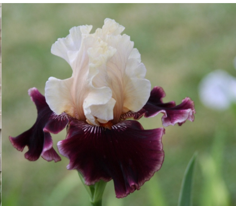
'TASTE OF MAGIC' Blyth 2006