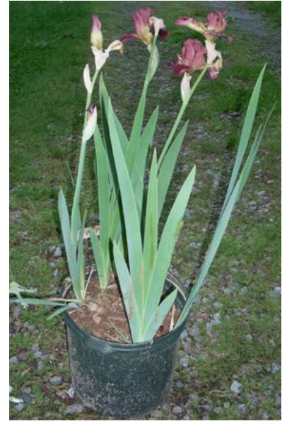
A Potted TB, Sioux Uprising

.I have successfully had irises to bloom in pots but only if both the height and the width are equal to about half the height of the bloom stalks - oh, and never in a clay pot. I am not certain why, but these seem to inhibit blooming. My observation opens up some interesting possibilities. If we were to hybridize even smaller MTBs, could we get them to grow and thrive in standard size pots? If so, then these "table" Irises would indeed be table top specimens. They could be grown in pots on every apartment balcony in a city. Now wouldn't Patio Irises on balconies all over New York, L.A., Dallas, and other large cities promote Iridaceae to the public in the truest tradition of the AIS? According to census data for the year 2,000, there were over fifty-six million people living within the 100 largest cities in the USA. If only one in every 10,000 city dwellers grew irises and joined the AIS, that would be over 5,600 new members! An iris that could be grown and would bloom in pots of easily managed sizes might result in just that. The Judge's Handbook states that for MTBs, "The optimum height of 53 to 56 cm (21 to 22 inches) is to be preferred...". So, there is room for overlap from the traditional MTB class to a new one for Patio Irises of say, 10 to 20 inches with an optimum height of 15 to 16 inches.