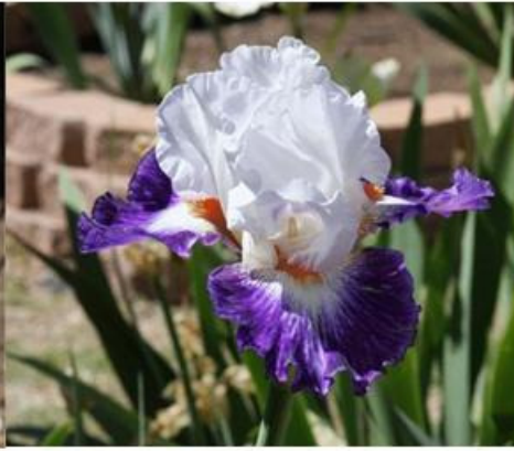
Gypsy lord' (Keppel 2006)