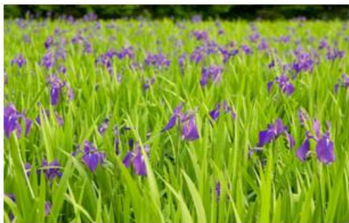
Figure 3: Iris laevigata in the wild in Kyoto Japan.