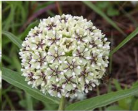
Antelope Horn Milkweed