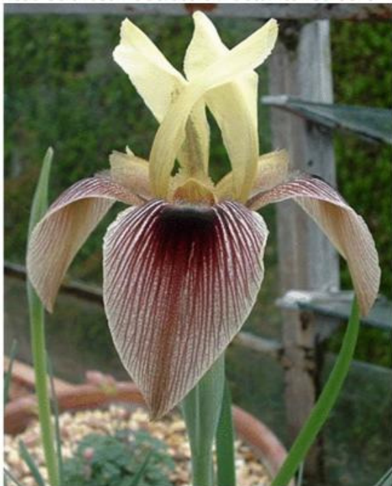
Figure 2: Iris afghanica