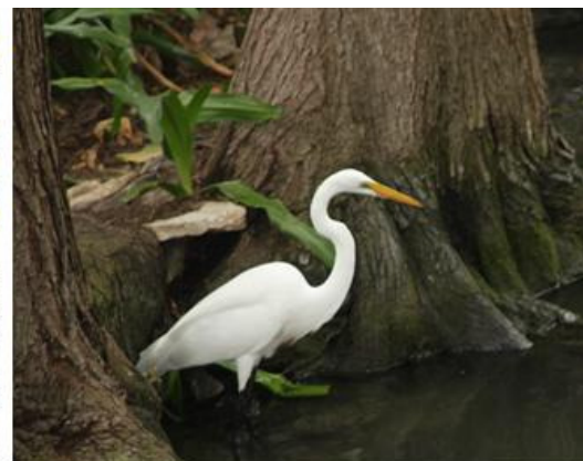
Ibex Search for a passing fish