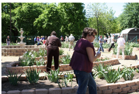
San Marco's Visitor Center

addition to the iris garden that many enjoyed. Here also were fields of wildflowers to explore and take pictures of, including a large field of blue salvia.