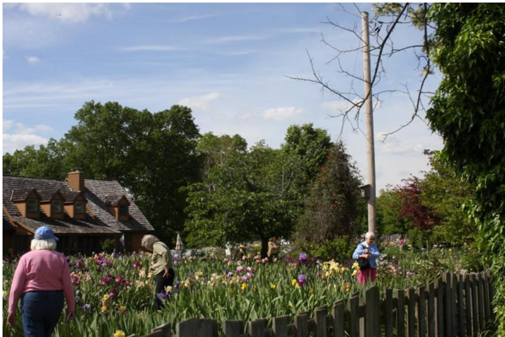
Winter Berry Gardens at peak bloom