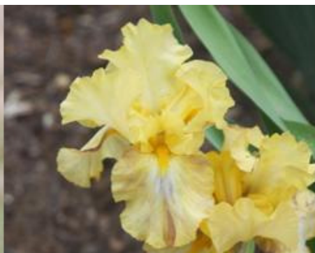
'Liger' (Spoon 2004)