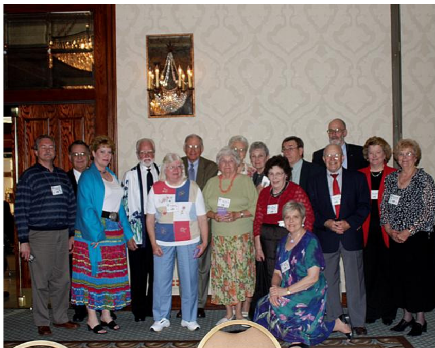
Region 4 2008 National Convention Attendees