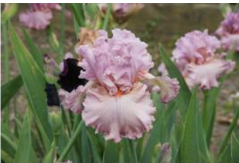
GOOD SHIP LOLLIPOP