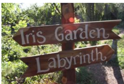
Natural Gardener Sign

The planting at Brushy Creek Community Center Garden was overseen by Rachel Hagan. The community center's garden was a planting of both native and non-native plants which included the iris plantings which were placed throughout the garden area. It was here that I learned what a new Yucca plant we saw while visiting the Congress Avenue Bat Bridge looked like. Coral Yucca, which is also called a false yucca, displayed rounded leaves and flowers that were small and more gladiola looking. With water features, including a foot bridge, desert area, and fully native plantings there was a lot to see in a very short span of time.