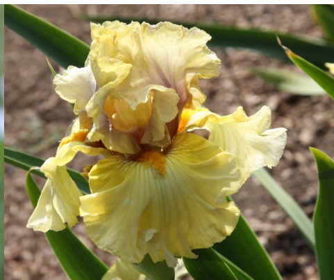
'SECRET RITES' Keppel 2004