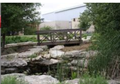
Bridge over Water Feature

The planting at Brushy Creek Community Center Garden was overseen by Rachel Hagan. The community center's garden was a planting of both native and non-native plants which included the iris plantings which were placed throughout the garden area. It was here that I learned what a new Yucca plant we saw while visiting the Congress Avenue Bat Bridge looked like. Coral Yucca, which is also called a false yucca, displayed rounded leaves and flowers that were small and more gladiola looking. With water features, including a foot bridge, desert area, and fully native plantings there was a lot to see in a very short span of time.