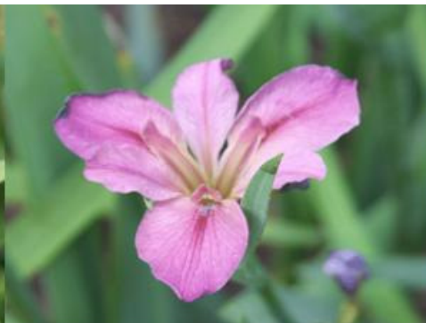
'Imps Papa' (Faith 2005)