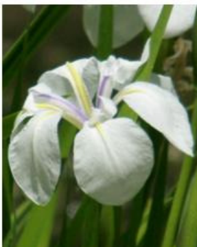
Figure 4: Iris laevigata alba taken at U.C. Berkeley Botanical Garden.