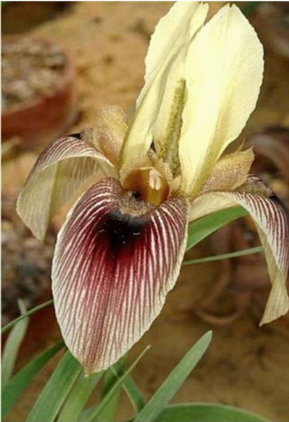
Figure 1: Iris afghanica