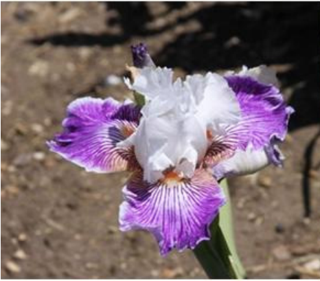
Crow's Feet' (Black 2006)