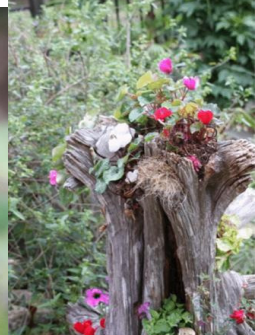
Some of the sights in the Bannockburn Baptist Church Garden