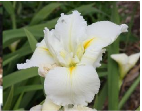
'Yavana' (Faith 2004)