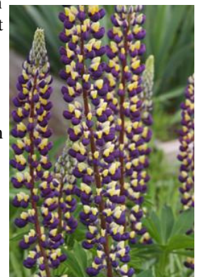
One of many Lupin Varieties