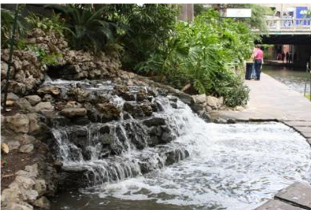
One of many Fountain of River Walk

one named "Miss Iris" was unavailable, I toured three quarters of River Walk and even entered the San Antonio River proper at one point. Having been built with flood prevention gates has allowed businesses to thrive and every kind of food was available. Wildlife also was abundant here and seemed little concerned for the human activity."