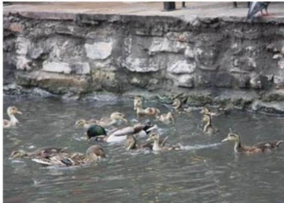
Duck pair adopt many orphans

The convention was over , but I still had some free time, so the first stop was the Alamo. On the way I passed the San Marco Visitor center and stopped to take pictures of blooms that had opened since the last visit. I also received information of where to take photos of more wild flowers. The Alamo was not what I expected as very little of the original fort remains. What remains reminds us of what was sacrificed. The River Walk, a below street level State park just blocks from the Alamo, allowed you to stroll next to a spur of the San Antonio River shaded by stately trees. Many of the multitude of fountains that filled the area were cut into the sidewalks and paths. Getting on one of the boats that toured the entire area, the