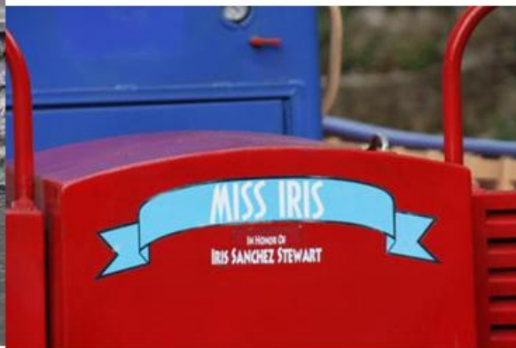
River Tour boat named Iris

one named "Miss Iris" was unavailable, I toured three quarters of River Walk and even entered the San Antonio River proper at one point. Having been built with flood prevention gates has allowed businesses to thrive and every kind of food was available. Wildlife also was abundant here and seemed little concerned for the human activity."