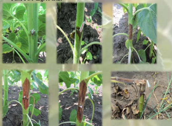
Pic.1 Five-degree scale

The seed oil content and vegetation period of investigated H. debilis accessions were determined. Seed oil content was observed using nuclear magnetic resonance (Tab.2).