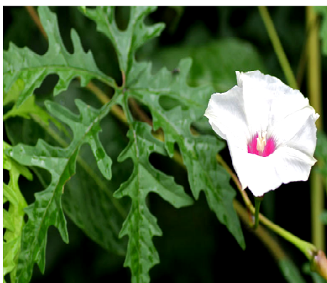
Figure-19: Ipomoea sinuate .