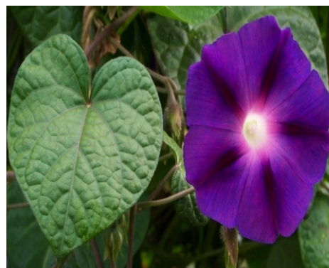
Figure-15: Ipomoea purpuria