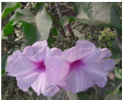
Figure-5: Ipomoea carnea.