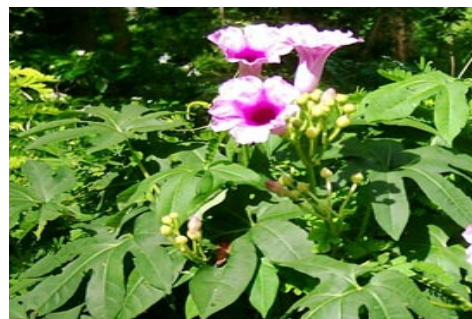
Figure-6: Ipomoea digitata