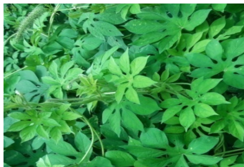
Figure-14: Ipomoea pes-tigris