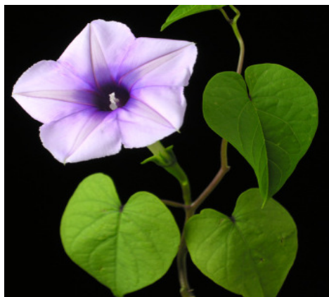
Figure-11: Ipomoea muricata