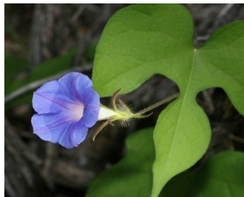
Figure-8: Ipomoea herderacea