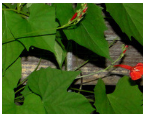
Figure-9: Ipomoea herdifolia