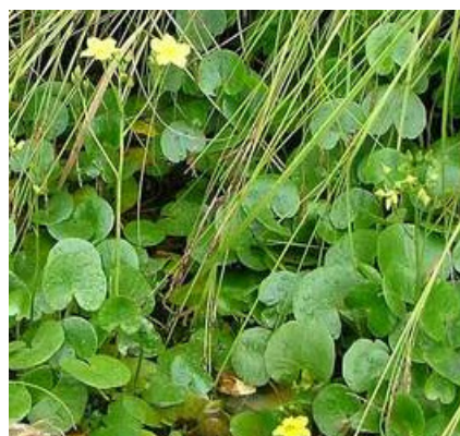
Figure-17: Ipomoea reniformis .