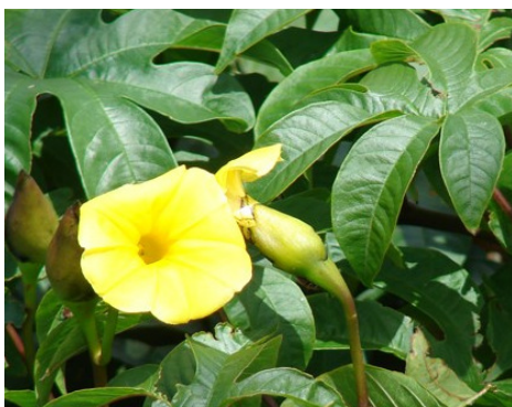
Figure-20: Ipomoea tuberosa .