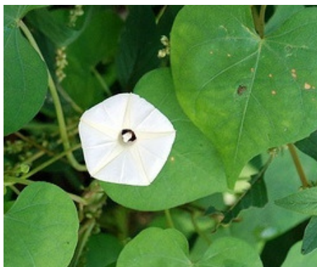
Figure-18: Ipomoea seiparia