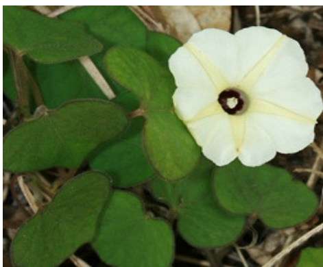
Figure-13: Ipomoea obscura