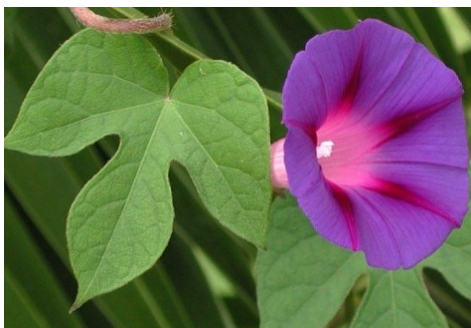
Figure-10: Ipomoea indica .