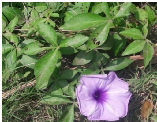
Figure-4: Ipomoea cairica (L.)