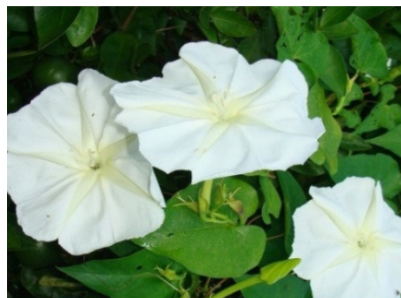
Figure-1: Ipomoea alba .

Distribution in Uttar Pradesh, India: Gorakhpur.