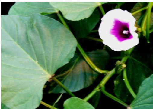
Figure-3: Ipomoea batatas (L.) Lam