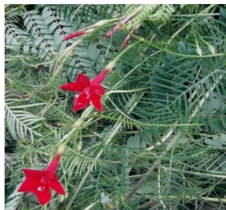
Figure-16: Ipomoea quamocilt