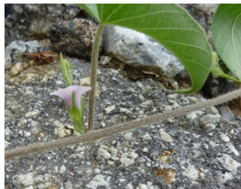
Figure-7: Ipomoea eriocarpa