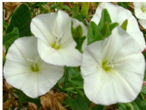
Figure-22: Ipomoea violacea