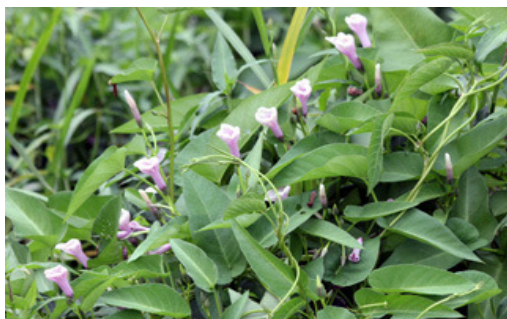
Figure-2: Ipomoea aquatica