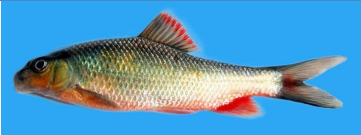
Fig. 1. Osteochilichthys elegans , V/F/NERC/ZSI/5420, Holotype, 133.2 mm SL, Mannarkkad, 10.98°N 76.47°E