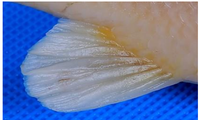
Fig. 6. Rounded anal fin of O. elegans