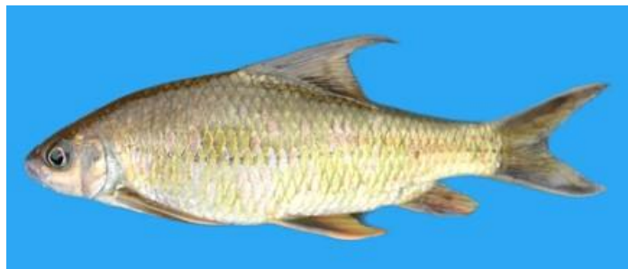
Fig. 7. Osteochilichthys longidorsalis , ZSI/ANRC/M/27238.