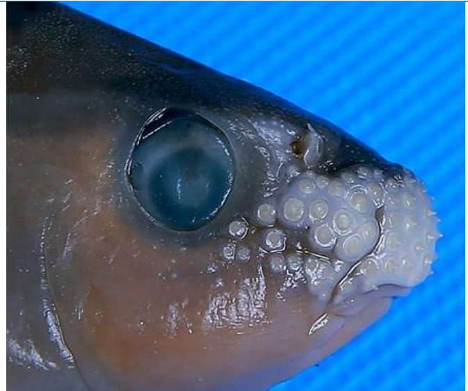
Fig. 4. Snout of Osteochilichthys elegans , showing its spiny tubercles.

Diagnosis: Osteochilichthys elegans differs from all its congeners in having 43- 44 lateral line scales, 13-14 pre - dorsal scales, dusky green upper lateral, light yellow lower lateral, blackish proximal part and the dorsal fin reddish at the distal border; ventral and anal fins are reddish. The new species further differs from its congeners in lacking any mid lateral color band, spots or bands on the anal fin.