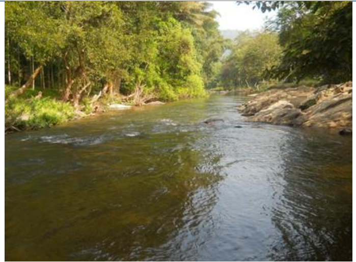
Fig. 11. The Bhavani River in Palakkad, the type locality of Osteochilichthys elegans

Osteochilichthys thomassi : DOZ, GCC 72, 6, 76.7-123.5 mm S, The Bhavani River in Palakkad, coll. Mathews Plamoottil, 28/12/2020.