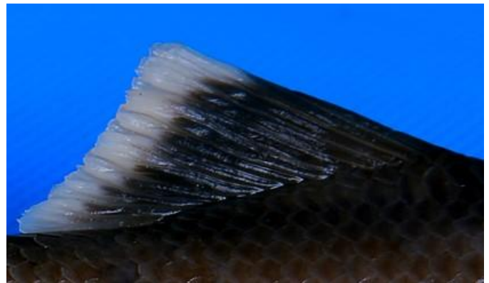
Fig. 5. Dorsal fin of O. elegans