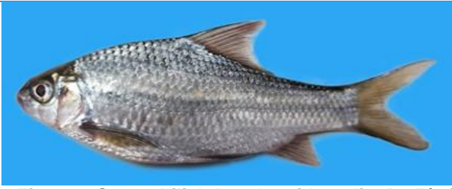
Fig. 9. Osteochilichthys brevidorsalis , DOZ/GCC 71, The Bhavani River at the base of Nilgiri Hills.

Scaphiodon brevidorsalis . Day, 1889. F. Fauna. Brit. Ind.. Fish. 1: 286.