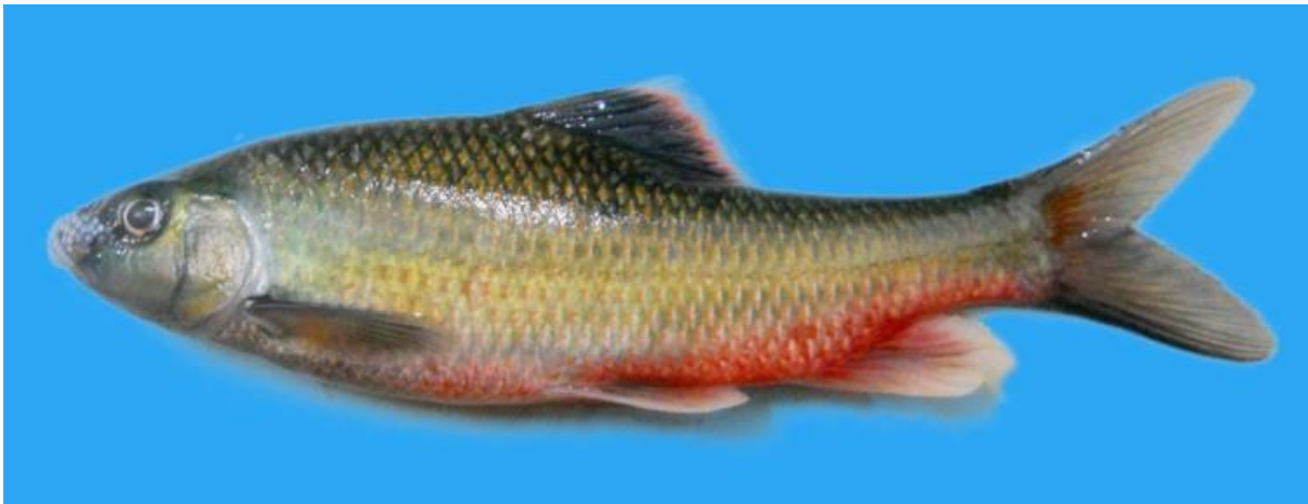
Fig. 2 A fresh specimen of Osteochilichthys elegans , ZSI/ANRC/M/27755, Paratype, 126.6 mm SL, Mannarkkad, 10.98°N 76.47°E