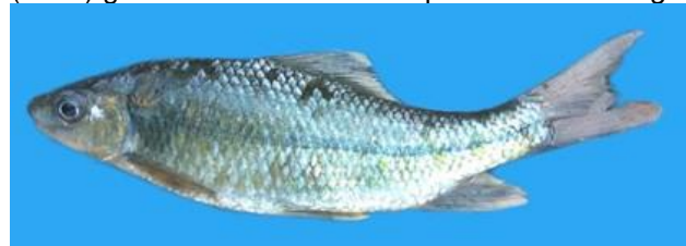
Fig. 10. Osteochilichthys augraoides (formerly O. nashii ) collected from Mysore.

Gobio augraoides was described by Jerdon (1849) as a new species, from south India. Even though he described it succinctly, he wrote about it as a 'very distinct' species. Jerdon (1849) compared it with ' Gobio augra Buchanan ' (currently Labeo angra Hamilton (1822)) and ' G. bicolor ' of McClelland (1839); currently, Gobio bicolor is a junior synonym of Labeo dyocheilus (McClelland, 1839). Hamilton (1822)'s description of angra was of a general nature; but Day (1878, 1889) and Jayaram & Das (2000) gave us a detailed description of Labeo angra .