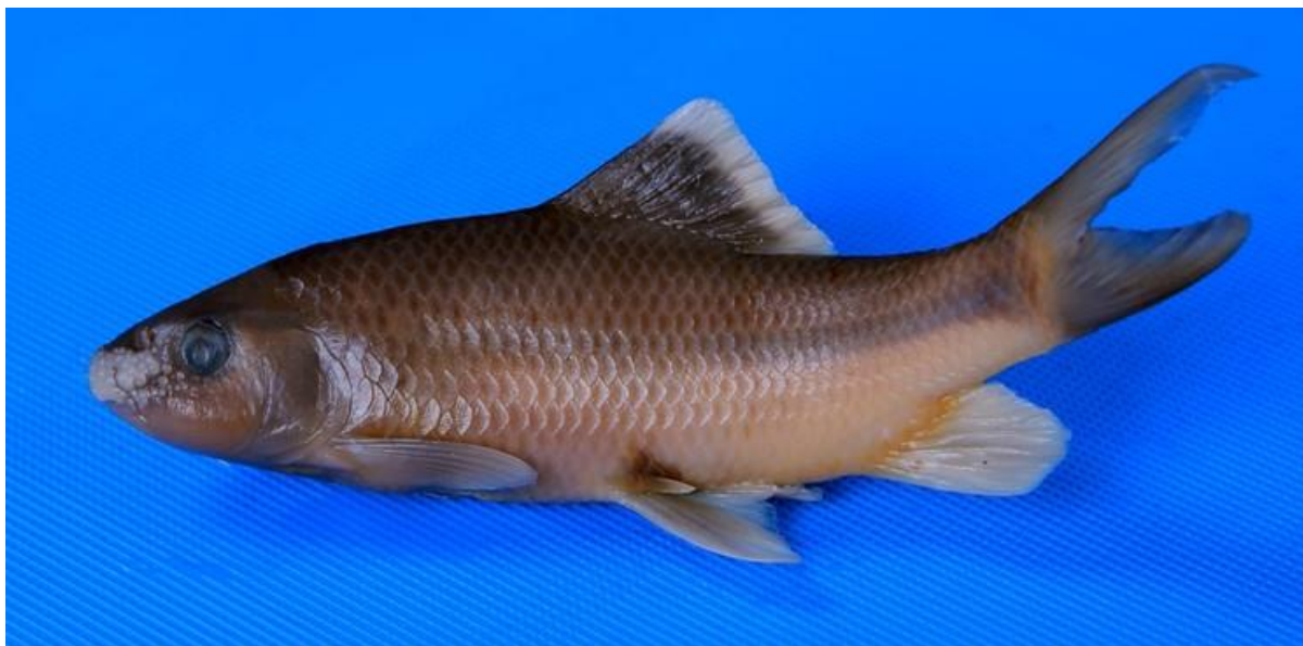
Fig. 3. A preserved specimen of Osteochilichthys elegans , ZSI/ANRC/M/27755, Paratype, 117.1 mm SL, Mannarkkad, 10.98°N 76.47°E