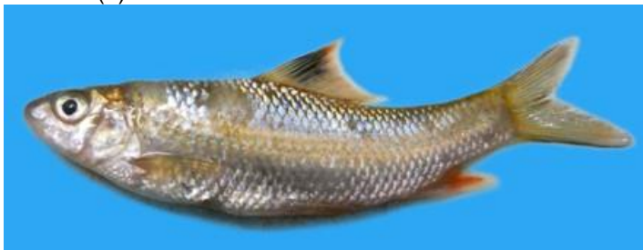
Fig 8. Osteochilichthys thomassi , collected from a water stream at Canara

Scaphiodon thomassi Hora, S. L. 1942. Rec. Indian Mus. 44 (3).1-10.