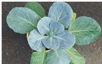
Chlorfluazuron 5%EC/1 L/ha (50 g a.i./ha)