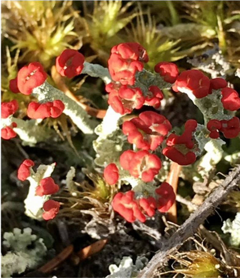
Cladonia - British Soldiers