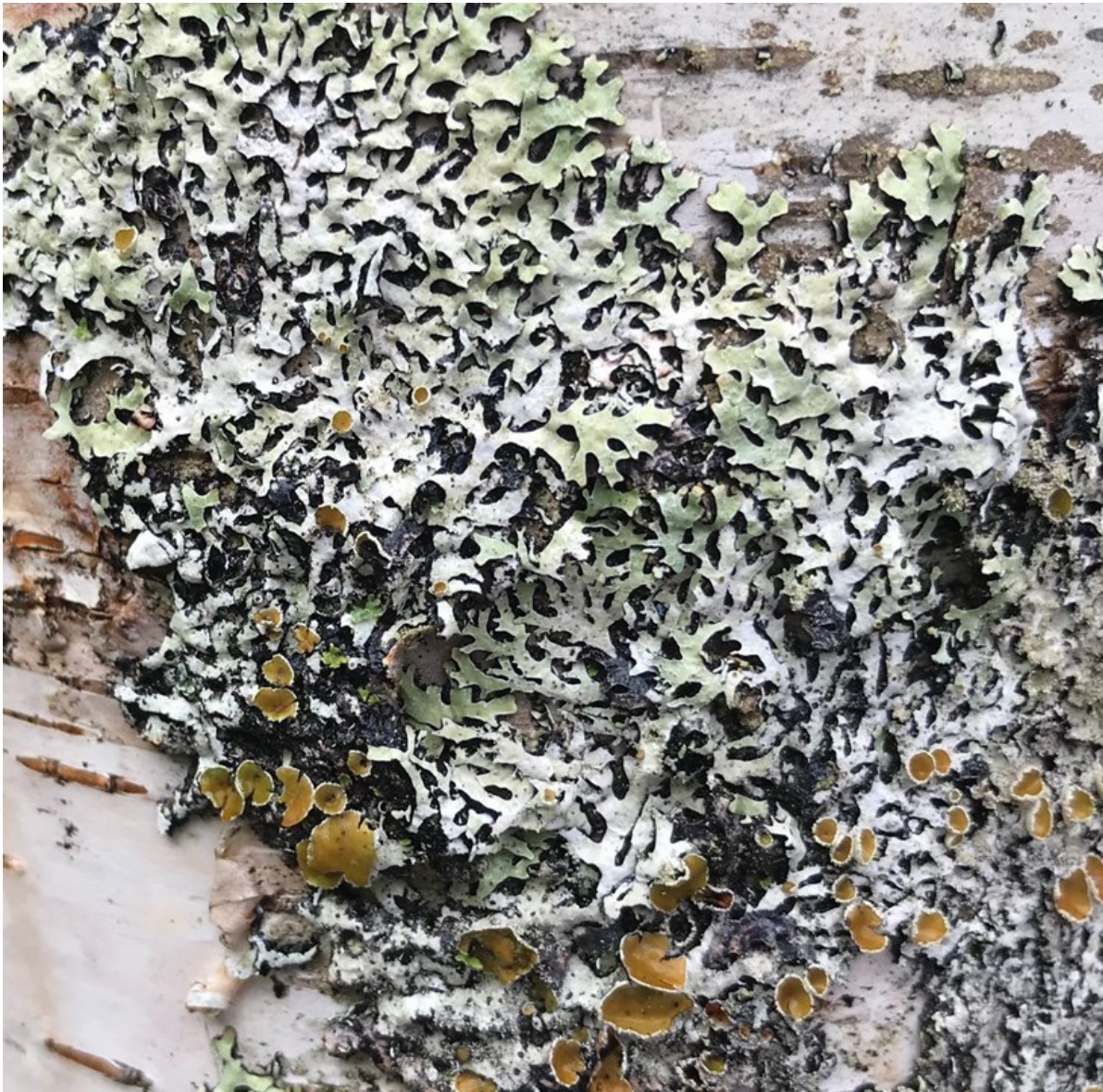
Parmelia sulcata is another very common lichen to be the first colonizer.

Flat and strappy Parmelia squarrosa goes by the common name Bottlebrush. The rhizines underneath are bristly. It shares its mineral gray-green color with the previous species. It takes a bit of practice recognize distinguishing marks of each one. Since all are common this can be frustrating but don't forget to enjoy your new interest!