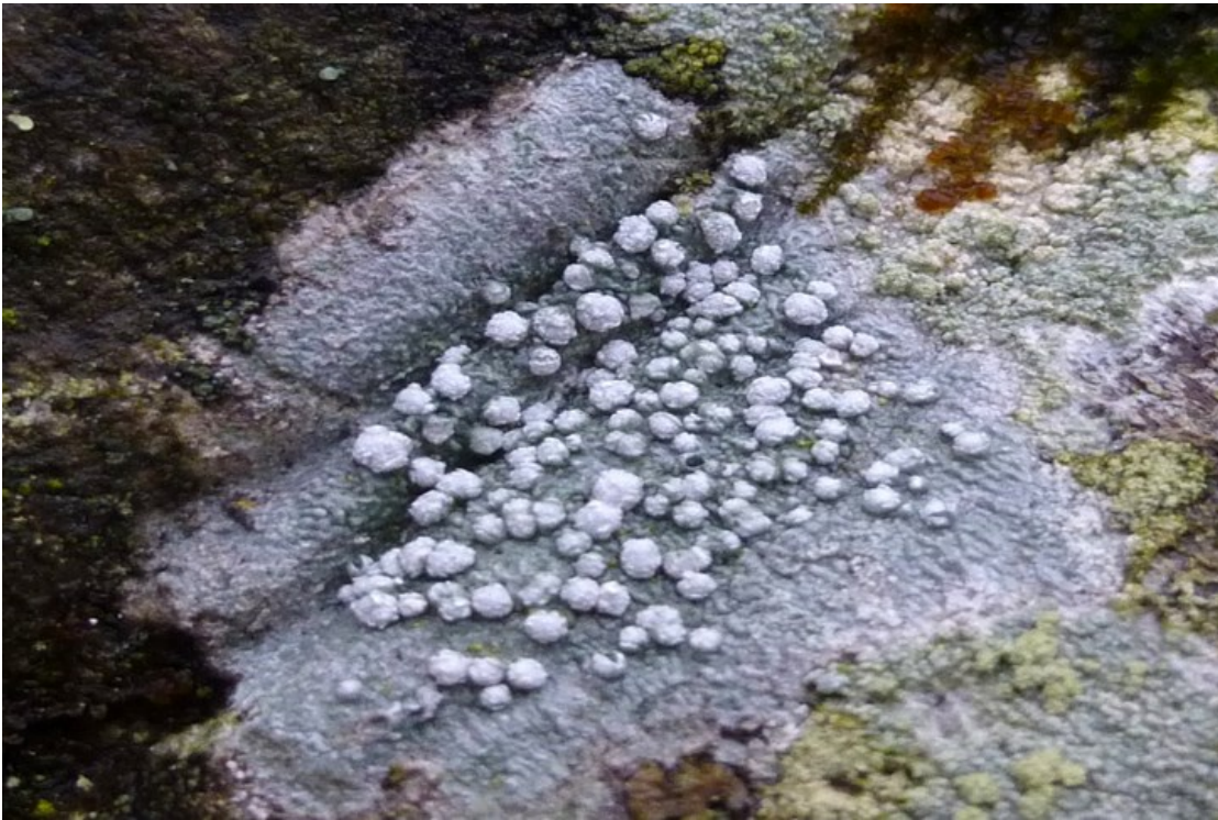
On a lichen on bark

Small asexual dust-like clumps of fungi, algae and cyanobacteria resemble little cotton balls on the surface of lichens...these are called soredia.