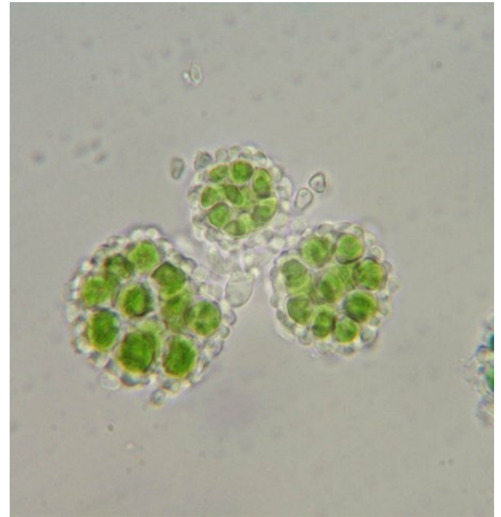
Under the microscope