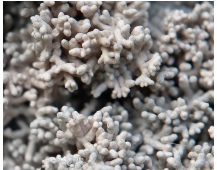
Under the microscope