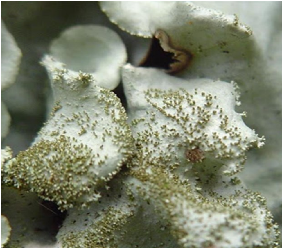
On surface of a lichen

Small asexual finger-like outgrowths growing from the surface of lichens are called isidia.