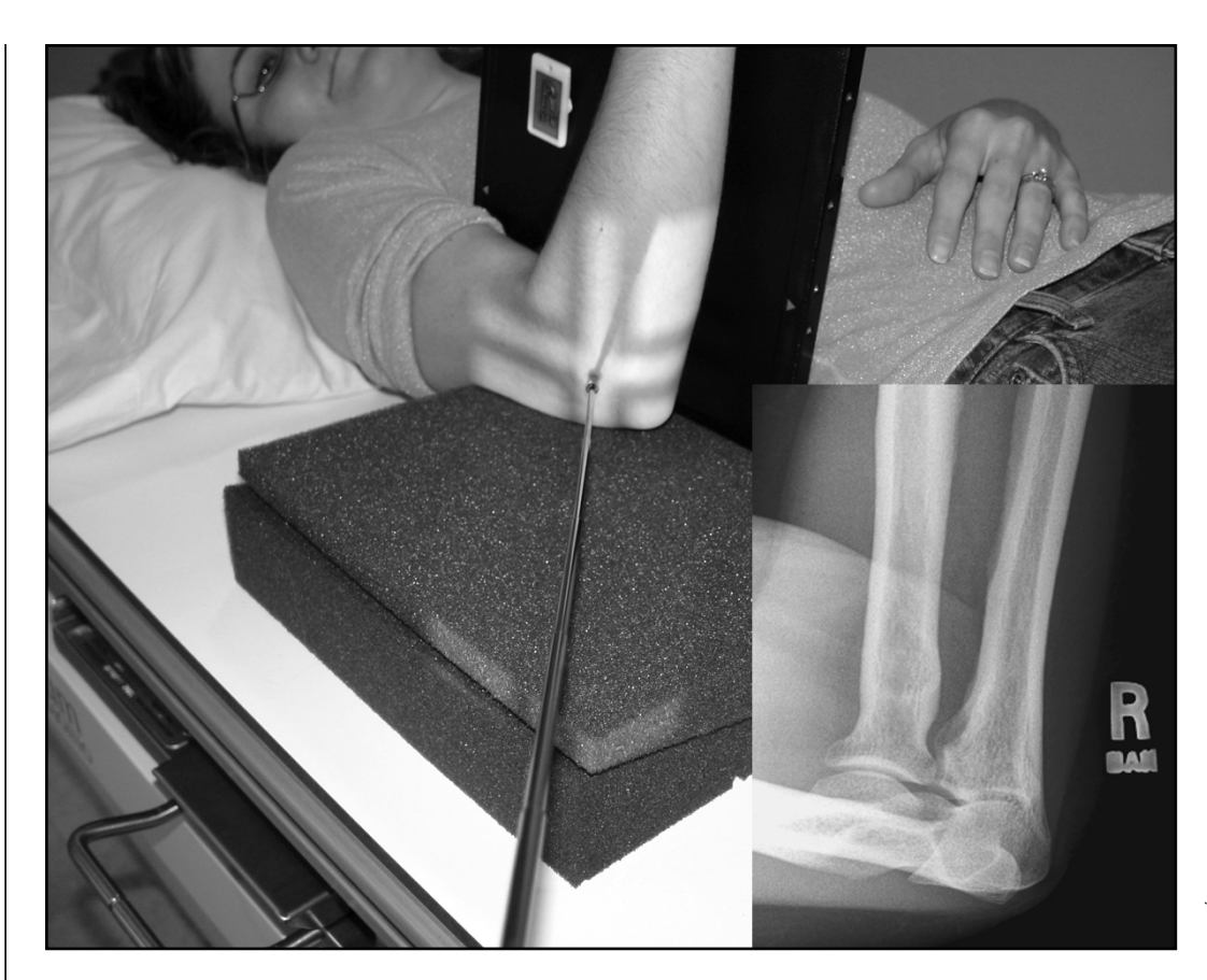
Fig. 3. Recumbent 45° axial lateromedial projection, patient positioning and resulting image.

but with the patient recumbent instead of erect. If possible, the elbow is flexed 90°. Again, exact 90° flexion is not necessary. The palmar surface of the hand faces the IR. The x-ray tube is angled 45° in a lateromedial projection with the CR directed to the mid-elbow joint. The resulting radiograph separates the radius and ulna, displaying the radial head without superimposition. (See Fig. 3.) Once more, the radial head is slightly distorted due to the angle of the CR with respect to the joint and the IR.