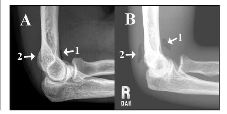
Fig. 1. A. Normal fat pad signs. 1. Anterior fat pad sign. 2. Location of posterior fat pad, not visible on a correctly positioned lateral elbow. B. Abnormal fat pad signs demonstrating digitally enhanced fat pads. 1. Anterior fat pad "sail sign." 2. Posterior fat pad sign.

In contrast, the posterior fat pad is located deep within the concavity of the olecranon fossa and is not normally visualized on a properly positioned lateral radiograph. (See Fig. 1-A2.) It is important that the radiographer understand that a fat pad sign may demonstrate a false positive if the lateral has been improperly positioned. Proper positioning requires 90° flexion of the elbow joint. Other angles may tempt the posterior fat pad to emerge from the olecranon fossa, mimicking the fat pad sign. Therefore, in a noninjured, correctly positioned lateral elbow, the posterior fat pad should not be visible because it is hidden within the olecranon fossa. If the fat pad is evident, further study may be warranted to investigate injury. (See Fig. 1-B2.) Technique is of paramount importance to evaluate the soft tissue adjacent to these areas.