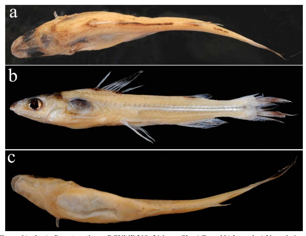
Figure 1(a, b, c): Batasio spilurus, RGUMF 318, 54.1 mm SL. a) Dorsal b) Lateral c) Ventral views.

Batasio spilurus differs from all known congeners by its short adipose-fin base (10.0-12.8% vs. 14.5-33.3% SL) and slender caudal peduncle (5.7-6.6% SL vs. 6.7-11.8% SL). It further differs from the congeners occurring in the Brahmaputra drainage, except B. tengana (Hamilton) in having a slender body 11.9-14.1% SL (vs.15.8-23.9% SL). Batasio spilurus can be easily differentiated from B. tengana in having a wider head (14.7-16.5% vs. 12.5-14.5% HL), the presence of a distinct greyish triangular spot at the base of the caudal fin (vs. spot very diffuse or absent), and a more