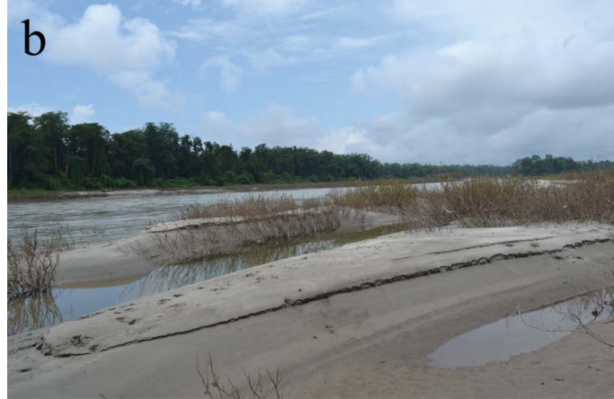
Figure 2 (a, b): Collection site of Batasio spilurus in Siang River at Pasighat, Arunachal Pradesh: a) Main river b) Portion of river in southern bank.