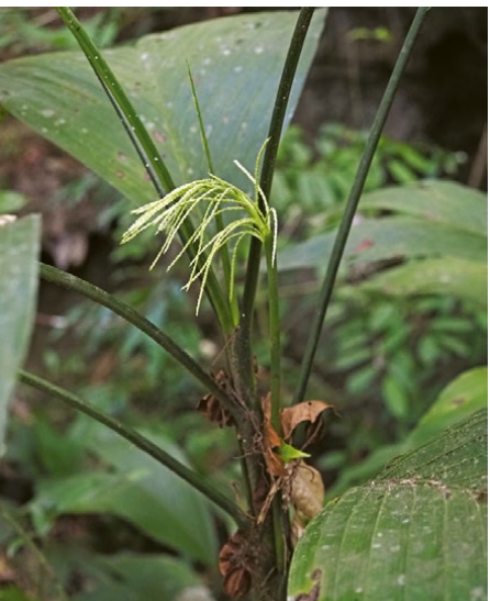
Chamaedorea donnell-smithii in Uxapanana, Mexico

West Africa: Côte d'Ivoire, Ghana, Togo and Bénin'. Archives des Sciences , Volume 72 – published in December 2021). Available at: https://www.unige.ch/sphn/Publications/ ArchivesSciences/AdS2021/Vol_72_ pp_001_078_Stauffer.pdf.