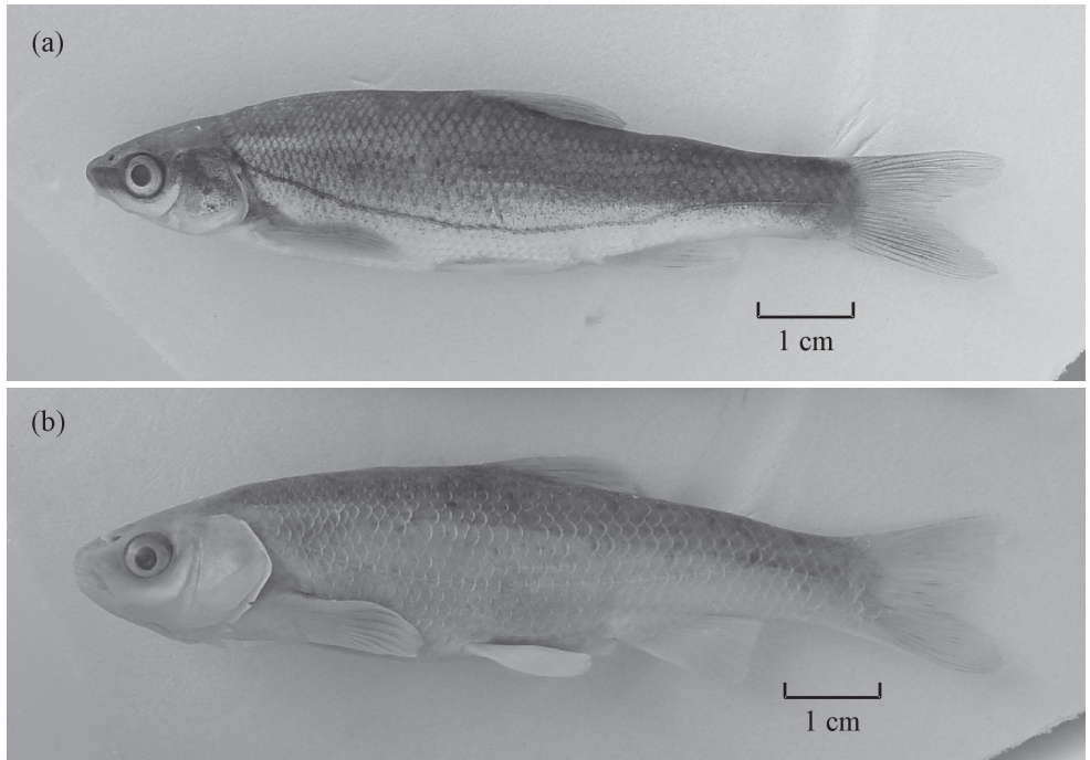
Fig. 3. Lateral view of (a) Chondrostoma almacai sp. nov. (holotype, 79.9 mm L_s , MB 05-1870/21) and (b) Chondrostoma lusitanicum (holotype, 82.5 mm L_s , MB 05-604).

length 20.54–25.28% in standard length; head depth about 1.6 times greater than CPD. Eyes small, inferior arched mouth, without a conspicuous horny blade on lower lip. Dorsal and anal fins similar in size, generally with seven branched rays in dorsal and seven or eight in anal, both with slightly convex profile; origin of dorsal fin located above end of pelvic fins or slightly posterior to this; caudal fin with slightly rounded lobes. Scales numerous and of medium-size, with distinct and complete lateral line; small and numerous gill rakers, along entire gill arch; six/five or six/six smooth and knife-shaped pharyngeal teeth, in one row.