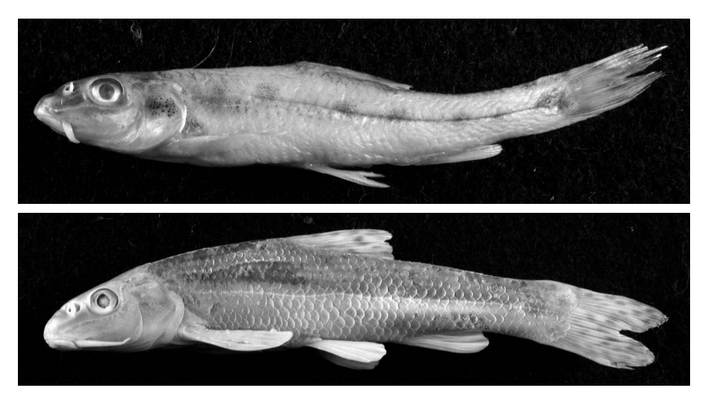
Fig. 2. The short-barb Crimean gudgeon from the Chernaya River (SL=41.8 mm) (a) and gudgeon from the Alma River (SL=67.0 mm) (b).

Abbreviations: SL - body length (from the anterior part of the head to visible base of the caudal fin); lb - length of barbel; o - horizontal diameter of eye; c - head length; n - number of specimens. Above the line - range of values of a character; under the line - mean, or mean with error, or range of means in different samples. * The data are calculated by means of barbel length and head length in % of body length and by means of horizontal diameter of eye and head length in % of body length.