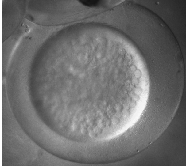
Fig. 1. Epiboly-a stage at which the development stopped in some individuals.

embryonic development of eggs at the start of epiboly (Fig. 1). These eggs remained at the same state until the end of the usual embryo period. The hybrid larvae did not manage to feed consistently even though the mouth was well formed and functional, the swimbladder inflated and some Artemia nauplii were found in the intestines during the mixed feeding step. Consequently their overall development slowed down after full absorption of the yolk reserves and no hybrid larvae survived beyond 18 days after activation.