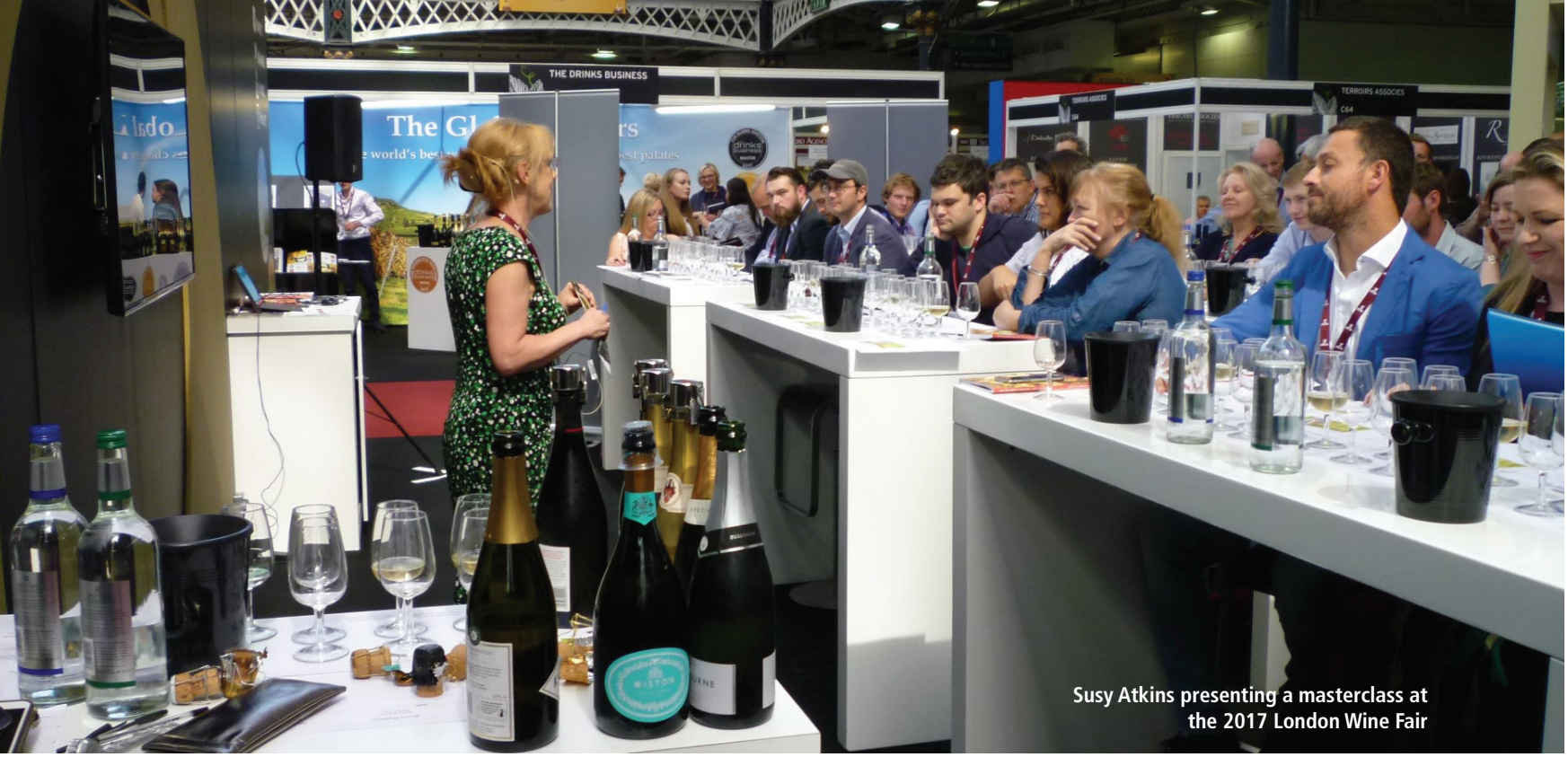
Susy Atkins presenting a masterclass at the 2017 London Wine Fair