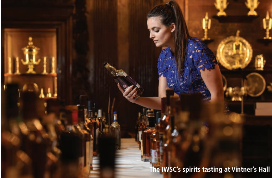
The IWSC's spirits tasting at Vintner's Hall