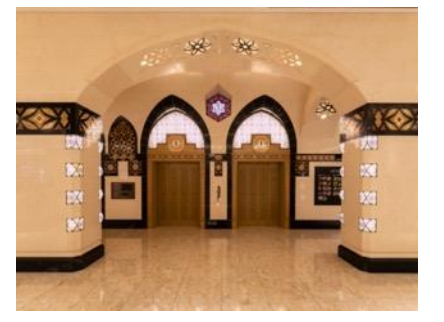
1F Windbreak chamber by the central entrance facing Midosuji Street