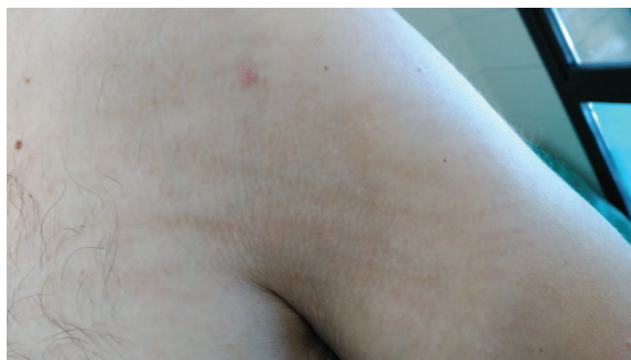
Figure 5. Bleomycin-induced flagelated hyperpigmentation.

repeated in new exposures; recurrence is often more severe and widespread. 7,54