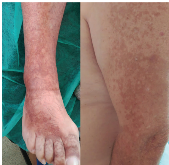
Figure 3. Clonazepam induced hyperpigmentation on extremities.

chlorpromazine. This adverse effect has been reported especially with imipramine. 37 There are also reported cases of hyperpigmentation associated with amitriptyline. 9