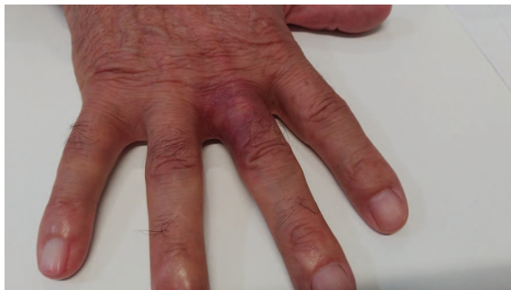
Figure 4. Drug fixed eruption induced by NSAIDs.

lating agents, cyclophosphamide, ifosfamide, and thiotepa have been identified as causes. Cyclophosphamide can cause hyperpigmented patches after the fourth week of treatment, which disappear 6 to 12 months after treatment cessation and may seem on the palms, soles, nails, teeth, and, rarely, on the gums. 47 Ifosfamide hyperpigmentation occurs more frequently in the flexural areas, the hands, feet, and scrotum, and under occlusive bandages. This hyperpigmentation may occur after only 1 course or several months of therapy, and has a more unpredictable course than that of cyclophosphamide. 48 Like ifosfamide, thiotepa can cause hyperpigmentation in occluded areas (it is believed to be excreted in sweat, and this may be the mechanism responsible for the hyperpigmentation). 49 Other alkylating agents that cause hyperpigmentation are platinum metals, with cisplatin producing hyperpigmentation in 70% of patients, which may be localized or irregular, and affects the hair, nails, and oral mucosa. The risk increases with subsequent cisplatin treatments. 50