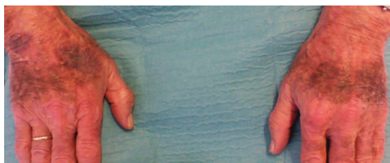
Figure 7. Amiodarone -induced hyperpigmentation on hands.

Cases of melasma and 1 of poorly defined irregular hyperpigmentation have been described, representing 66% of cases of dermatosis associated with oral contraceptives. 66