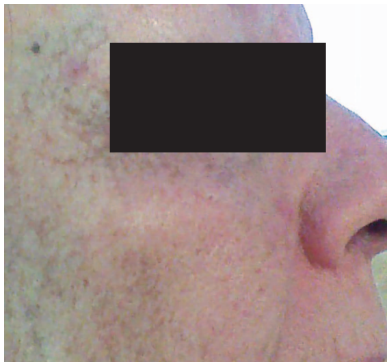
Figure 2. Hyperpigmentation due to lercanidipine.

ropathic pain. Changes in hair color and curly hair have been described after use as have changes in nail pigmentation 30,31 and 1 case of labial hyperpigmentation. 32