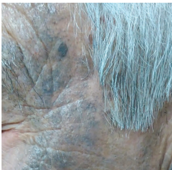
Figure 1. Minocycline induced facial hyperpigmentation.

Angiotensin II receptor antagonists block the binding of angiotensin II to its receptor subtype 1. Increased use of these antihypertensive agents has led to more visits to pharmacovigilance centers, but the only recorded cases of hyperpigmentation are 1 case due to telmisartan. 20 There are some reported cases of hyperpigmentation induced by captopril, an angiotensin-converting enzyme inhibitor. 21