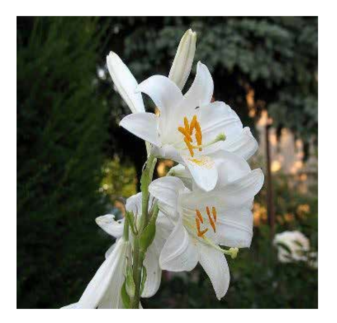
Fig. 3. L. candidum, Source: www.iranboom.ir.

and beliefs of many ancient nations, so that its appearance in their remnant thoughts is evident. Relics derived from the Sumer, Elam, and Persian civilizations show the importance and presence of this flower in the area for a long time. TyFigally, in one of the ancient Sumerian tablets dating back to 5000 years ago in a Persian city (many believed to be in Shush), a clump of Lily flowers is deFigted (Crockett, 1971). Some scholars have suggested that the origin of this flower is most likely the city of Shush and the name Susan- or Shushan that implies a flower that grows in Shush- has been derived from the city's name. In addition, in designing Lily flower's figure or pattern "Susan Kari", the flower had been an esoteric expression of "Shush city," or "Lily flower," or "Lily Goddess."