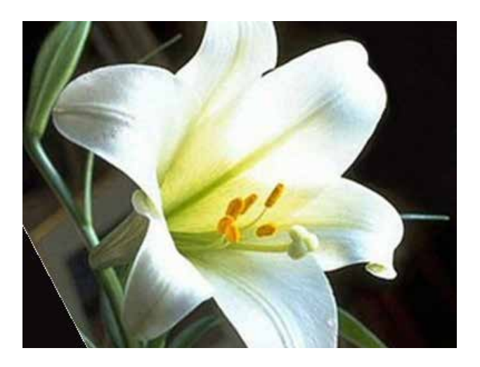
Fig. 1. L. longiflorum (white Lily).

Lily flower in the Iranians' culture and art Lily was considered sacred to the traditions