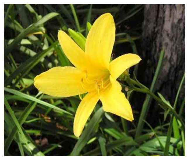
Fig. 11. The Rashti Iris or Yellow Iris or Hemerocallis lilio which is very similar to Lily, Source: www.irannameh.ir.