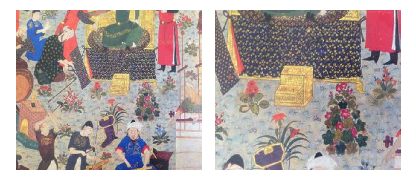
Fig. 14. The image of the magenta Lily in Figture of Lohrasb Coronation, in this miniature there is an image of a magenta flower in front of the king which is supposed to be magenta Lily.