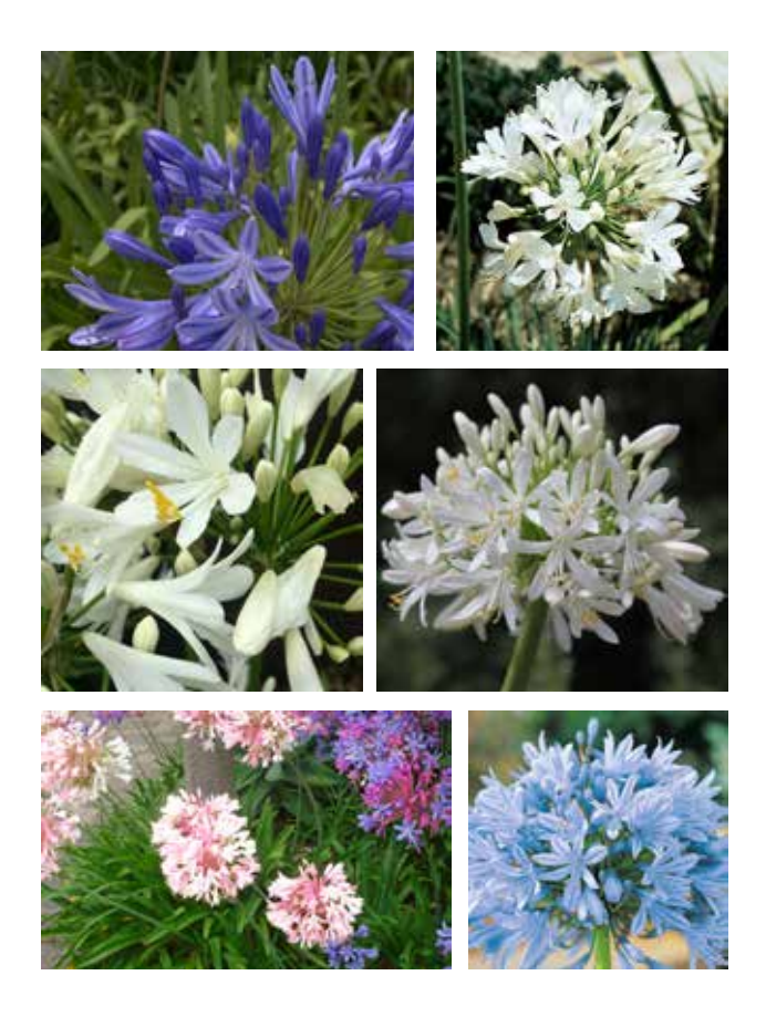
Fig.12. The lily of Persia, with a variety of colors, this species grow in temperate and humid areas.