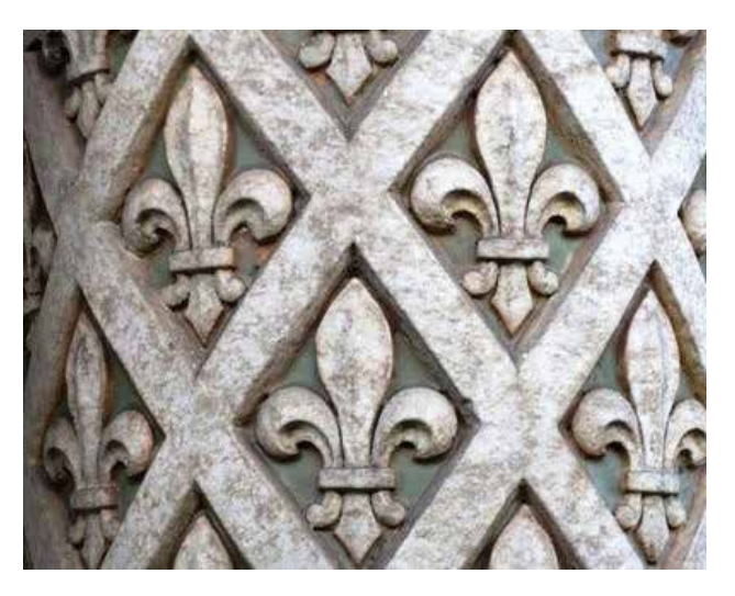
Fig. 6. Symbol of Lily flower on the column of an European architecture, Source: www.forum.iranvij.ir