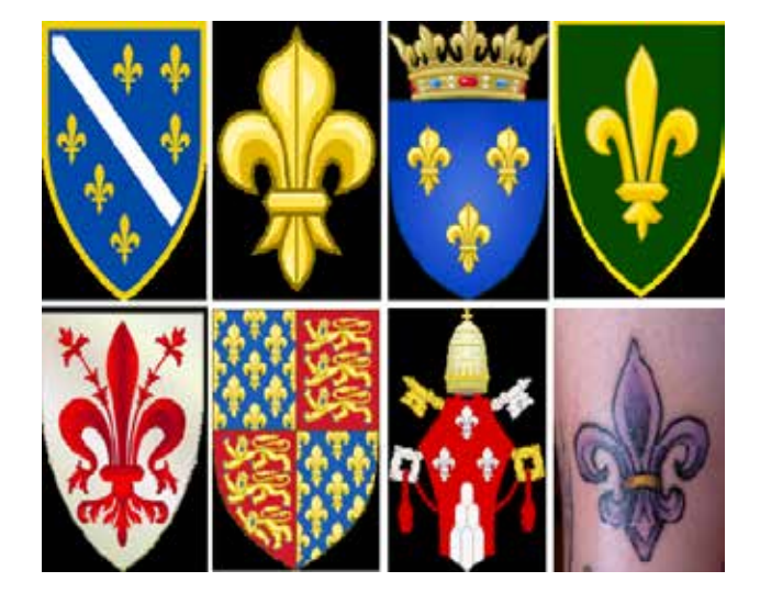
Fig. 10. The Susan Symbol on Governmental and Family Signs in European Countries, Source: www.forum.iranvij.ir.

I like the iris flower, when she opens her silvery claw filled with gold In the Persian poetry, the lily flower has been associated with a variety of concepts in the mind of its audience. This flower has sometimes been used to express implicit and symbolic concepts such as purity and freedom, and sometimes it has been used as a simile for a better description of a subject, such as the assimilation to objects like blade and a needle, and to human organs such as tongue and face. The medical applications of lily are also discussed in poetry and texts, which are not mentioned here. In general, we can classify the most important literary uses of the lily flower (Table 6):