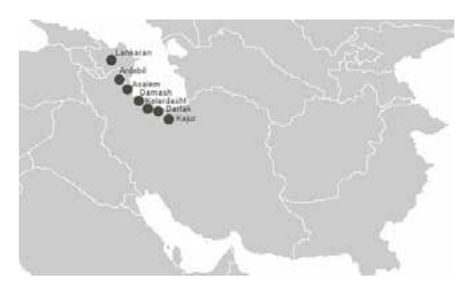
Fig. 8. Possible ancient cultivation site of Lily flower based on poetic textes, Source: Authors.

Shamshad, Lily and Jasmine, Jonquil, Jacinth and Eglantine (Fig. 8&9).