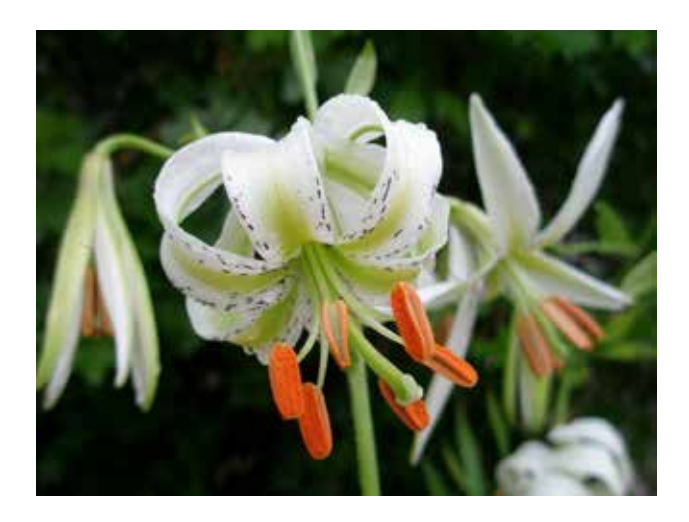
Fig. 2. L. ledebourii (Easter Lily).

Table.1.Flower Specifications of Sousan-e Chehel Cheraagh. Source : Lebo & Rehnnmark, 1976.