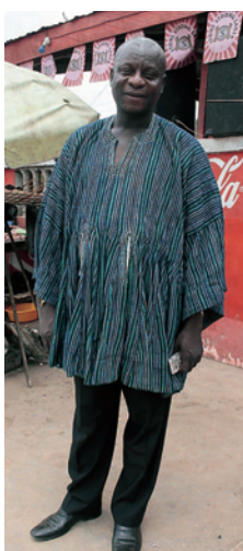
Photograph 3-1-16: Male wearing a smock.

On the outskirts of Tamale in the northern region of Ghana, there is a kind of men's garment called either a smock or a "fugu" (photograph 3-1-16). A smock is made by stitching thick narrow hand-woven cotton fabrics (some use hand spun threads) and this garment is popular as its dignified appearance shows the social prestige. In this