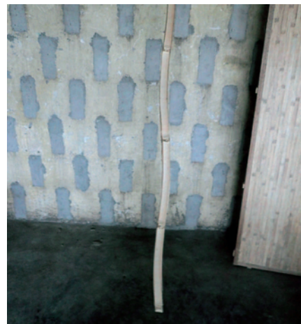
Photograph 3-1-37: Roughly cracked bamboo. Substantially bent.