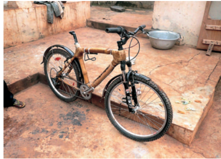
Photograph 3-1-39: Bicycle with bamboo frame (Abonpe district of the Eastern district).