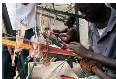
Photograph 3-1-12: Loom for weaving Kente.

conducted in the cotton fabric production region revealed that raw cotton and cotton threads produced in foreign countries such as Burkina Faso and Nigeria are used in addition to the cotton and cotton threads produced in Ghana.