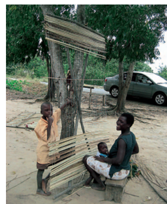
Photograph 3-1-11: Making a mat. in the Volta Region

In the field survey, mats made from a variety of natural fibers could be observed. However, only raffia palm, grass of Andropogon gramineae grass, Cyperaceae plants, and Typhaceae plants could be identified. For the others, although the local names could be identified, their types could not be confirmed by the University of Ghana. Although some types could not be identified, it was clarified that a variety of natural fibers are used as the materials for tools in daily life such as mats.