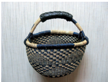
Photograph 3-1-1: Bolga baskets

Bolga baskets are made of Vetiveria nigriflora and Panicum maximum , the grasses called 'kinkase' in local that grow in the outskirts of Bolgatanga and Kumasi. Some researchers say that Phragmites karka is also used for the basket making. The stem is torn in two pieces and is used for weaving by either twisting or not twisting the strings.