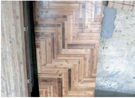
Photograph 3-1-38: Packet flooring (parquet flooring material)