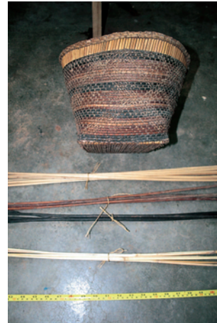
Photograph 3-1-5: Pio and sorghum, photograph taken by the author in Nyariga.