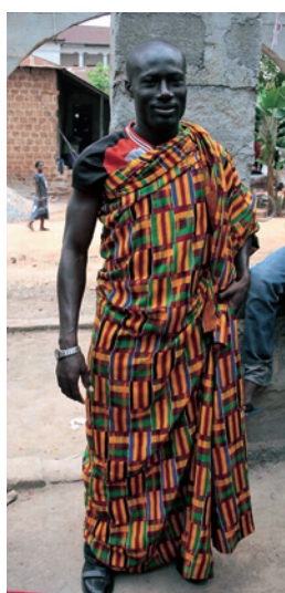
Photograph 3-1-13: Male weaver wearing a Kente. Generally, no shirts are worn under Kente. Photographed by the author in Bonwire.

For textiles, research was conducted on the fabrics called Kente in Bonwire on the outskirts of Kumasi in the center of Ghana, dyed fabrics called Andikra in Ntonso, and the fabrics used for a smock-type garment called "Fugu" on the outskirts of Tamale in the North East region of Ghana. Information on cotton cultivation was collected at SARI (Savannah Agriculture Research Institute) of Tamale. Cotton is cultivated in Ghana and yarns are produced in the spinning factories on the outskirts of Accra. The interviews