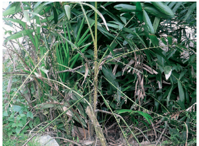
Photograph 3-1-27: State of rattan cultivation experiment Global Bamboo Company (Enyreshi district)