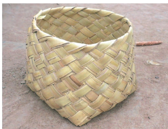
Photograph 3-1-31: Basket: 50 cm in diameter, 45 cm in height. 3 Cedis. Six baskets can be produced per day