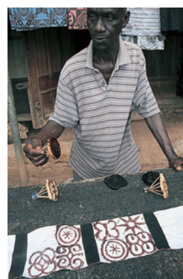
Photograph 3-1-15: Block printing in Adinkra. Photograph taken by the author in Ntonso.

The bark fabric called 'kyenkyen' in the Ashanti language could not be verified in this survey. 'Kyenkyen' is produced by stretching the bark of a tree (photograph 3-1-17) called Antiaris toxicaria ( A. welwitschii , A. africana ) by pounding. Since production of bark fabrics used for