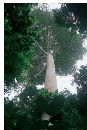
Photograph 3-1-17: Kyenkyen in the Borivi forest.

For the cotton threads as the raw material, industrial yarns in the southern region of Ghana are mainly used; however, some use hand-spun yarns also. On the outskirts of Tamale, the author observed a female spinning yarns from cotton.