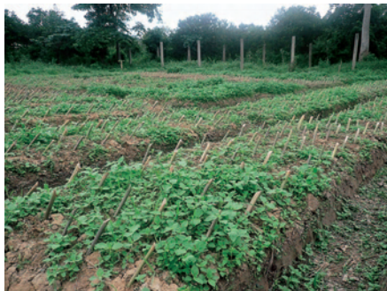
Photograph 3-1-36: Chinese bamboo nursery beds

In Ghana, production of boards that require large scale mechanical process using bamboo as the material is considered to be unsuitable for its large facility investment risk. Kebab sticks, toothpicks, and more high-value added household goods seem to have more potential.