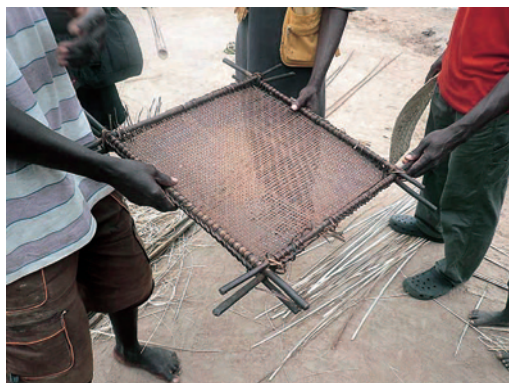
Photograph 3-1-23: Atsieve-Sogakophe district. Sieve for cassava flowers made from the same material

Thirty or more buyers visit the market and sell the baskets to other markets in Accra City.