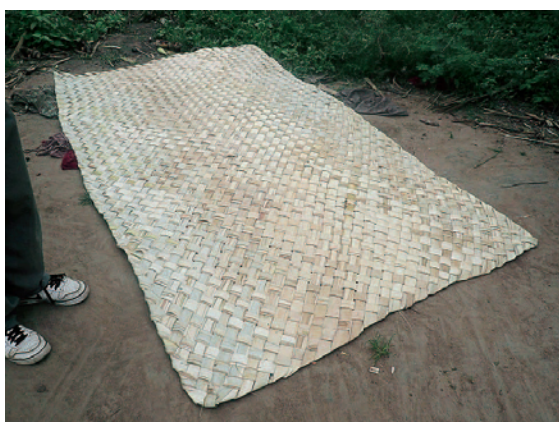
Photograph 3-1-32: Mat used for drying chili peppers. 220 cm x 140 cm. 7 Cedis. Two mats can be produced per day.