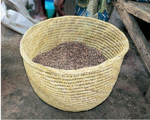
Photograph 3-1-4: Tool for draining off water from the seeds of zehen and parkia after they are washed. A soft basket with attractive mesh is created by weaving straws of Phragmites karka without being twisted. This type of basket, however, cannot withstand weight as a container. Market of Zebira (Bokwa district)