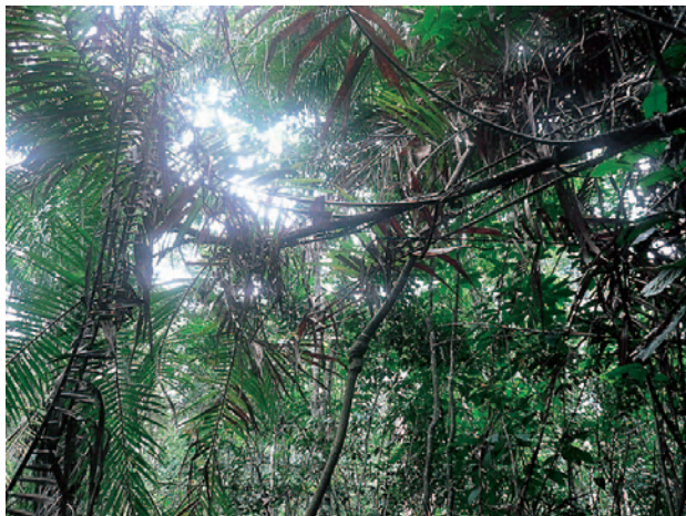
Photograph 3-1-26: Wild rattan (Forest on the outskirts of Tarkwa City)