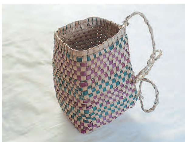
Photograph 3-1-21: Basket of 8 cm in diameter and 10 cm in height. Price: 30 Pesowas.

Mainly the elderly females are in charge of basket making while children learn.