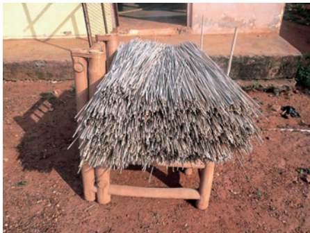
Photograph 3-1-40: Kebab sticks (Adinkrahene Concept Company)