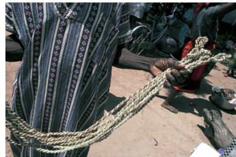
Photograph 3-1-7: Kenaf strings. In West African countries like Ghana, fibers that are extracted from the strong bark of kenaf are made into strings and usually used as binders. Photograph taken by the author at the market of Zebira (Bokwa district).