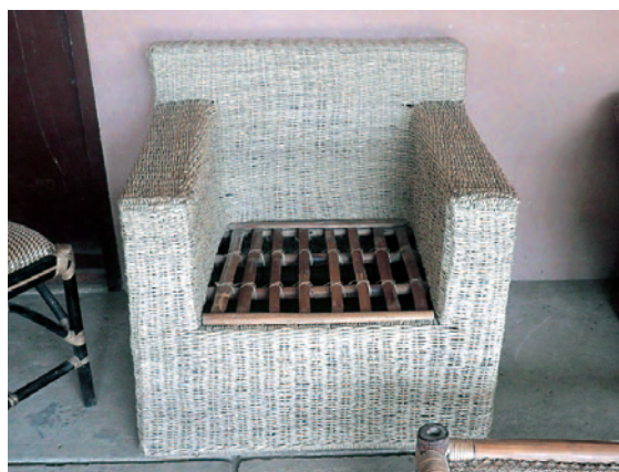
Photograph 3-1-29: Example of application to the seating surface of furniture, Global Bamboo Company (Enyresi district)

The material is collected, dried, and stored, and it is once dipped in water, before being made into a string by twisting. (Atravenu district)