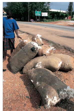
Photograph 3-1-18: Selling Kapok cotton alongside the road. Photograph by the author in

In the Democratic Republic of Congo (Former Zaire), raffia was famous for its fabric material. However, in Ghana, the author could not witness weaving using raffia fibers. The author witnessed that raffia trunks are used for buildings, leaf stems are used for baskets, and fibers collected from leaves are used for binding. However, in Ghana, yarns are not made by spinning fabrics and producing fabrics using the yarns.