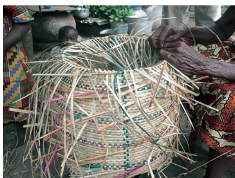
Photograph 3-1-20: Basket of 30 cm to 42 cm in diameter and 30 cm in height. Price: 3 Cedis.

Mainly the elderly females are in charge of basket making while children learn.