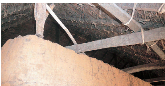
Photograph 3-1-30: Trunks used for poles and beams of buildings

In the coastal area of the Volta region, dried leaves of this plant are used for a variety of weaving products such as fans, mats, and baskets. The trunks, which are very hard and strong, are used for poles and the beams of buildings. In particular, fans are also sold in other regions as useful tools for starting coal fires. Its rough large mesh is attractive.