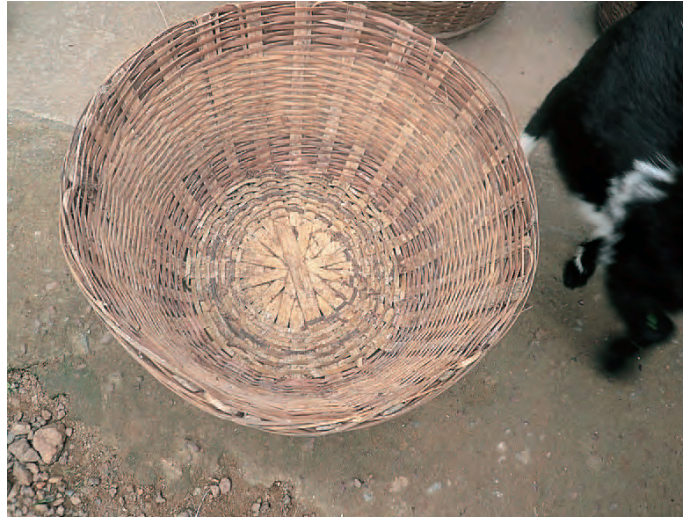
Photograph 3-1-33: Basket (container for corn and palm kernels)

Due to its superior strength, rachis can also be used as a material for making furniture. (Simple benches are also made.)