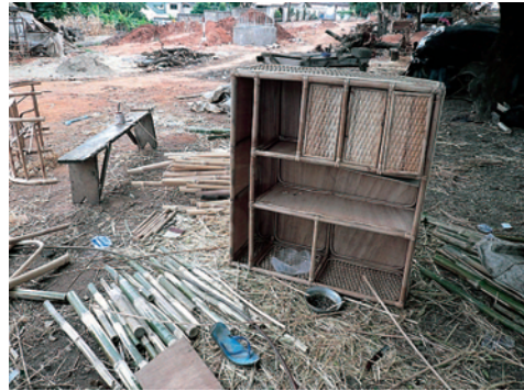
Photograph 3-1-25: Typical outdoor workshop (Dwoulu district of Accra Special City)