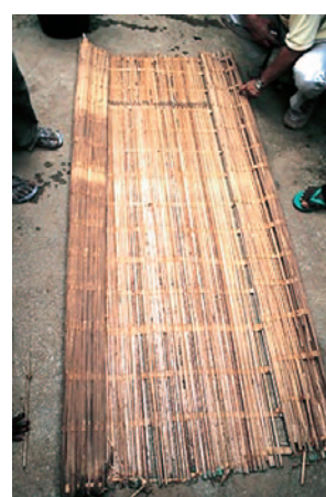
Photograph 3-1-9: Mat used for bedding. Photograph taken by the author at the Esaman village on the outskirts of Tarkwa, Southern region of Ghana.