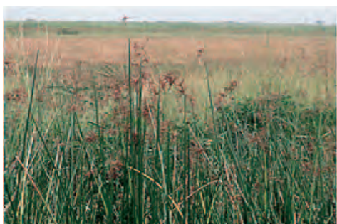
Photograph 3-1-19: Vegetation site

Based on this situation, it may be possible to increase the price and productivity of the local products by increasing new design variations and establishing an organization that integrates products in village units instead of family units.