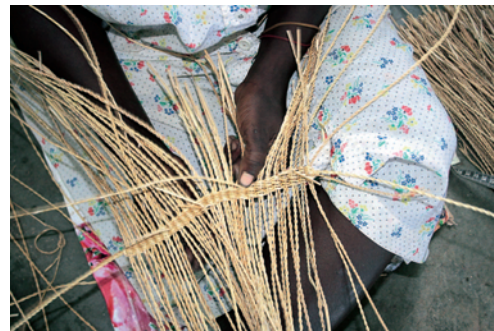
Photograph 3-1-3: Making the base of a basket.