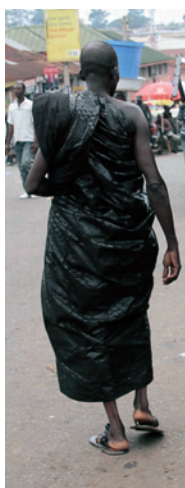
Photograph 3-1-14: Male wearing an Adinkra. Photograph taken by the author at the market in Kumasi.

feature is the geometric patterns designed by combining plain weave and pattern weave in many colors such as orange, green, and blue (photograph 3-1-13) or in two-tone colors based on white and navy blue. By stitching narrow fabrics together, more prismatic combinations of geometric patterns are created, presenting a more attractive design. The fabric is worn by wrapping it around the body as a robe.