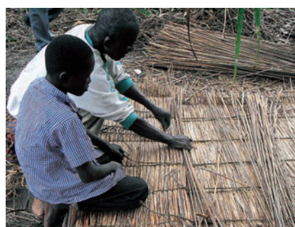
Photograph 3-1-10: Making a mat. at the Faowanye village on the outskirts of Beposo.