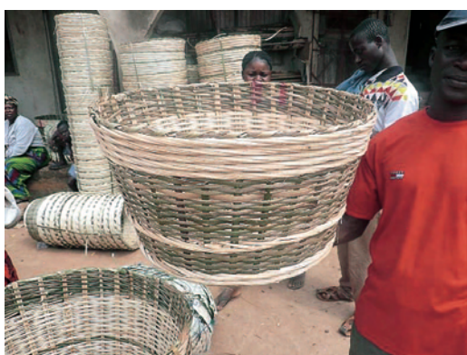
Photograph 3-1-22: Products sold in the Akatsi market.

Stems are used by tearing. Oil palm can be easily obtained from the areas that cultivate oil palm. As utility articles, the baskets made of oil palm are used for storing and carrying farm goods to the markets. The current basket size is determined based on the strength, however the marketability of the local products may be increased by producing baskets of finer and better finish. Due to its strength, oil palm can also be used as a material for making furniture.