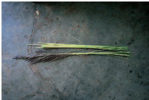
Photograph 3-1-2: 'Kinkase', collected in Nyariga.

In Nyariga, a survey was conducted on the techniques and materials in the Nyariga Craft Society. In the Sirigu Women Organization for Pottery and Art also, a survey was conducted on the basket production that is associated with tourism. For the history and current situation of the commercialization of baskets, interviews were conducted in the Zonal Office of the Ghana Export Promotion Council. For basket distribution, a survey was conducted on the basket market that is opened twice a week in Bolgatanga City.