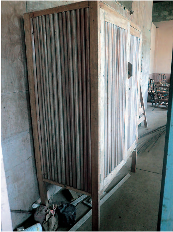
Photograph 3-1-35: Wardrobe made using raffia leaf rachises as the surface material. Global Bamboo Company (Enyresi district)