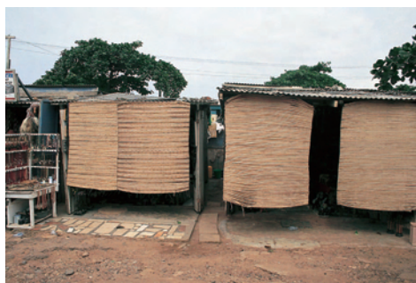
Photograph 3-1-8: Blinds hanging from the opening.

The yam grass used as blinds in the Brong-Ahafo Region and the grass that is used for making fences on the outskirts of Tamale in the Northern district were a type of Andropogon of gramineae. In the Volta Region, a survey was conducted on the mats made from the Cyperaceae and Typhaceae plants.