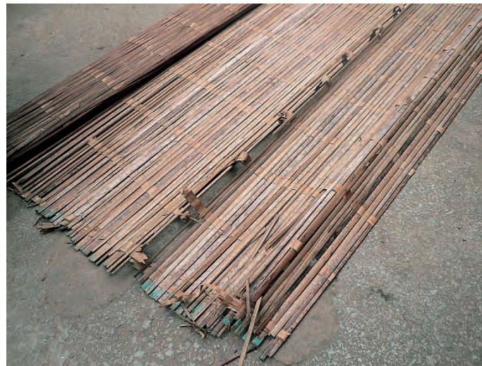
Photograph 3-1-34: Bedding mat. 2 to 3 Cedis per sheet. Raffia leaves are used as horizontal threads while raffia leaf rachises are used as vertical materials.