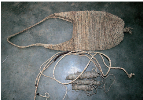
Photograph 3-1-6: Bag woven of kenaf strings (tapo). In the Upper East district, a bag woven of kenaf strings is called a tapo and is used as a shoulder bag for males. Photograph taken by the author in Nyariga.