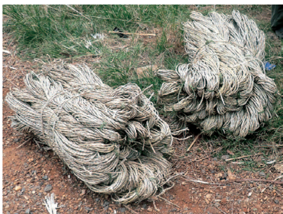
Photograph 3-1-28: Bundle of woven strings. 50 Pesowa per bundle (20 yards).

Strings are commercially produced in the area of the research field and the strings are widely distributed to other areas as well. The strings are also used for weaving mats that use Cyperus articulatus ( Andropogon gayanus ) as the main material.