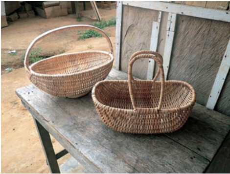
Photograph 3-1-24: Basket woven in the Anyreshi district. Highest quality. 4 Cedis. Two to three baskets can be produced per person per day.

The house furnishing products observed in Accra Special City and Takoradi City apply almost identical designs as those often seen in Asia. However, the quality is inferior. The quality variation is caused mainly by the irregular material conditions and not using "patterns" for manufacturing products. The major problem is that most workshops are located outdoors and so completed products and semi-completed products are exposed to the rain.