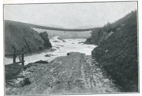
Map and Photo showing Where the Highland Railway crossed the road