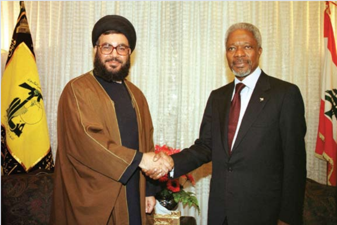
UN Secretary General Kofi Annan with Hizballah leader Shiek Hassan Nasrallah in Lebanon, June 20, 2000. The meeting gave recognition to Hizballah's influence in Lebanon. Since its 2006 war with Israel, Hizballah's power has extended well beyond southern Lebanon to the central and northern parts of the country.

command which will limit their value in the scenarios that Israel will likely face.