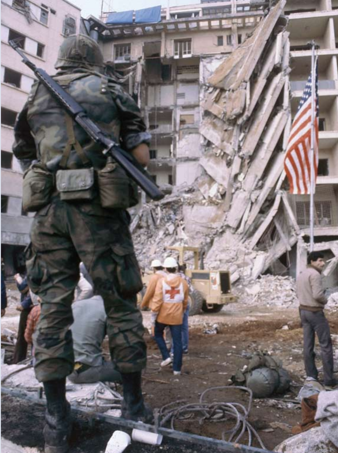
Rescue workers search for bodies in the rubble of the U.S. Embassy in Beirut following a Hizbullah suicide bomb attack on April 18, 1983, that killed over 60 people. On October 23, 1983, two truck bombs struck buildings housing U.S. and French military forces in Beirut, killing 241 American and 58 French servicemen.

For peacekeeping forces in particular, assuming a posture of strict neutrality between the side that seeks to undermine peace and security and the side that they are supposed to defend emanates, above all, from considerations of survival. This need for neutrality is one of the major factors guaranteeing that peacekeeping forces will be ineffective and unreliable when they are most needed.