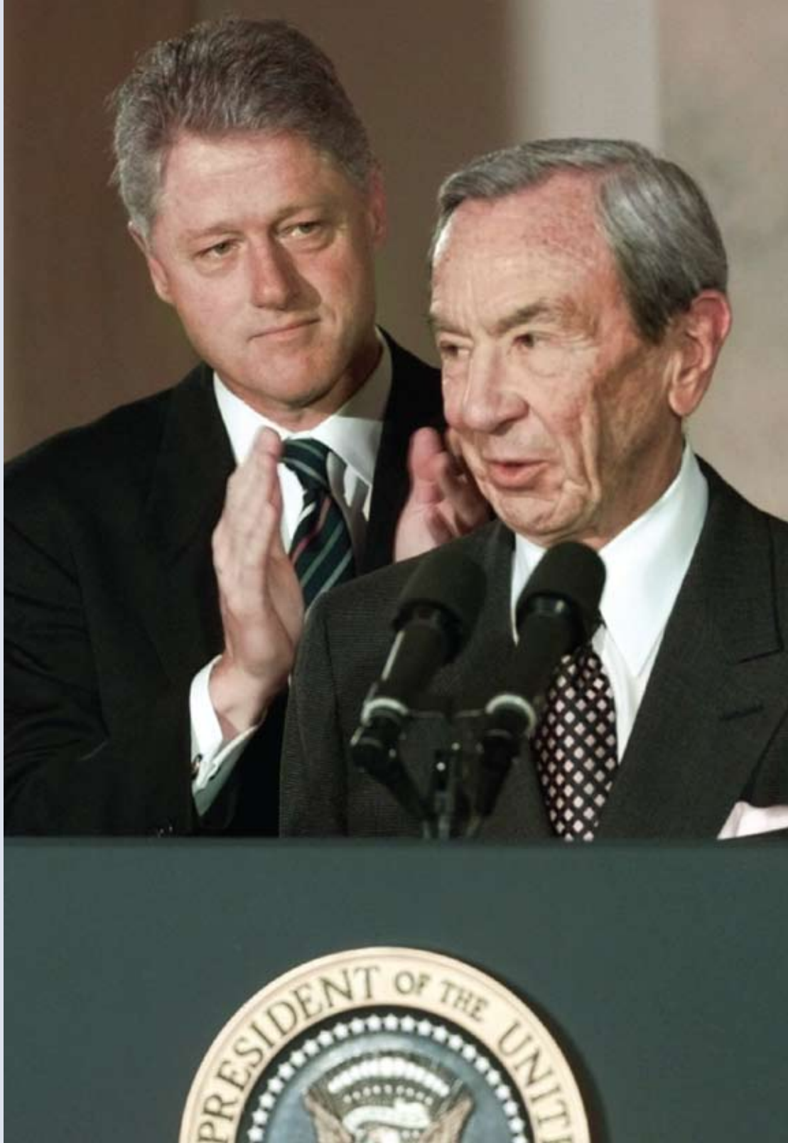
President Bill Clinton and Secretary of State Warren Christopher, November 7, 1996. Christopher wrote to Prime Minister Benjamin Netanyahu: "A hallmark of U.S. policy remains our commitment to work cooperatively to seek to meet the security needs that Israel identifies." The Christopher letter specified "defensible borders for Israel."

on the proposals made by Israeli Prime Minister Ehud Barak at the failed Camp David Summit of July 2000.