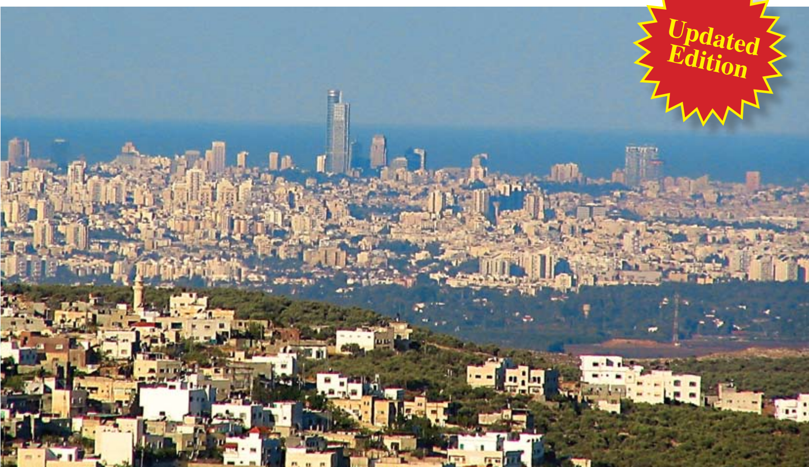
CENTRAL TEL AVIV AS SEEN FROM THE WEST BANK VILLAGE OF DEIR BALLUT