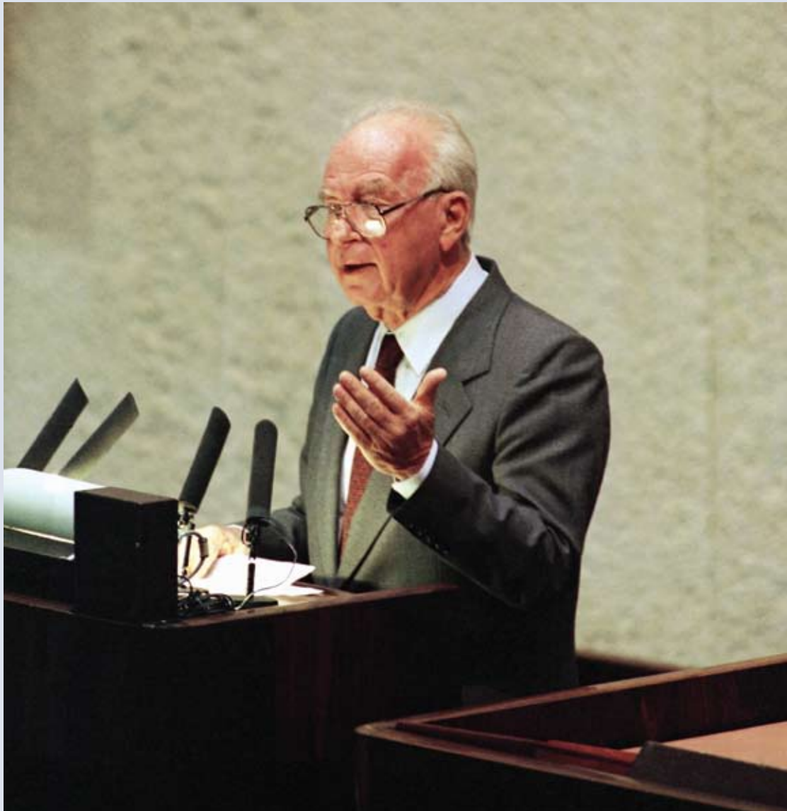
Prime Minister Yitzhak Rabin at the Knesset debate on the Oslo peace accords signed with the Palestine Liberation Organization, September 21, 1993. Rabin foresaw Israeli control of the Jordan Valley and a united Jerusalem in any final status agreement with the Palestinian Authority.

Prime Minister Netanyahu's commitment to a security-first paradigm has been well-received by Israelis because nearly two decades of concession-driven diplomacy not only failed to yield security or earn international goodwill, but led to broad public understanding that Israel's security situation had become perilous.