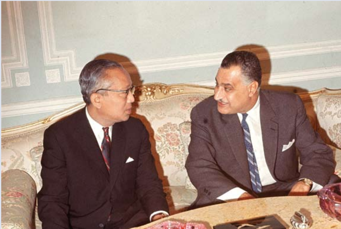
Egyptian President Gamal Abdel Nasser with UN Secretary General U Thant, May 24, 1967, two weeks before the outbreak of the Six-Day War. Thant agreed to Nasser's request to withdraw UN Emergency Forces that had been stationed in Sinai as a buffer since the 1956 war. Nasser replaced the UNEF with Egyptian military divisions ready to attack Israel, precipitating the outbreak of hostilities.

Bank, placing Israel's coastal plain under rocket attack.