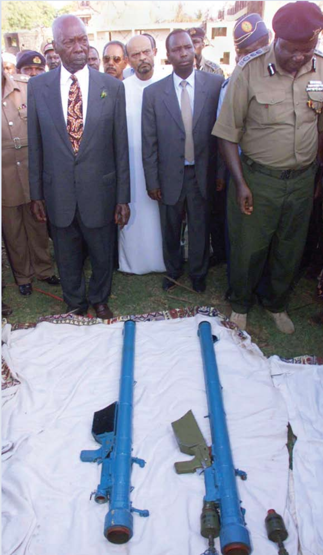
Kenyan President Daniel Arap Moi views missile launchers, at the Paradise Hotel north of Mombasa used in a failed SA-7 shoulder fired missile attack by Al-Qaeda on an Israeli passenger jet on Nov. 29, 2002. The plane with 261 passengers and 10 crew members landed safely in Tel Aviv with no casualties, but 16 people were killed in a simultaneous suicide bombing on the Israeli-owned hotel