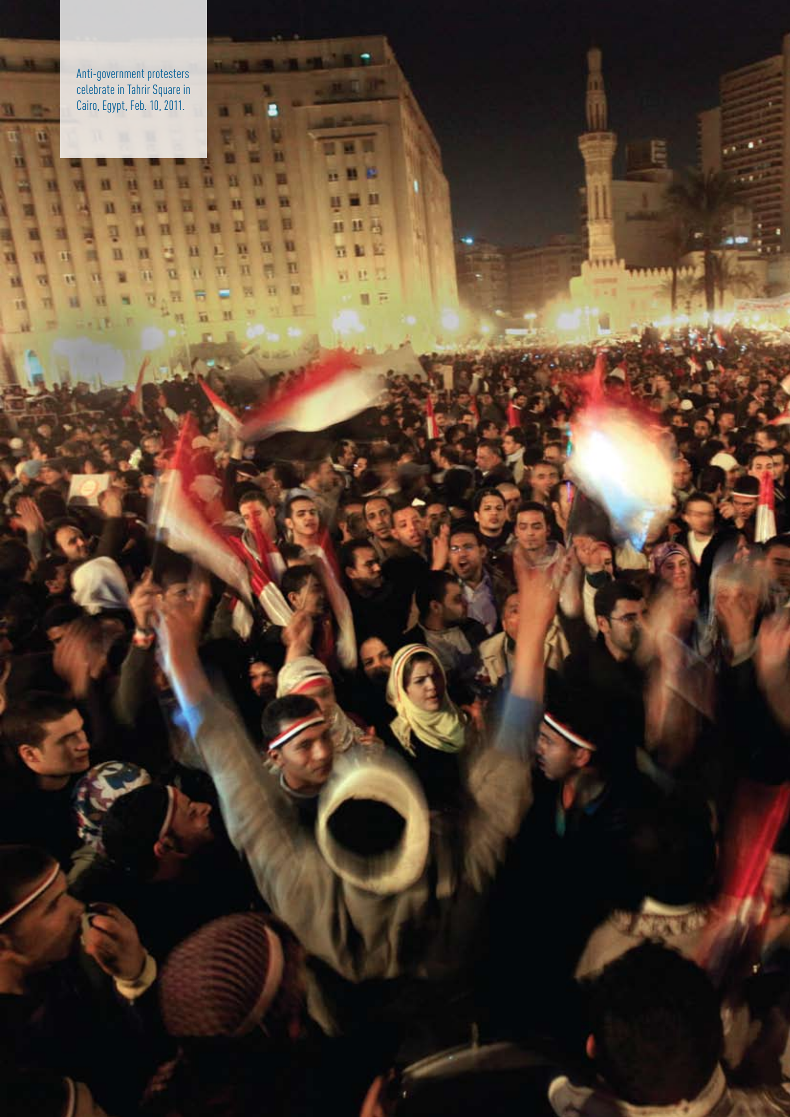
Anti-government protesters celebrate in Tahrir Square in Cairo, Egypt, Feb. 10, 2011.