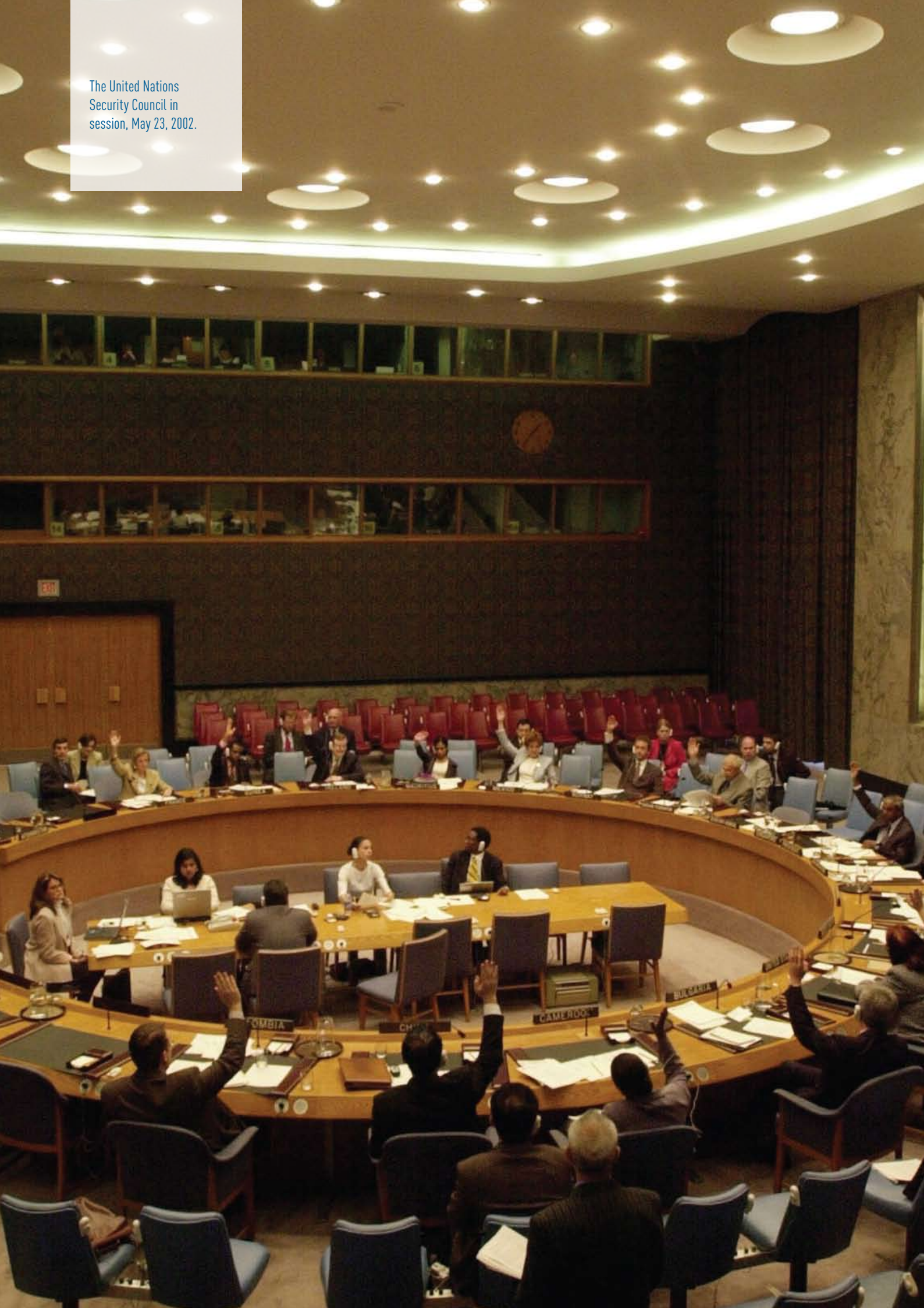
The United Nations Security Council in session, May 23, 2002.