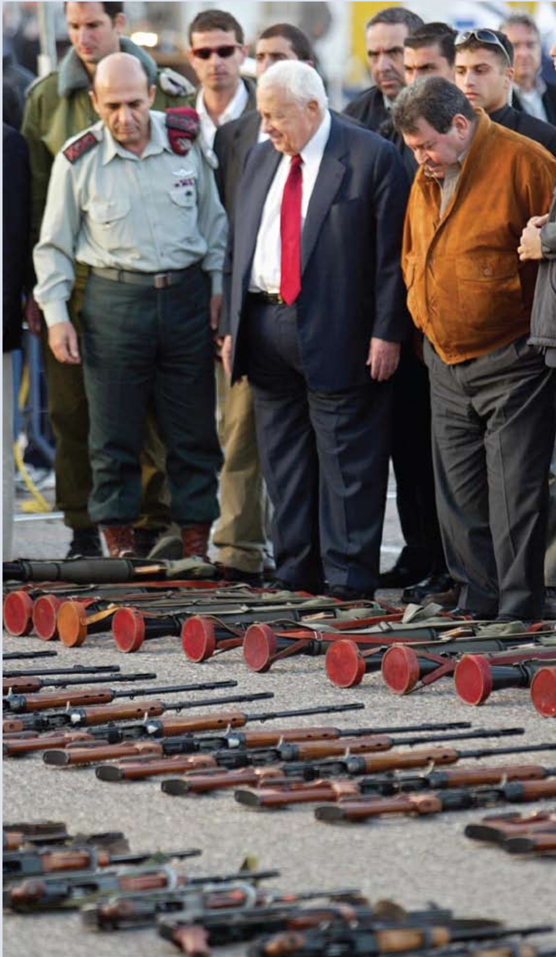
Former IDF Chief of Staff Lt.-Gen. Shaul Mofaz, left; former Prime Minister Ariel Sharon, center; and former Defense Minister Binyamin Ben Eliezer, right, review 50 tons of weaponry seized from the cargo ship Karine A that was captured by Israel and displayed at the Red Sea port of Eilat, January 6, 2002. The Karine A weapons ship was requisitioned by former Palestinian leader Yasser Arafat from Iran's Revolutionary Guards, and illustrated the Iranian regime's direct involvement in supporting the Palestinian Authority's terrorism activity against Israel.