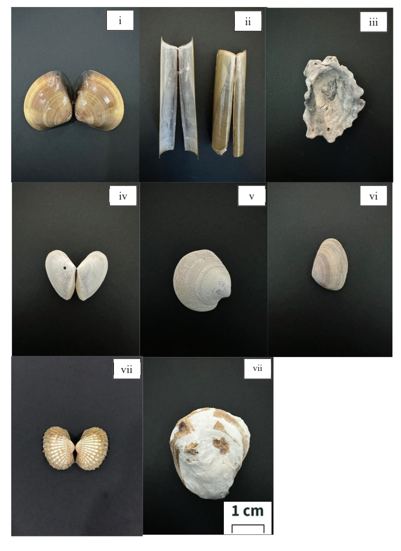
Figure 4 Eight bivalve species collected from the Kelanang coast, Selangor. i. Mereterix casta; ii. Solen marginatus; iii. Crassostrea cucullata; iv. Cochlodesma practenue; v. Dosinia maoriana; vi. Macomangulus tenuis; vii. Tegillarca granosa; and viii. Magallana belcheri.

Another study, Abdul Halim SS, et al. [2] in multiple sites around Penang waters shows that Teluk Kumbar was reported to have a high level of species diversity (H' = 1.21 ± 0.22) and species evenness (J' = 0.92 ± 0.10) of molluscs, while the species richness of Pulau Betong was higher (S = 6.60 ± 6.47). Umbonium vestiarium was more dominant in the fine-sanded intertidal region of Teluk Aling, which had the maximum overall abundance of 2,535 individuals m<sup>-3</sup>. The highest species frequency in all sites, except in Batu Feringghi, were Zeuxis sp. and Diplodonta asperoides . There were significant environmental differences among the sediments of these study sites, such as sediment type, temperature, salinity, and organic matter. The low species diversity in Jelutong