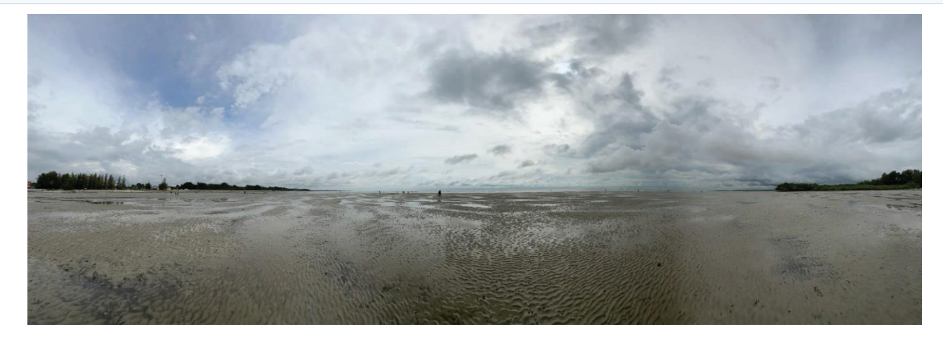
Figure 1 Kelanang coast intertidal area exposed during low tide.

the shoreline until the Morib coast, is well known for the rich biodiversity of coastal wildlife, flora and meiofauna. However, the checklist of molluscs at Kelanang coast have never been documented.