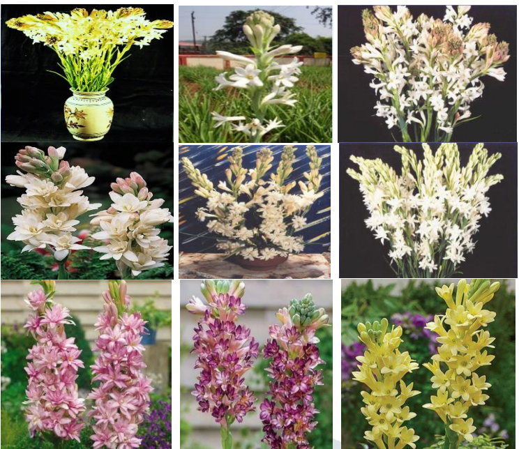
Figure 2: Different varieties of Tuberose (Top: Prajwal, Shringar, Mexican Single; Center: Suvasini, Vaibhav; Bottom: Chia Nong Pink Sapphire, Cindrella, Yellow Baby)