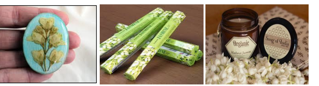
Jasmine Pressed Badges