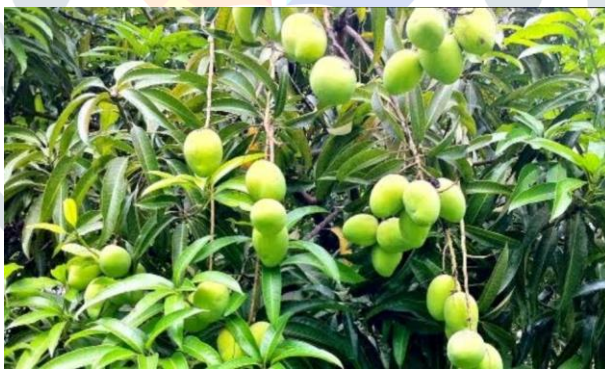
Fig No 6.: Mangifera indica Lin

Mangifera indica grows in the tropical and subtropical region and its parts are commonly used in folk medicine for a wide variety of remedies (23). The plant Mangifera indica has been reported for various therapeutic uses in traditional medicines such as, a fluid extract or the infusion of the bark is used in monorrhagia, leucorrhoea, bleeding piles and in case of haemorrhage from the lungs. Idibs of the leaves calcined are used to remove warts of eyelids. Dried powdered leaves are used in diabetes. Dried flowers in decoction or powder are useful in diarrhea, chronic dysentery and gleet (24). The ethyl acetate and ethanol extracts of the roots of Mangifera indica has been reported to have considerable anti-inflammatory activity as compared with standard drug Diclofenac sodium (25). The phytochemical analysis revealed the presence of flavonoids. The flavonoids have potent anti-inflammatory activity prostaglandin synthesis (26) .