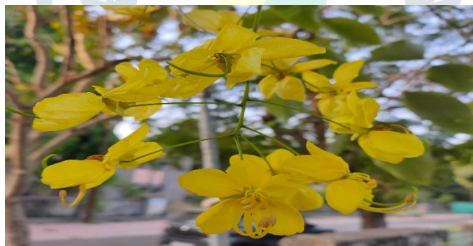
Fig No 4: Cassia fistula L

Cassia fistula tree is one of the most widespread in the forests of India. The whole plant possesses medicinal properties useful in the treatment of skin diseases, inflammatory diseases, rheumatism, anorexia and jaundice. The bark extracts of Cassia fistula possess significant anti-inflammatory effect in the acute and chronic anti-inflammatory model of inflammation in rats. Reactive oxygen species (ROS) generated endogenously or exogenously are associated with the pathogenesis of various diseases such as atherosclerosis, diabetes, cancer, arthritis and aging process. ROS play an important role in pathogenesis of inflammatory diseases. The main constituents responsible for anti inflammatory activity of Cassia fistula are flavnoids and bio-flavnoids(18).