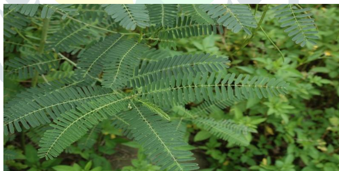
Fig 8 - . Sesbania sesban Linn

The genus Sesbania sesban contains about 50 species, the majority of which are annuals. The greatest species diversity occurs in Africa with 33 species. Although the annual species have received attention, recent research has focused on perennial species. Of the perennial species, Sesbania sesban has shown potential( 29). It is a small perennial tree with woody stems, yellow flowers and linear pods (30).According to the data from literature the phytochemical investigation of crude saponin extract revealed the presence of various constituents like terpenoidal and steroidal saponins, tannins and flavnoids which had been reported to have anti-inflammatory activity( 31).This was proved by inhibition of carrageenan oedema by crude saponins extract. The crude saponin extract have been able to control the increase in Paw edema in early phase and also in late hours related to inhibition of prostaglandins release. Hence, it can be said that the present anti-inflammatory activity of crude saponin extract might be due to its action on the early and latter phase of inflammation(32).