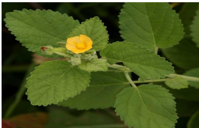
Fig No 5: Sida cordifolia Linn.

Sida cordifolia is a perennial subshrub of the mallow family Malvaceae. It has naturalized throughout the world and is considered an invasive weed in Africa, Australia, Hawaiian islands, New Guinea and French Polynesia 19 . Sida cordifolia is used in folk medicine for the treatment of inflammation of the oral mucosa, blenorrhoea, asthmatic bronchitis and nasal congestion 20 . It has been investigated as an anti-inflammatory.