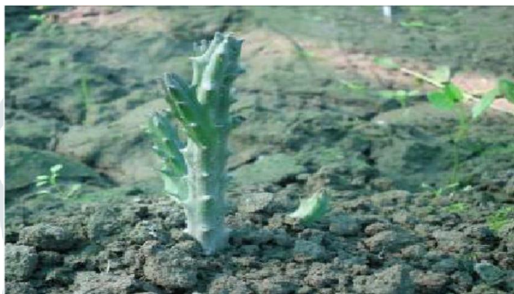
Fig No 1: Caralluma tuberculata

C. tuberculata is a plant largely grown in Pakistan and India (11).The ethanolic extract has been reported to possess significant anti-inflammatory and analgesic activities. Experimental data indicated that the ethanolic extract significantly inhibited carrageenan-induced inflammation in rats. The extract also decreased granuloma formation by cotton pellets in treated rats[11].