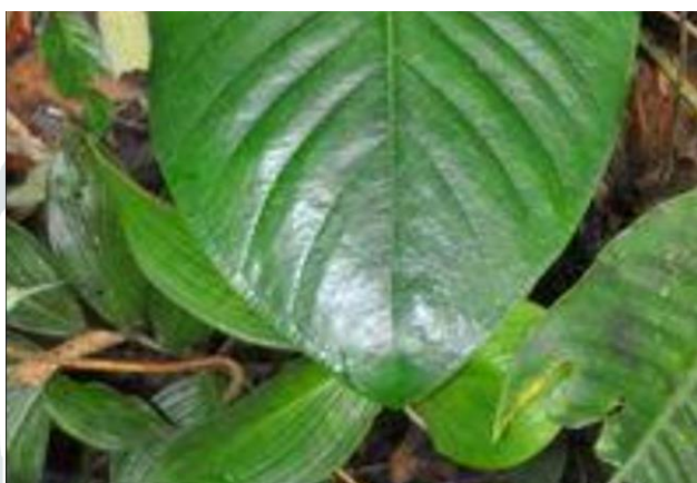
Fig No Anthurium cerrocampanense Croat