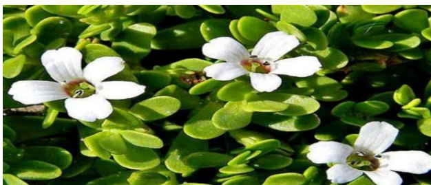
Fig No 12: Bacopa monnieri Linn.

The Bacopa monnieri is a creeping, glabrous, succulent herb, rooting at nodes and habitat of wetlands and muddy shores. Earlier, it is used as a brain tonic to enhance memory development, learning and concentration. The plant has also been used in India and Pakistan as a cardio tonic, digestive aid and to improve respiratory function in cases of bronchoconstriction. The plant possesses anti-inflammatory activity on carrageenan-induced rat paw edema and it has shown 82% edema inhibition when compared to indomethacin. Bacopa monnieri also significantly inhibited 5 lipoxygenase (5-LOX), 15 (LOX) and cyclo oxygenase-2 (COX-2) activities. Bacopa monnieri possesses significant anti-inflammatory activity that may well be relevant to its effectiveness in the healing of various inflammatory conditions in traditional medicine. The anti-inflammatory activity of Bacopa monnieri is due to the triterpenoid and bacoside present in the plant. The ability of the fractions containing triterpenoids and bacosides inhibited the production of pro-inflammatory cytokines such as tumour necrosis factor- \alpha and interleukin-6. This was tested using lipopolysaccharide activated peripheral blood mononuclear cells and peritoneal exudates cells in vitro. So, Bacopa monnieri has the ability to inhibit inflammation through modulation of pro-inflammatory mediator release.