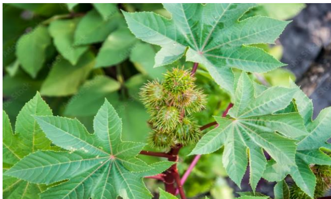
Fig No 8: Ricinus communis Linn.

Ricinus communis Linn. is found almost everywhere in the tropical and subtropical regions of the world. Anti-inflammatory and free radical scavenging activities of the methanolic extract of Ricinus communis root was studied by Ilavarasan et al in Wistar albino rats. The methanolic extract exhibited significant anti-inflammatory activity in carrageenan-induced hind paw edema model. The methanolic extract showed significant free radical scavenging activity by inhibiting lipid peroxidation. The observed pharmacological activity may be due to the presence of phytochemicals like flavonoids, alkaloids and tannins in the plant extract(28).