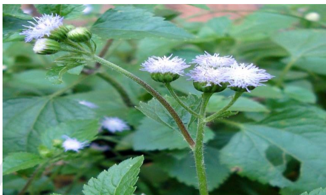
Fig No 9: Ageratum conyzoides L.

A. conyzoides is a plant known in Brazil variously as “Mentrasto”, “Erva de So Joao” and used in traditional medicine for its anti-inflammatory, analgesic and anti-diarrhoeal properties [26]. In some African countries, A. conyzoides is used as an antienteralgic and antipyretic drug [27]. Experimentally, the leaf extract has been shown to be effective in the treatment of chronic pain in osteoarthritis [28] and in causing a fall in rectal temperature [29]. Reports showed that the essential oil exhibited significant anti inflammatory effect [30] while the water-soluble fraction of the 70% ethanol leaf extract exhibited anti-inflammatory and analgesic properties [31]. Further experimental evidence suggest that the water-soluble fraction of the 70% ethanol leaf extract inhibited zymosan-induced neutrophil migration into the peritoneal cavity [32]. The fraction was however ineffective on zymosan and dextran-induced edema [32], suggesting that the extract could act by inhibiting cyclooxy genase enzyme [32].