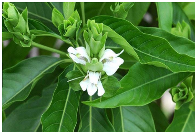
Fig No 3: Adhatoda vaasica

Adhatoda vasica L. is an indigenous herb belonging to family Acanthaceae. The plant has been used in the indigenous system of medicine in worldwide as herbal remedy for treating cold, cough, whooping cough, chronic bronchitis, asthma, sedative expectorant, antispasmodic, anthelmintic, rheumatism and rheumatic painful inflammatory swellings. The drug is employed in different forms such as fresh juice, decoction, infusion and powder. It is also given as alcoholic extract and liquid extract or syrup(15). This plant contains alkaloids, tannins, flavnoids, terpenes, sugars and glycosides(16). The anti-inflammatory potential of ethanolic extract has been determined by using carrageenan-induced paw edema assay, formalin-induced paw edema assay in albino rats. The ethanolic extract of Adhatoda vasica produced dose dependent inhibition of carrageenan and formalin-induced paw edema(17).