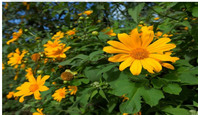
Fig No 2: Tithonia diversifoli

2.Tithonia diversifolia (Hemsl.) Gray (Compositae)- Aerial parts of T. diversifolia are among the constituents of the herbal remedy “Wuu-jao-jih ing” (12) used in folk medicine in Taiwan [13]. It is employed in the treatment of hepatitis, cystitis and jaundice [14]. The anti inflammatory activity of aqueous extract of the aerial part has been reported [13]. The results show that the aqueous extract inhibited paw edema induced by carrageenan. The extract was found effective in the two phases of the carrageenan induced inflammatory response [13].