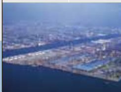
Completed Ohgishima (foreground)

Construction of Ohgishima began at Keihin Steel Works