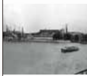
Tsukiji Shipyard in 1891

Shozo Kawasaki established Kawasaki Tsukiji Shipyard in Tsukiji, Tokyo