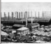
Fukiai Works in 1930