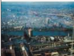
Keihin Steel Works

Keihin Steel Works established (consolidation of Kawasaki, Tsurumi and Mizue works)