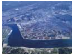
Fukuyama Works in 1966