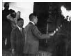
Blowing-in of first blast furnace

First blast furnace blown in and integrated steel production started