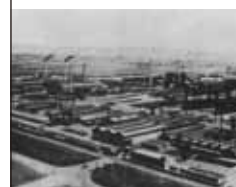
Shipyard in 1940

Yokohama Shipyard launched (later renamed Asano Shipyard Co., Ltd.)