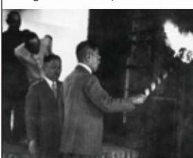
Blowing-in of first blast furnace

June 1936 First blast furnace blown in and integrated steel production started