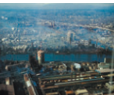
Keihin Steel Works

April 1968 Keihin Steel Works established (consolidation of Kawasaki, Tsurumi and Mizue works)