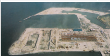
Tsu Shipyard at the time of construction

January 1969 Tsu Shipyard inaugurated operations