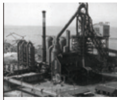
No. 1 blast furnace at Chiba Works

February 1951 Chiba Works established as first modern integrated iron and steel works in postwar Japan