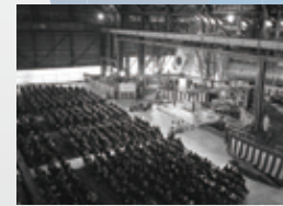
Blowing-in ceremony of No. 1 blast furnace at Mizushima Works

July 1961 Mizushima Works established in Kurashiki, Okayama Prefecture