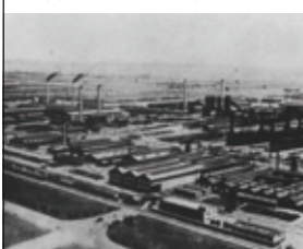
Shipyard in 1940

April 1916 Yokohama Shipyard launched (later renamed Asano Shipyard Co., Ltd.)