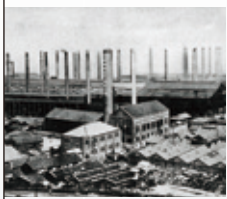
Fukiai Works in 1930

October 1896 Kawasaki Dockyard Company, Ltd. established (later renamed Kawasaki Heavy Industries, Ltd.)