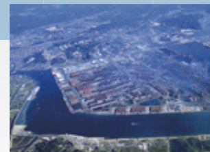
Fukuyama Works in 1966

June 1936 First blast furnace blown in and integrated steel production started