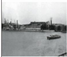
Tsukiji Shipyard in 1891