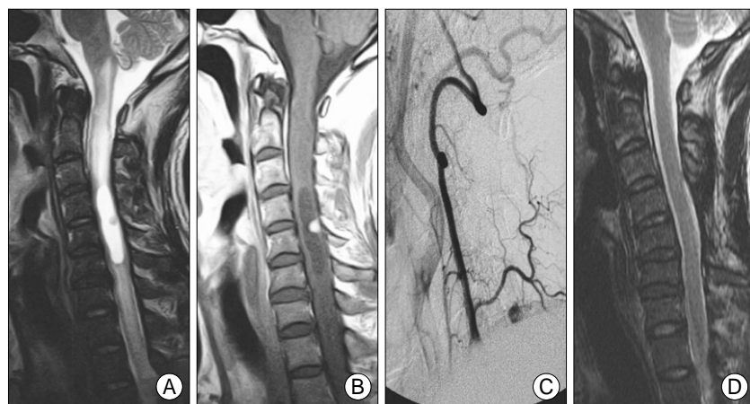
Fig. 1. Preoperative magnetic resonance imaging (MRI) : T2-weighted sagittal image (A) showing a hyperintense lesion with spinal cord swelling from lower medulla to T2-3 level. Gadolinium-enhanced sagittal image (B) reveals well enhancing mass, approximately 1 cm diameter at the C5 spinal cord level. Preoperative right vertebral angiography (C) demonstrates hypervascular tumor staining fed by the ascending cervical artery of right thyrocervical trunk. Postoperative MRI : T2-weighted sagittal image (D) shows a marked diminution of the hyperintense lesion that existed previously in the preoperative MRI. The swelling of the cervical cord was nearly disappeared.

U/Ext. : upper extremity; L/Ext. : lower extremity; Rt. : right; Lt. : left; C : cervical; T : thoracic; L : lumbar; C-M : cervico-medullary; IDEM : intradural and extramedullary; IM : intramedullary; RCC : renal cell carcinoma; HB : hemangioblastoma; GTR : gross total removal; STR : subtotal removal