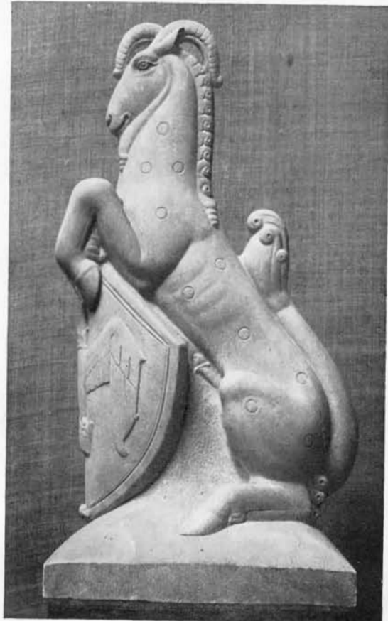
The Studio; London