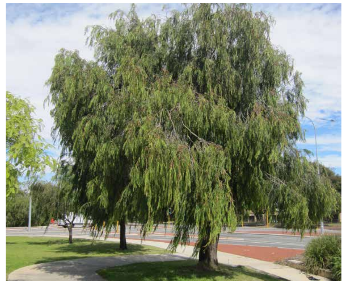
Mature Peppermint tree on Selkirk Drive, Kinross