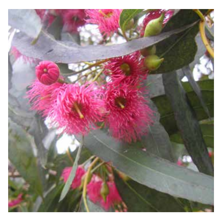
Close-up of Yellow Gum flowers

Showy red to pink flowers are produced in autumn through to winter, which attracts birds and insects. After flowering bell shaped seed capsules are formed.