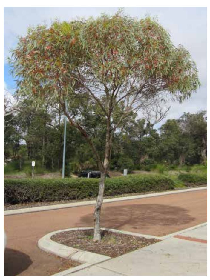
Coral Gum on Lakeside Drive, Joondalup