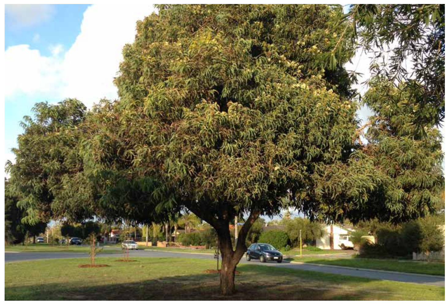
Mature Yellow Bloodwood on Beach Road median, Warwick

City of Joondalup | Boas Avenue Joondalup WA 6027 | PO Box 21 Joondalup WA 6919 | T: 9400 4000 F: 9300 1383 | joondalup.wa.gov.au 9552 - LAST UPDATED MARCH 2019