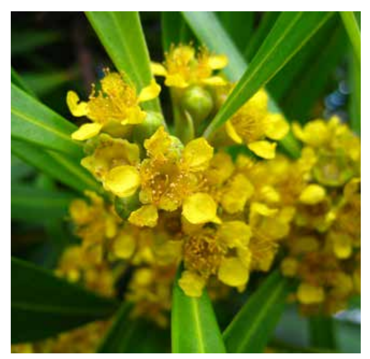
Close-up of Water Gum foliage and flowers.

The tree has port-coloured bark that peels back to reveal mottled cream patches. It produces short clusters of small, yellow, perfumed flowers in summer which provide a food source for nectar feeding birds and insects.