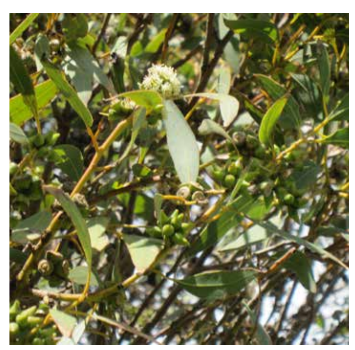
Close-up of Redheart Moit foliage and flowers

The tree has rough grey bark and heart-shaped juvenile bluegreen leaves which mature into glossy grey-green leaves. It produces clusters of white flowers from winter to summer. Mature trees provide habitats for native fauna.