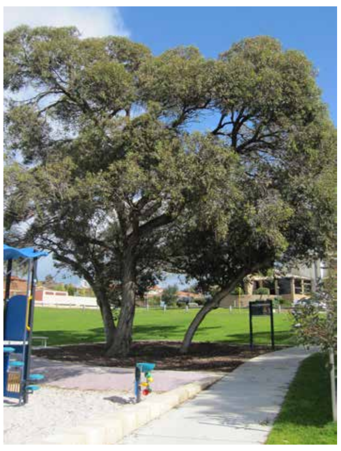
Mature Redheart Moit on Tom Walker Park, Sorrento