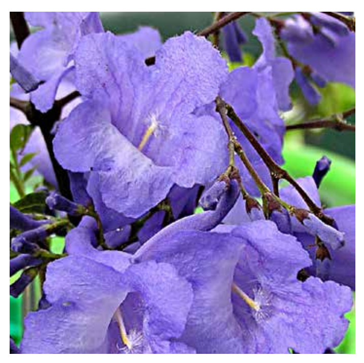
Close-up of Jacaranda foliage and flowers

The tree produces an abundance of showy blue to purple, lightly fragrant, trumpet-shaped flowers from late spring through to summer.