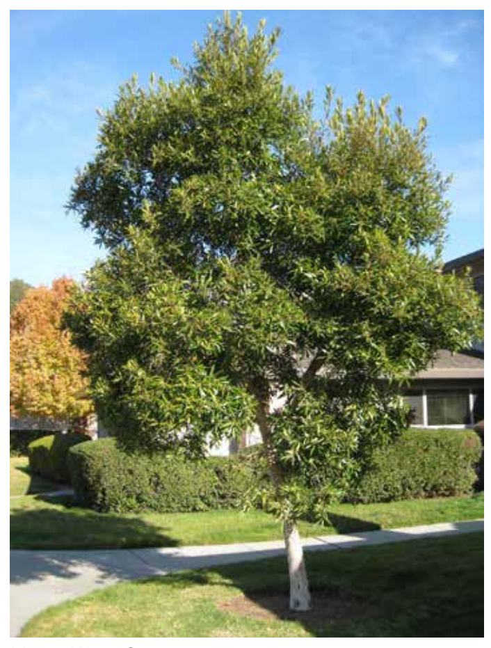
Mature Water Gum.