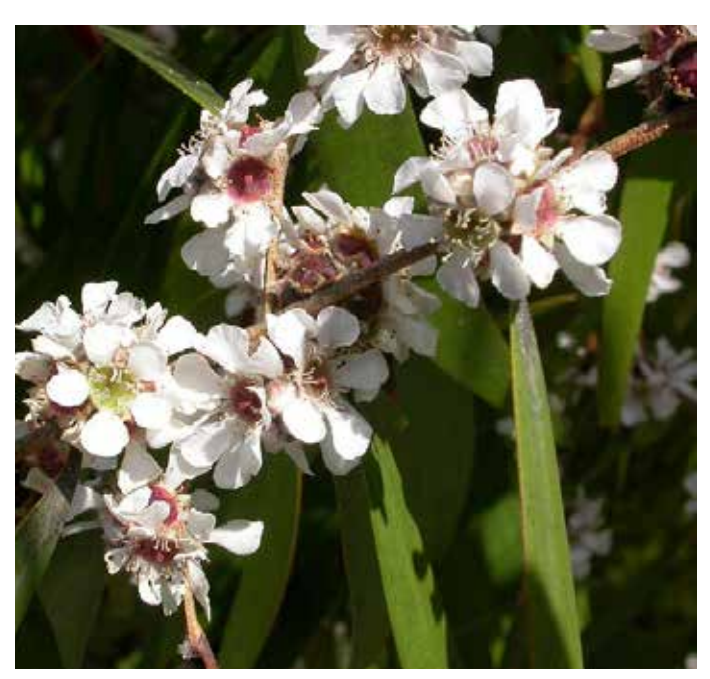
Close-up of Peppermint tree flowers

It has fibrous brown bark with long narrow dull-green leaves. Clusters of small, white, five petalled flowers are produced from spring to summer.