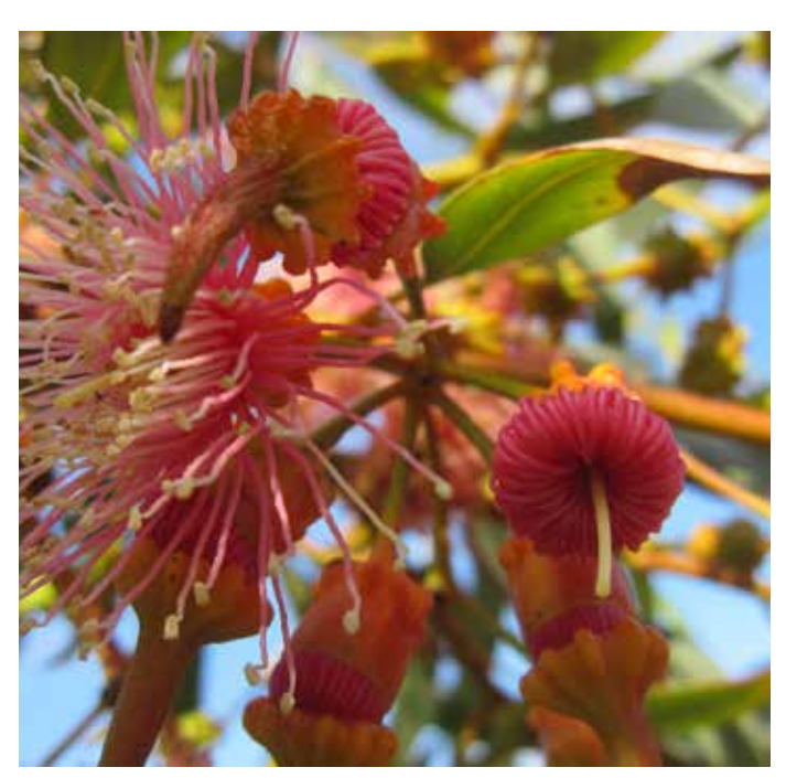
Close-up of Coral Gum foliage and flowers

The tree has rough flaky grey-black bark and grey-green leaves. The developing flowers are covered by decorative horned red caps. A prolific display of coral red to pink flowers are produced through spring and summer.