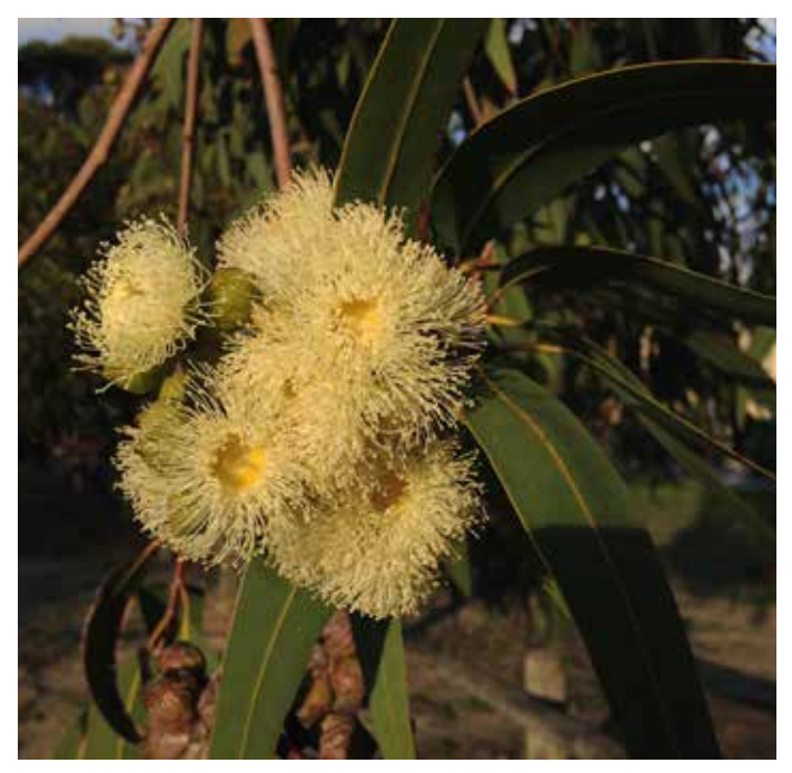
Close-up of Yellow Bloodwood foliage and flowers

The tree has yellow-brown scaly bark and thick sickle-shaped bluish-grey-green leaves. It produces decorative clusters of large creamy flowers in spring which provide food for nectar feeding birds and insects.