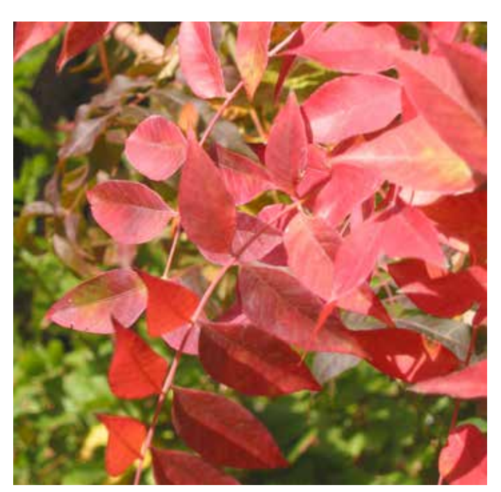
Close-up of Chinese Pistachio foliage and flowers

The tree has rich green leaves turning to bright orange in autumn with yellow to red flowers in spring.