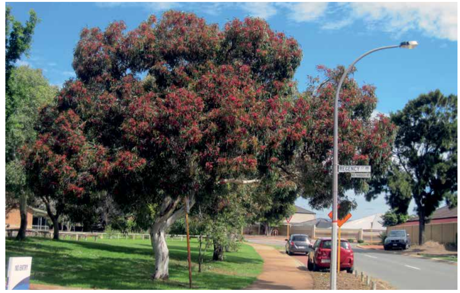
Mature Yellow Gum on Ambassador Drive, Currambine