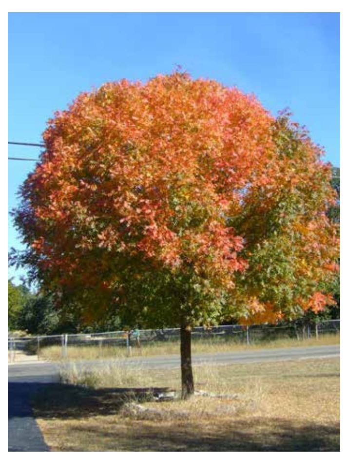
Mature Chinese Pistachio.