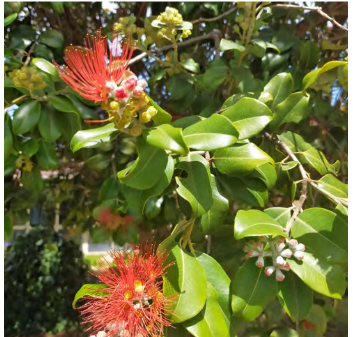
Close-up of Tuckeroo flowers

The tree has smooth grey-brown bark with raised horizontal lines and produces yellow-green flowers in spring followed by decorative orange-yellow seed pods in summer.