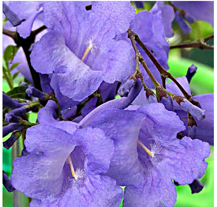
Close-up of Jacaranda flowers

The tree produces an abundance of showy blue to purple, lightly fragrant, trumpet-shaped flowers from late spring through to summer.