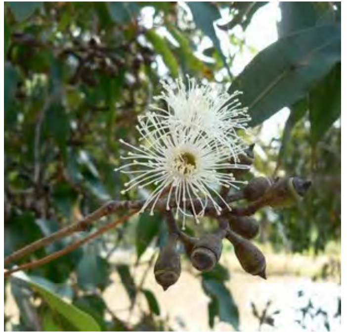
Close-up of Spotted Gum flowers

From winter to spring small, white flowers are produced followed by urn shaped nuts. The flowers have a slight honey fragrance that attracts birds and insects.