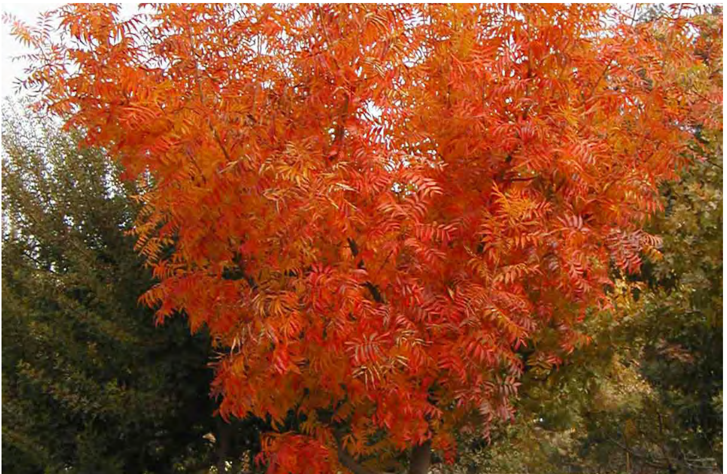
Chinese Pistachio Tree