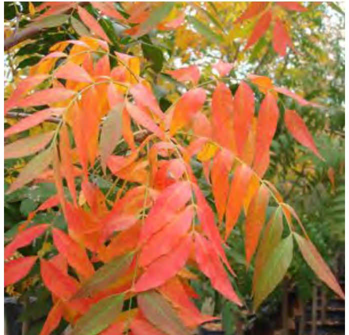
Close-up of Chinese Pistachio autumn foliage

The tree has dark green pinnate leaves in summer. In autumn the leaves turn a variety of bright yellow, orange and scarlet colours, with the colour lasting quite late into winter. This tree is sterile and does not fruit.