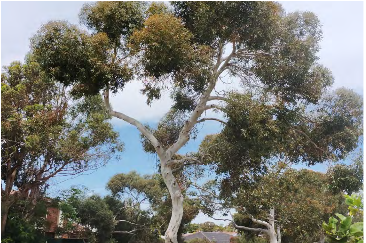
Mature Dwarf Sugar Gum