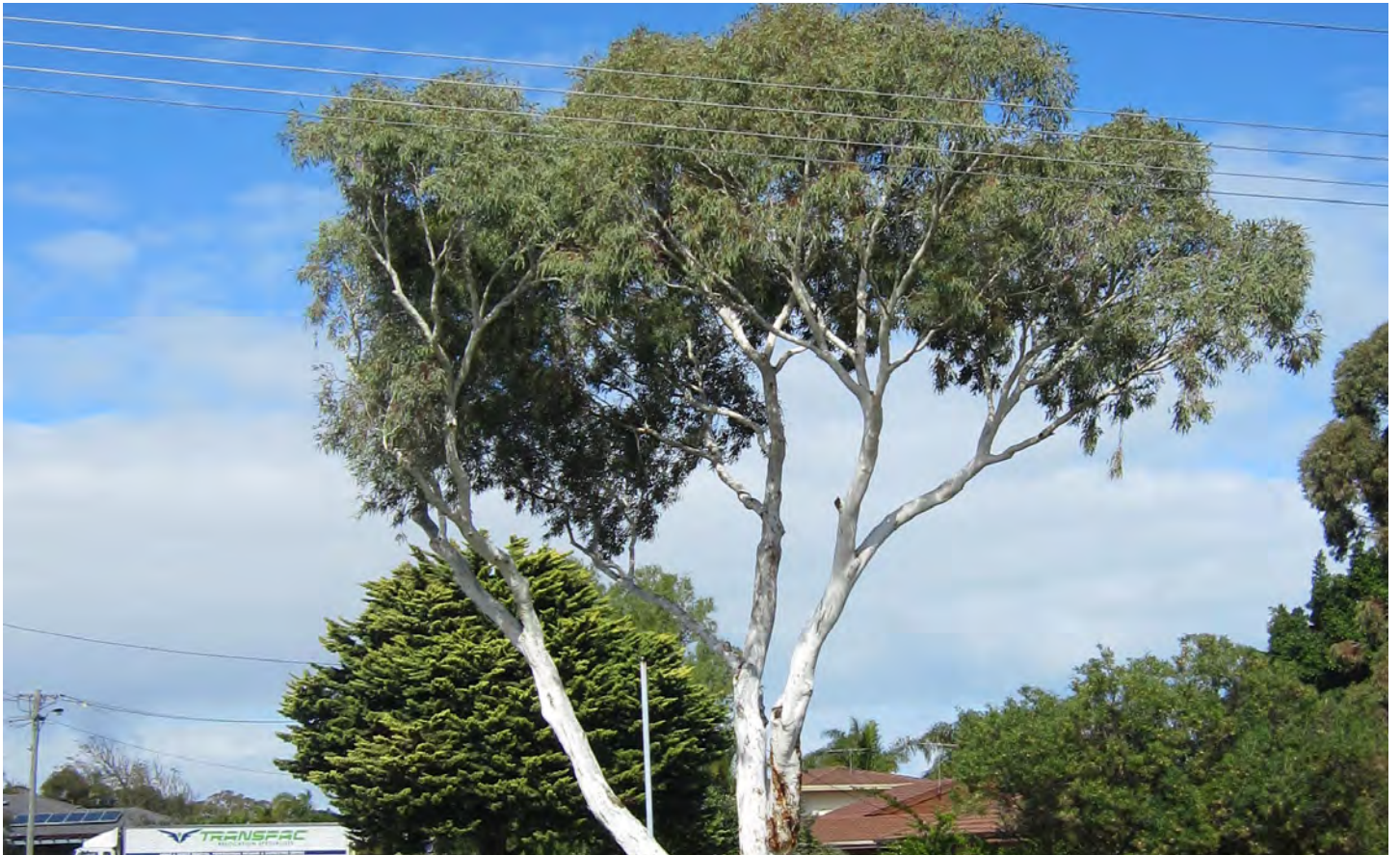
Mature Little Ghost Gum