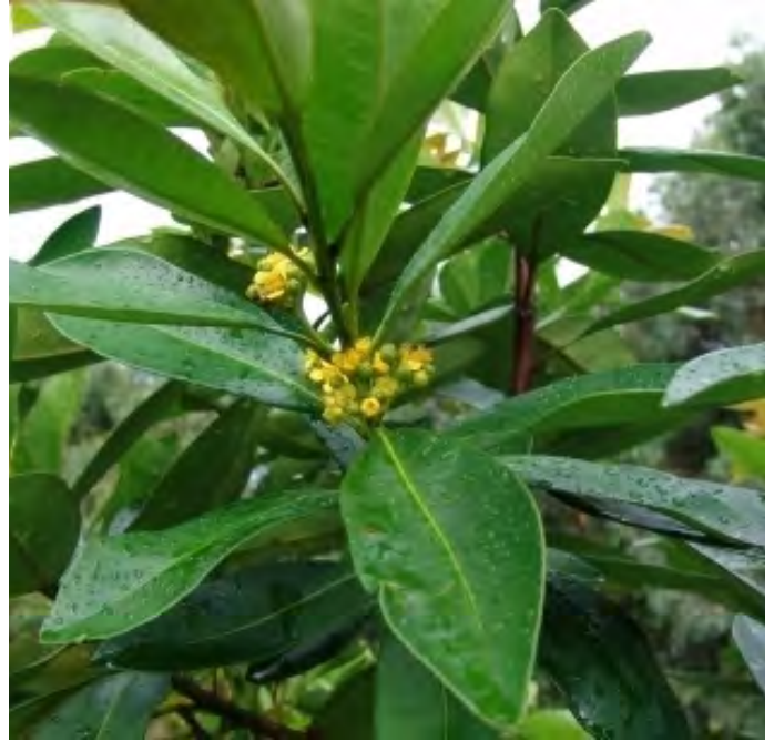
Close-up of Water Gum flowers

The tree has port-coloured bark that peels back to reveal mottled cream patches. It produces short clusters of small, yellow, perfumed flowers in summer which provide a food source for nectar feeding birds and insects.