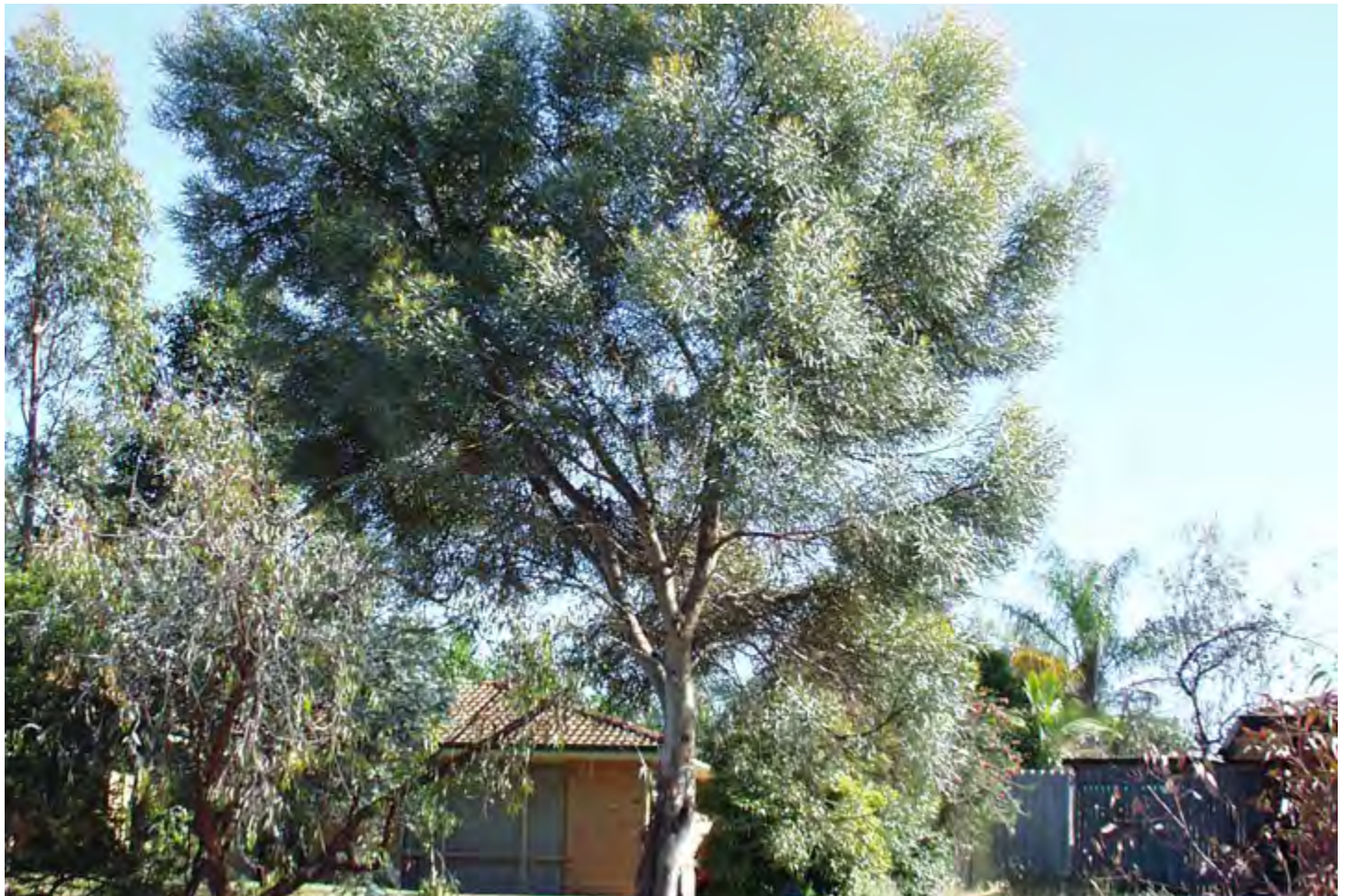
Mature Swamp Mallet