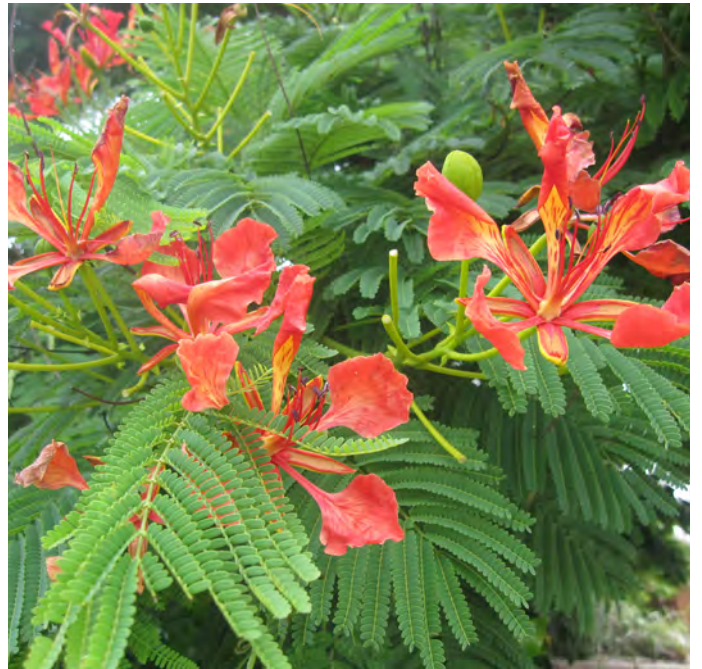
Close-up of Royal Poinciana flowers

The tree has fern-like leaves and produces large, showy, scarlet to red, pea-like flowers in mid-summer.