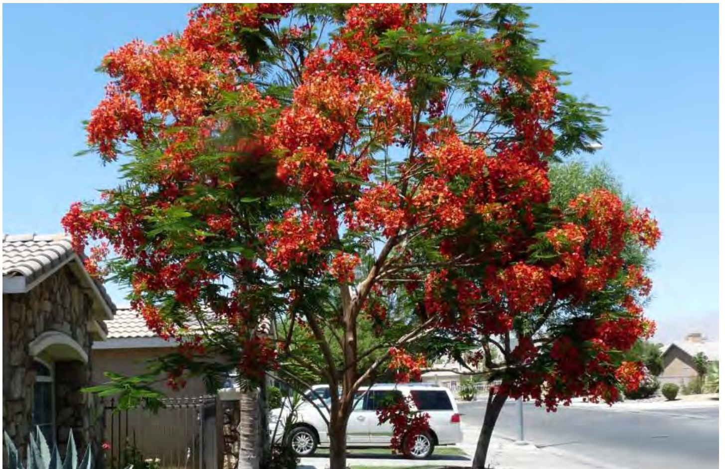
Mature Royal Poinciana