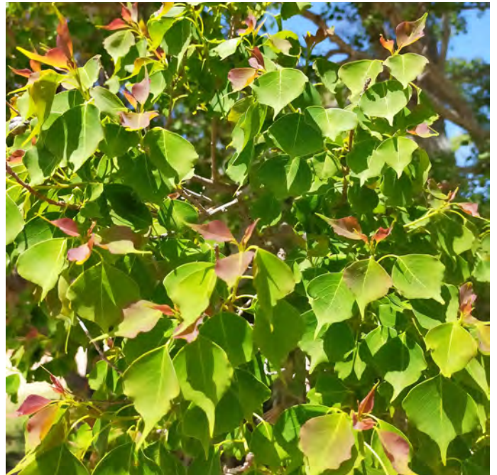
Close-up of Chinese Tallow foliage

Flowers are inconspicuous; however, the autumn leaves create a beautiful colour display.