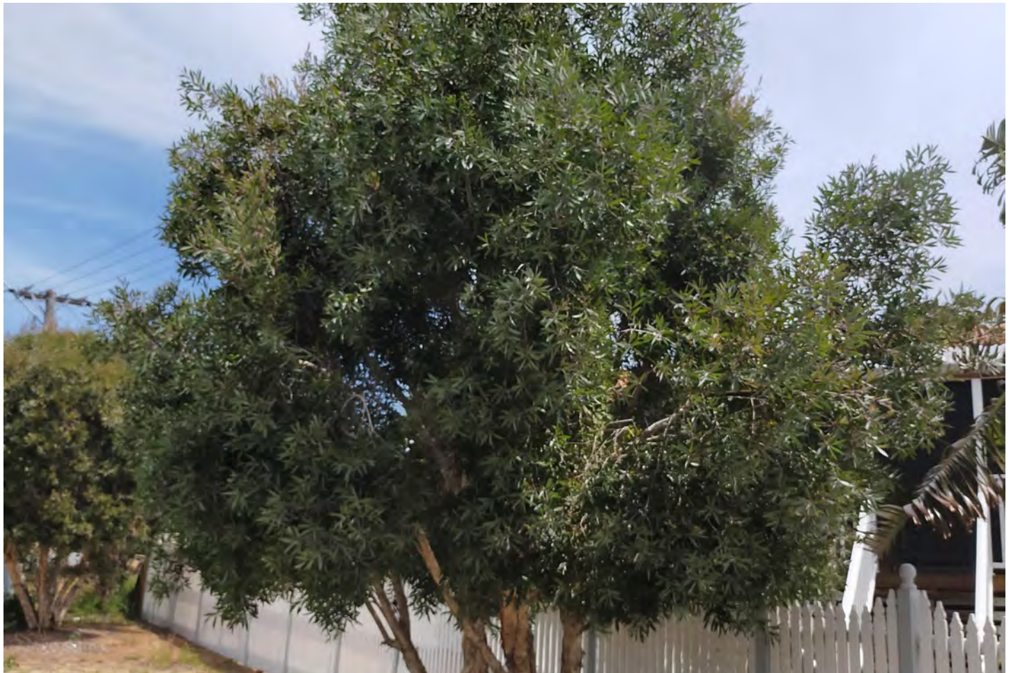
Mature Broad-leaved Paperbark