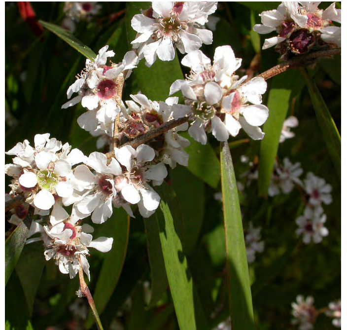
Close-up of Peppermint Tree flowers

It has fibrous brown bark with long narrow dull-green leaves. Clusters of small, white, five petalled flowers are produced from spring to summer.