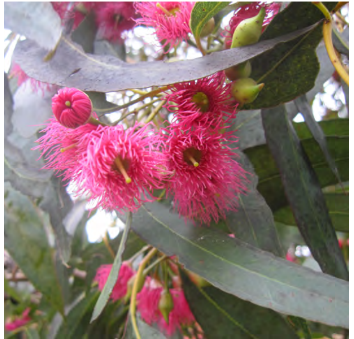
Close-up of Yellow Gum flowers

Showy red to pink flowers are produced in autumn through winter, which attracts birds and insects. After flowering bell shaped seed capsule are formed.