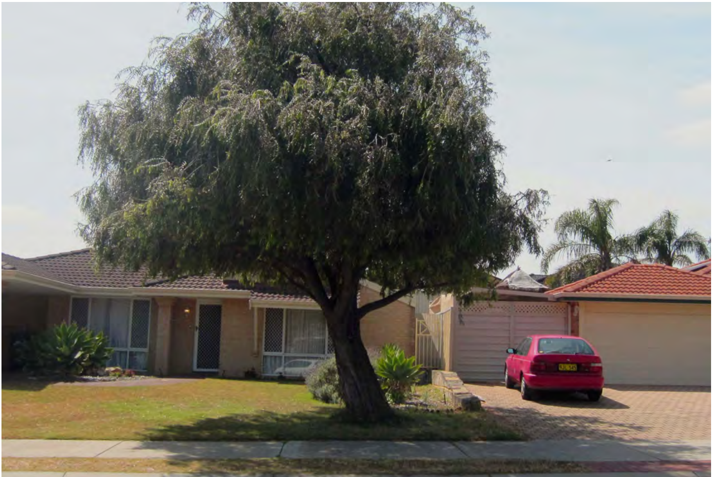
Mature Peppermint Tree