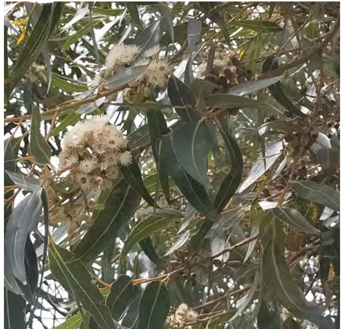
Close-up of Dwarf Sugar Gum flowers

The tree has mottled grey bark and produces clusters of creamy white flowers in late summer.