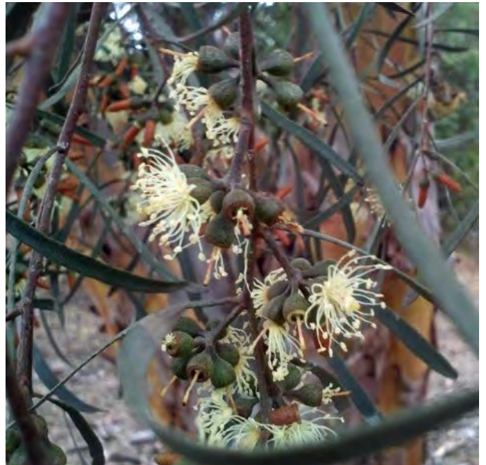
Close-up of Swamp Mallet flower

The tree has satin-like, grey-brown bark and produces cream flowers from winter to summer.