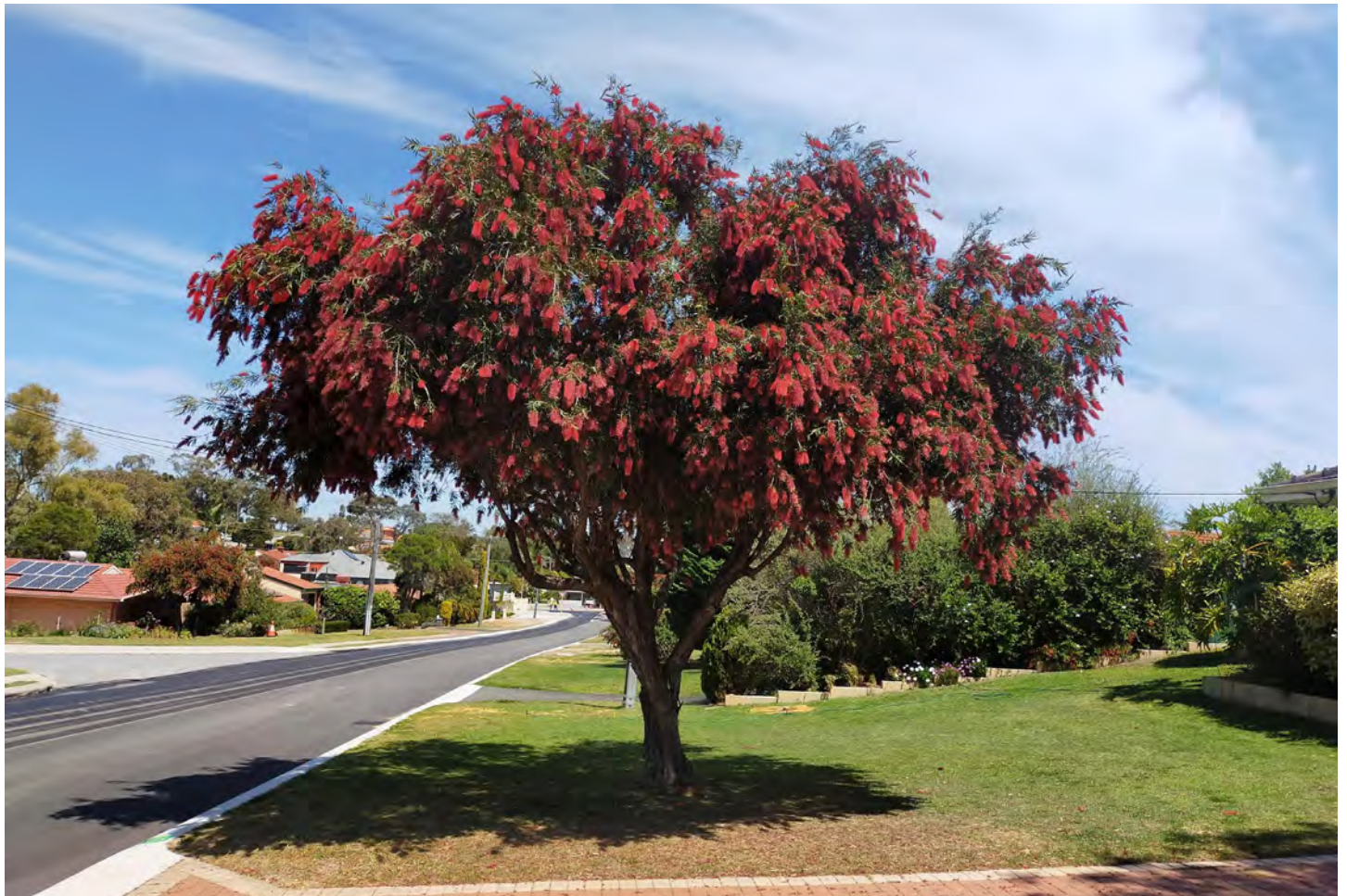
Mature Kings Park Bottlebrush