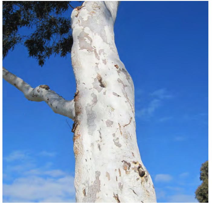
Close-up of Little Ghost Gum bark

The tree has smooth, stark white bark that extends the length of the trunk to small twigs. Small white-cream flowers appear in spring and summer providing a food source for nectar feeding birds.