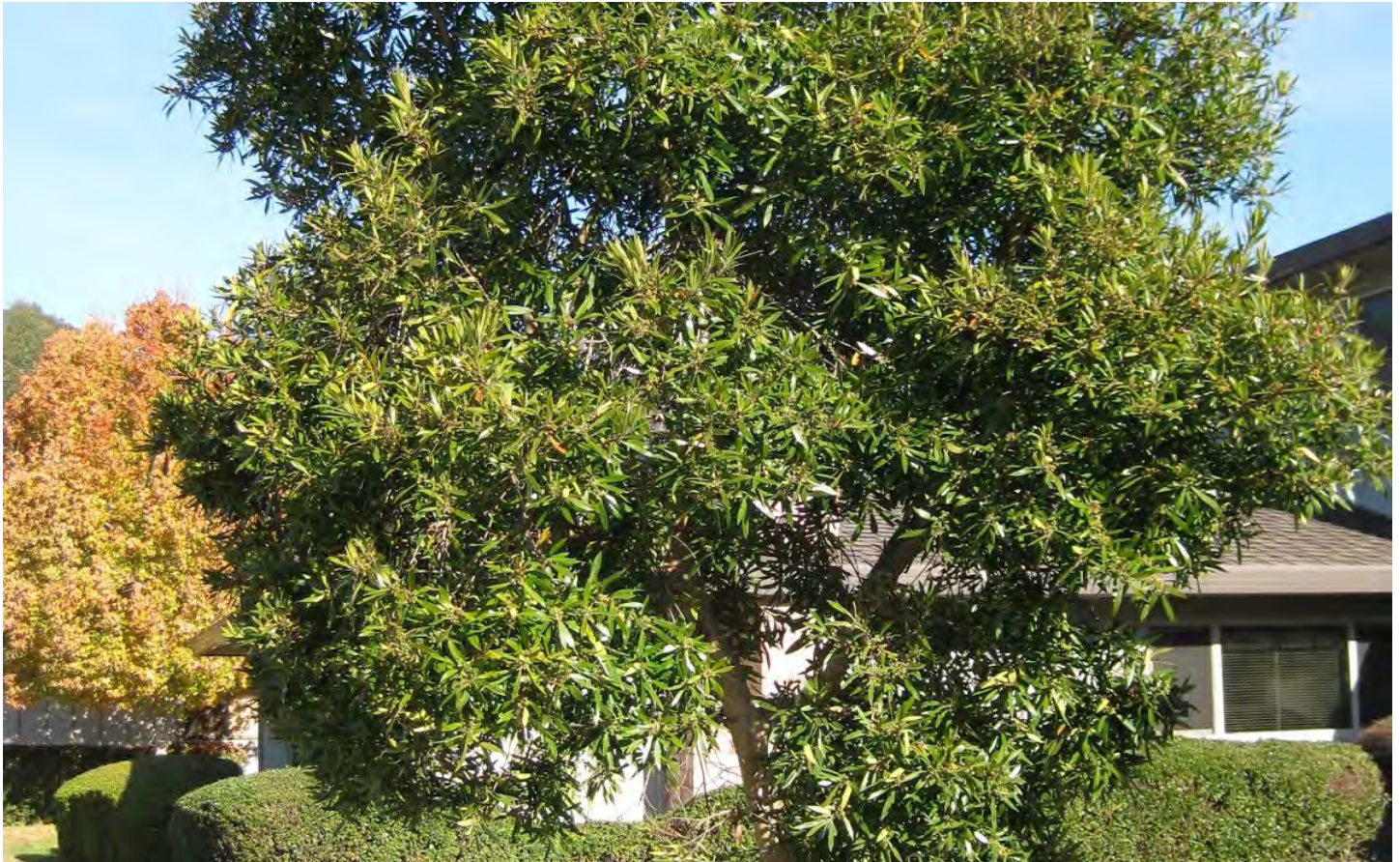
Mature Water Gum