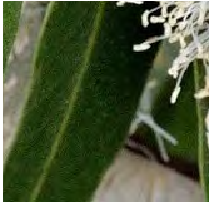
Close-up of Tuart flowers

The tree has rough, greyish, box-like bark that extends the length of the trunk to small twigs. Showy white feather-like flowers appear in mid-summer to mid autumn. Mature trees provide habitats for many native fauna.