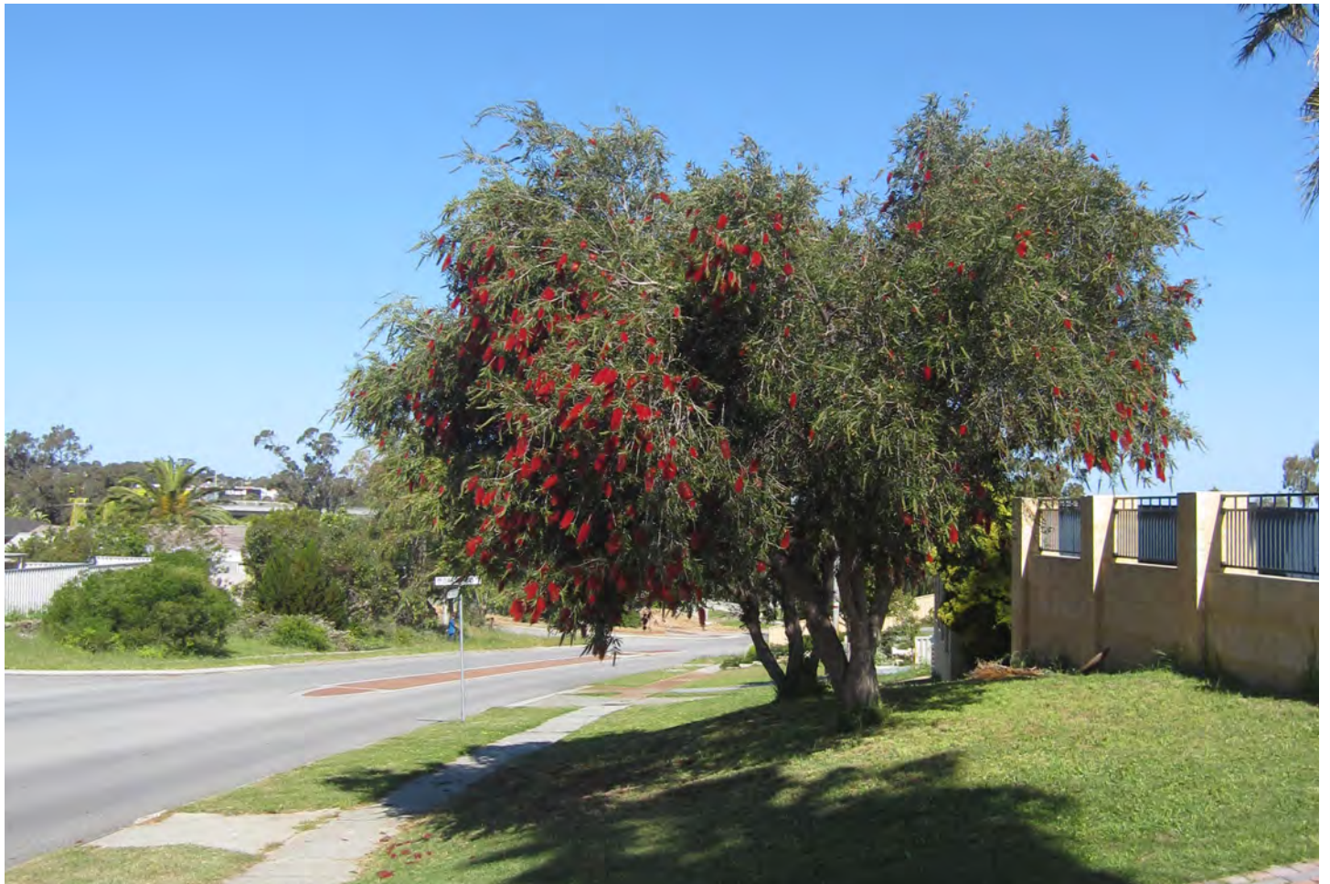
Mature Weeping Bottlebrush