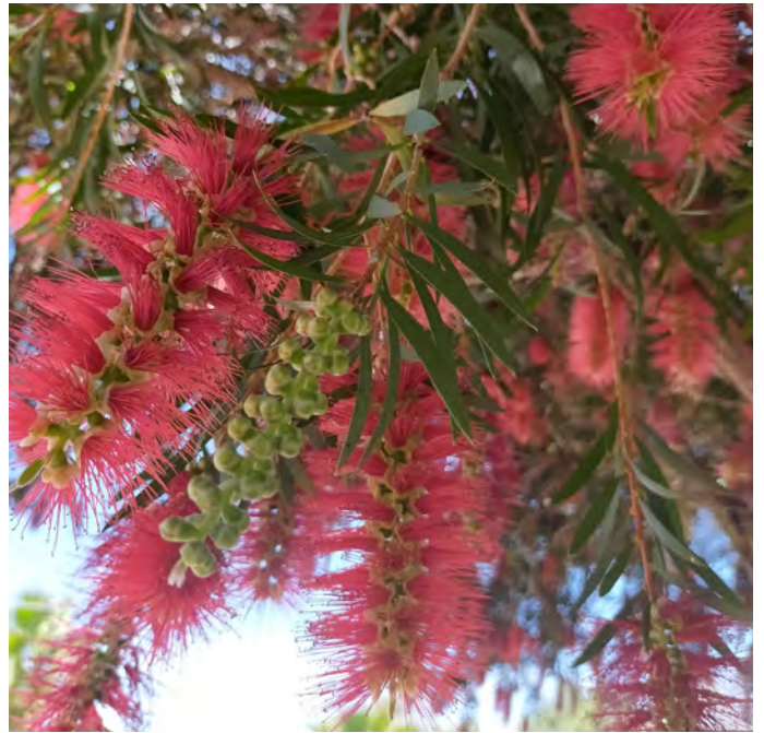
Close-up of Kings Park Bottlebrush flowers

An abundance of brilliant crimson bottle-brush like flowers are produced from spring through autumn. The flowers attract many native and non-native birds.