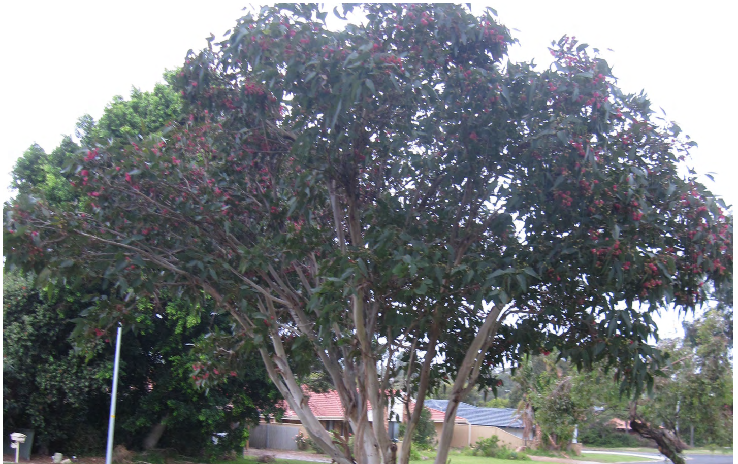
Mature Yellow Gum