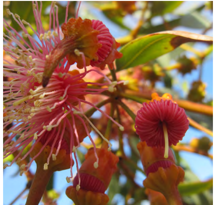
Close-up of Coral Gum flowers

The tree has rough flaky grey-black bark and grey-green leaves. The developing flowers are covered by decorative horned red caps. A prolific display of coral red to pink flowers are produced through spring and summer.