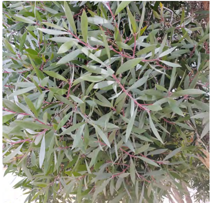
Close-up of Broad-leaved Paperbark bark

The tree has papery, light bark and striking bottlebrush flowers which appear in autumn providing a food source for nectar feeding birds.