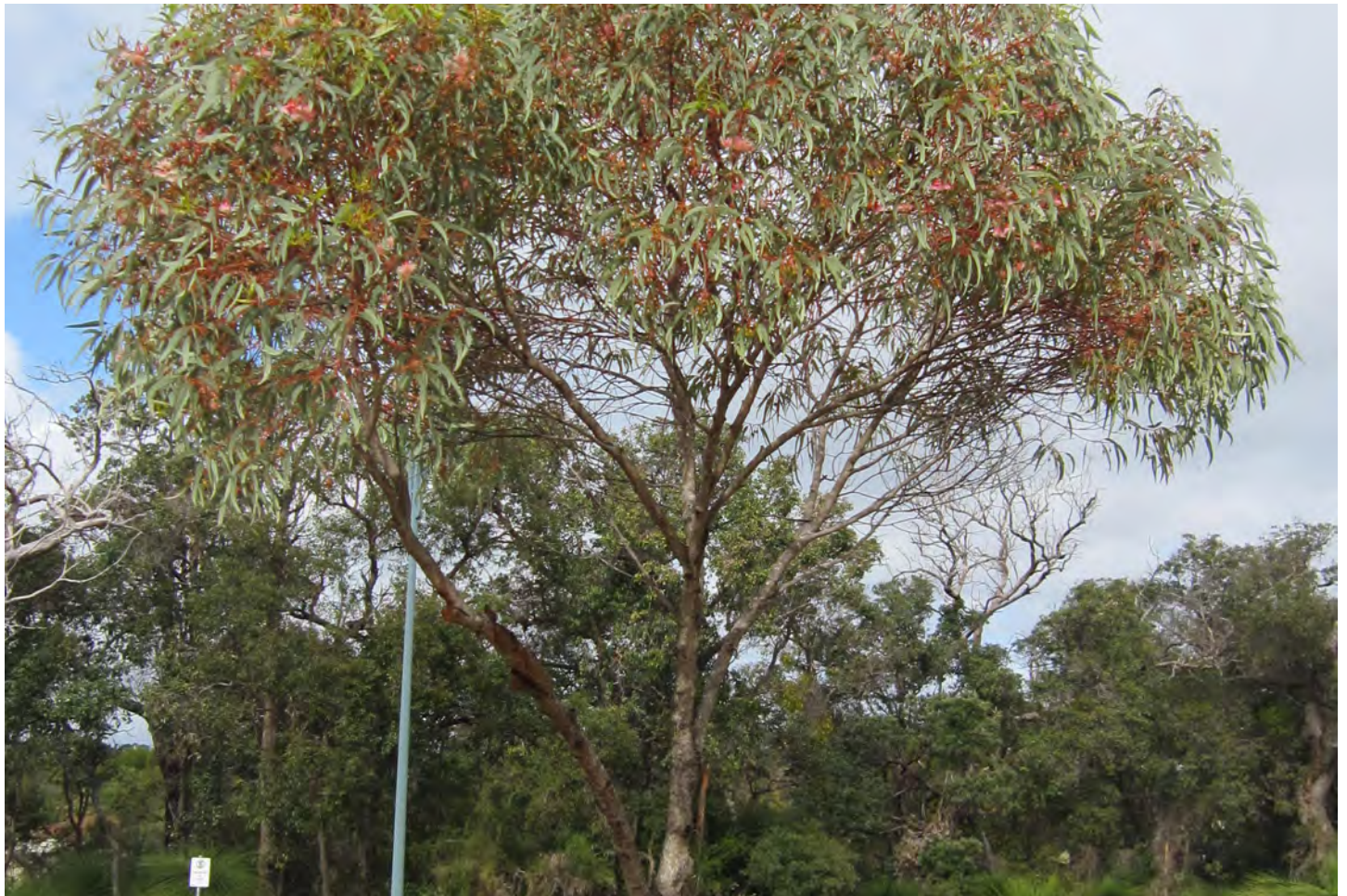
Mature Coral Gum