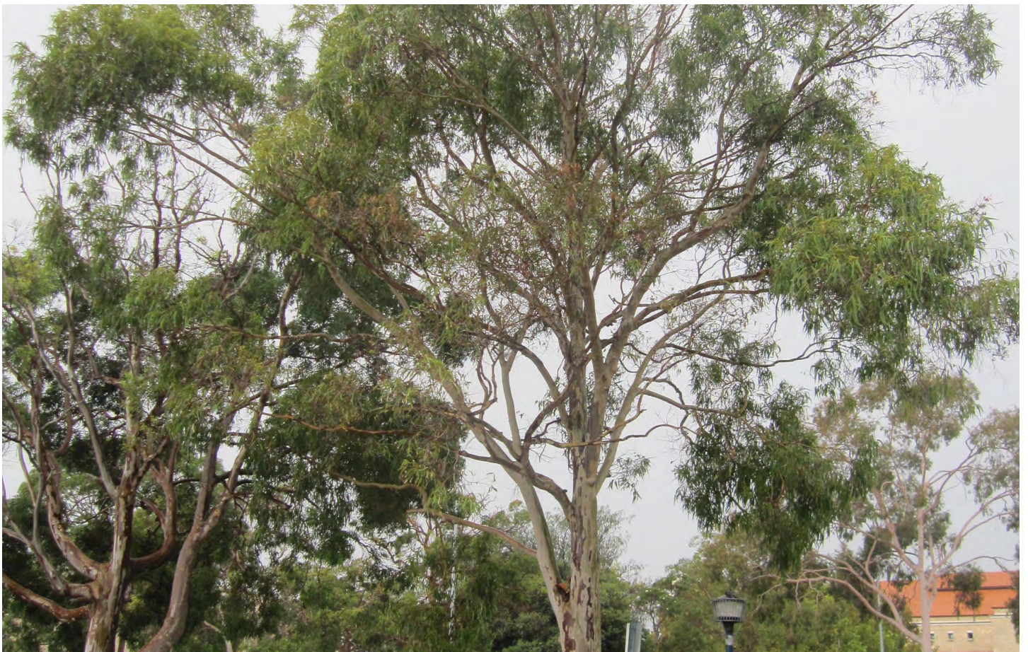
Mature Spotted Gum