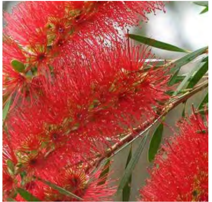
Close-up of Weeping Bottlebrush flowers

An abundance of brilliant red bottle-brush like flowers are produced from spring through summer. The flowers attract many native and non-native birds.