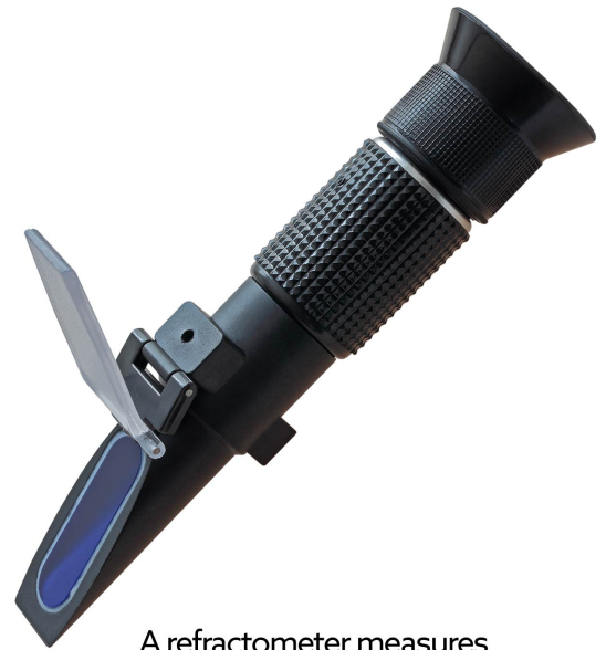
A refractometer measures the specific gravity (or the concentration) of the urine.

Urine cortisol/creatinine ratio. The amount of cortisol being lost in the urine is increased with Cushing's disease. This cortisol can be measured and compared to the amount of creatinine, a normally occurring urinary component that is produced at a constant rate. The urine cortisol/creatinine ratio is usually elevated with Cushing's disease. However, stress and other illnesses may also increase this ratio. While an increased urine cortisol/creatinine ratio is suggestive of Cushing's disease, it cannot absolutely confirm the diagnosis.