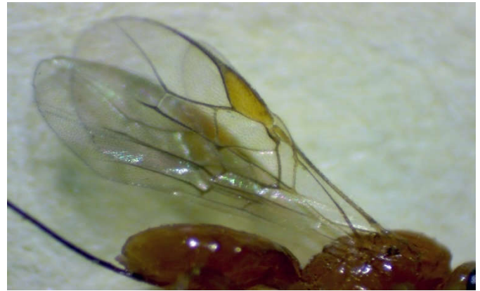
Figure 3. The wing of parasitoid (field sample)

Table (1) showed that the average infestation rate of apricot fruits by C. capitata second and third larval instars which was 72.2% and after incubating the infested Apricot fruits at rearing room conditions we observed a total of 22 adult parasitoids (12 females and 10 males) . Some of these parasitoids as mentioned into materials and methods was sent to Iraqi Natural History Museum, University of Baghdad, Baghdad /Iraq and was classified as Psytalia (=Opius) concolor (Hymenoptera: Braconidae), following the diagnosis characteristic (Forewing vein 2RS about twice the length of r...) (Carmichael, 2005) (figure 1 and 2). This is the first record of this parasitoid in Iraq reported to attack C. capitata (Diptera: Tephritidae) larvae.