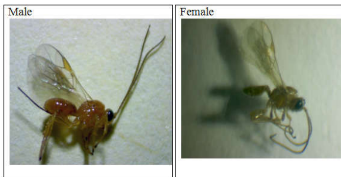
Figure 1. Represents adult male and female of the parasitoid